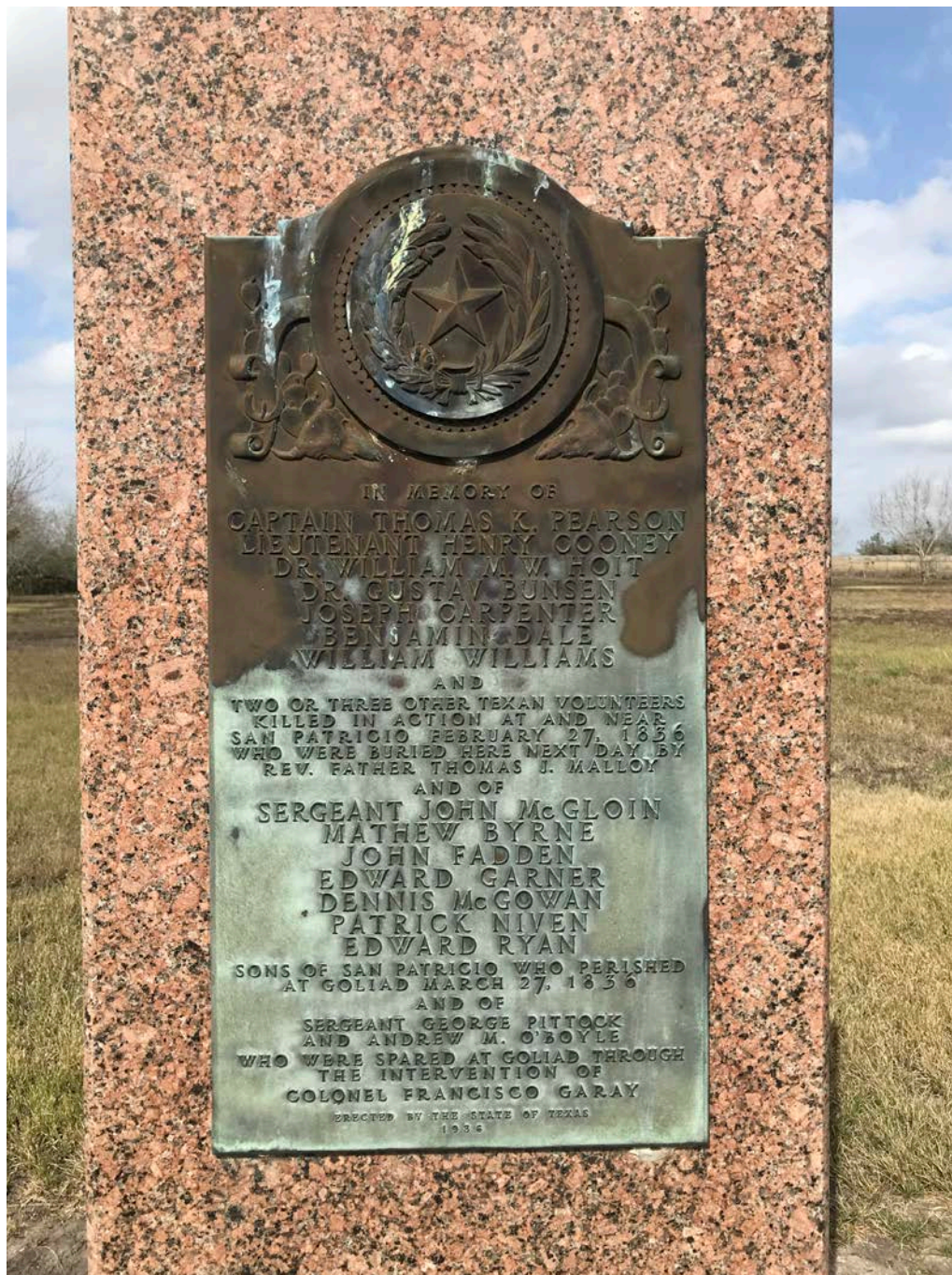
Photo 2: Sons of San Patricio bronze bas-relief plaque showing inscription—camera facing north, February 15, 2018