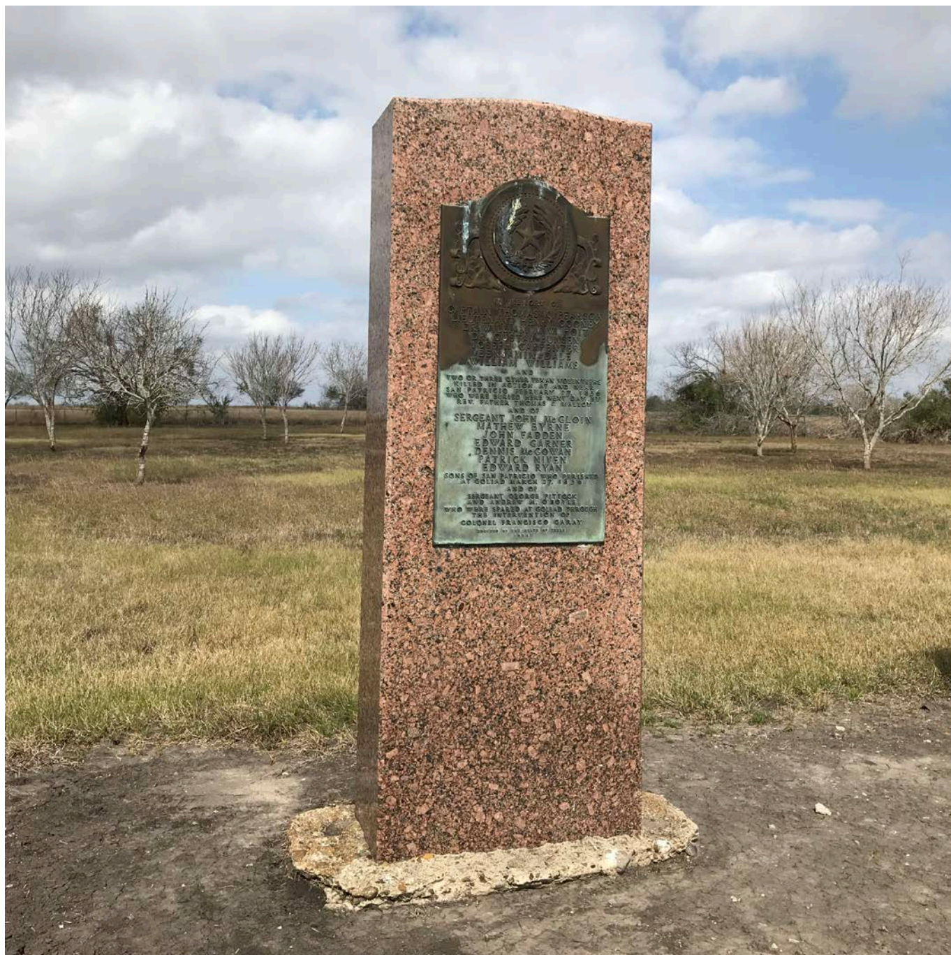
Photo 1: Sons of San Patricio monument—camera facing north, February 15, 2018