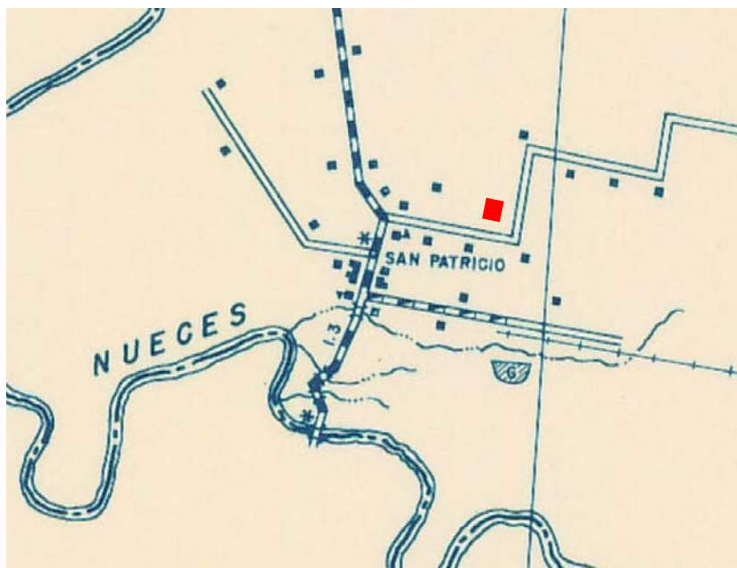
Figure 1: General Highway Map San Patricio County Texas, c.1940. A red box indicates the approximate site of the Old San Patricio Cemetery and the Sons of San Patricio monument.