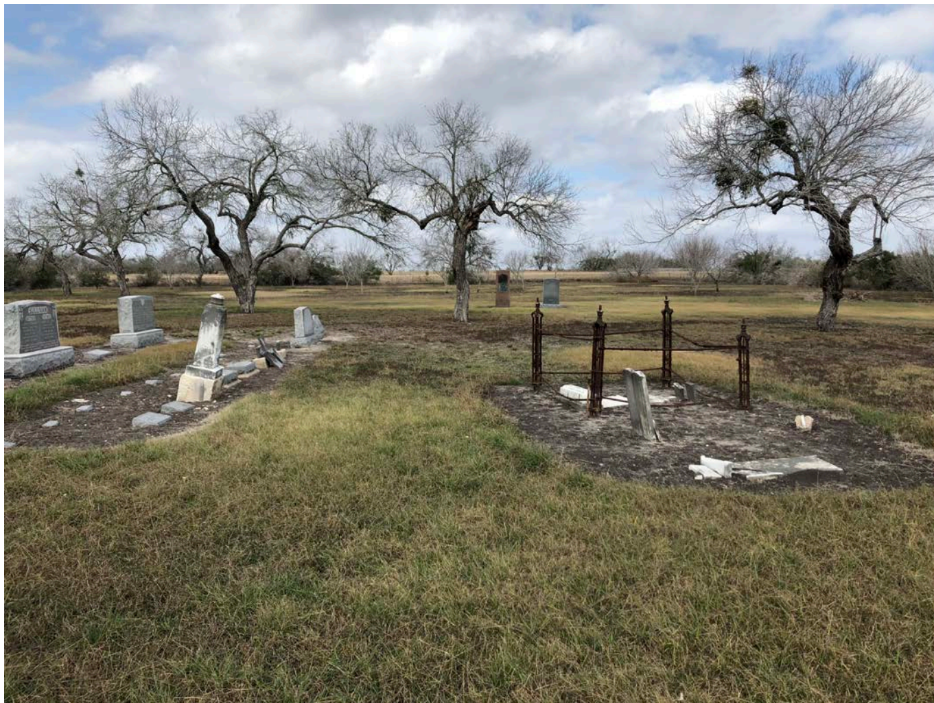
Photo 4: The Sons of San Patricio monument in the Old San Patricio Cemetery—camera facing north, February 15, 2018.