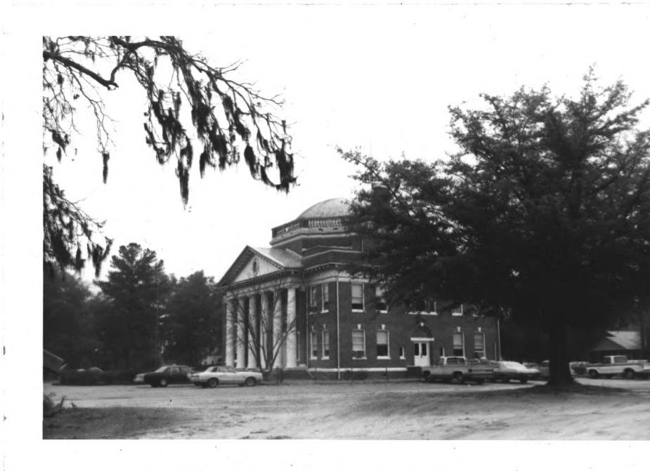
EFFINGHAM COUNTY COURTHOUSE