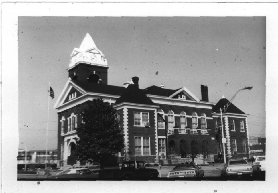
BUTTS COUNTY COURTHOUSE