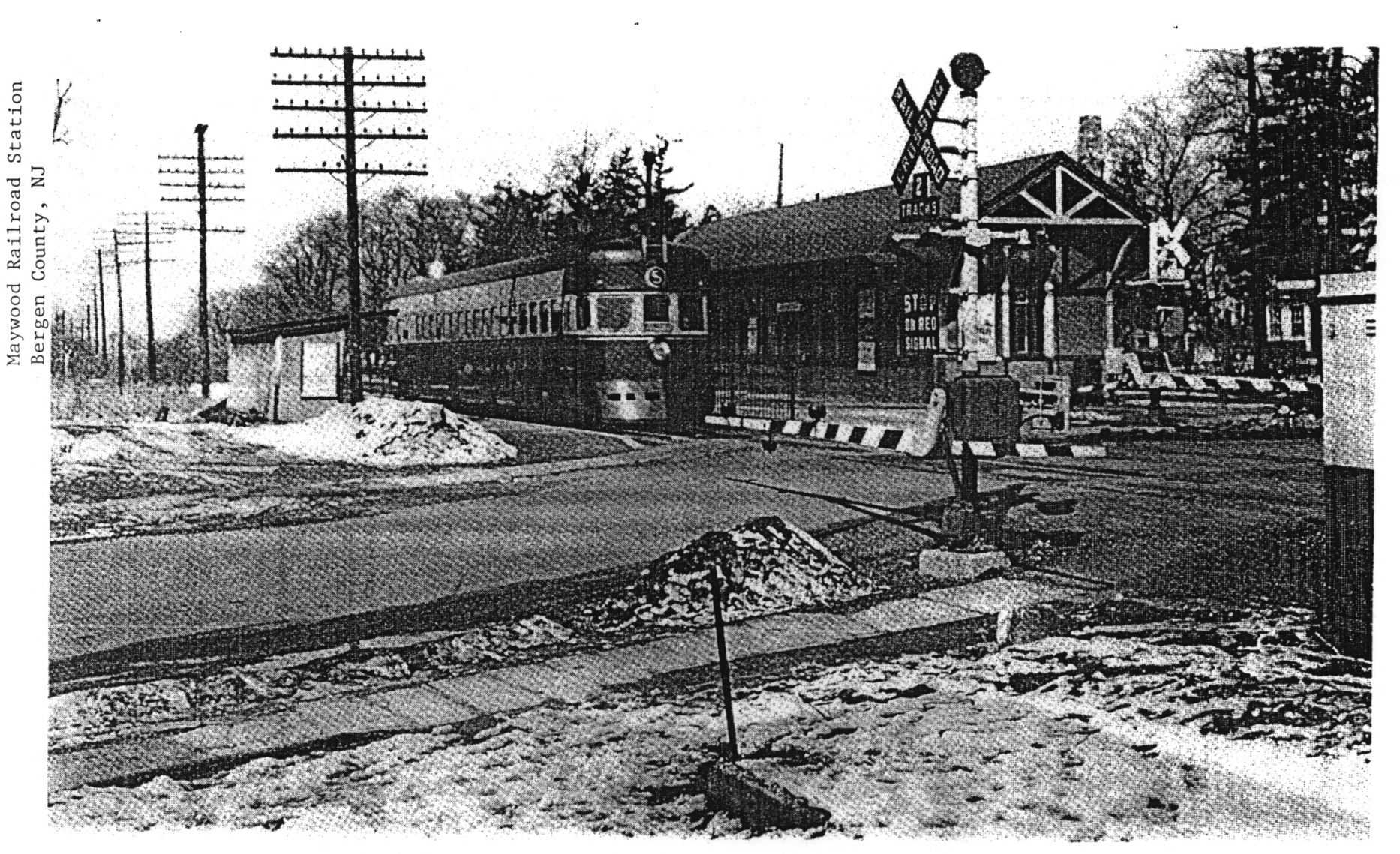
ACF Railcar #1005, eastbound as train #820, leaves Maywood, N.J. March 6, 1948.