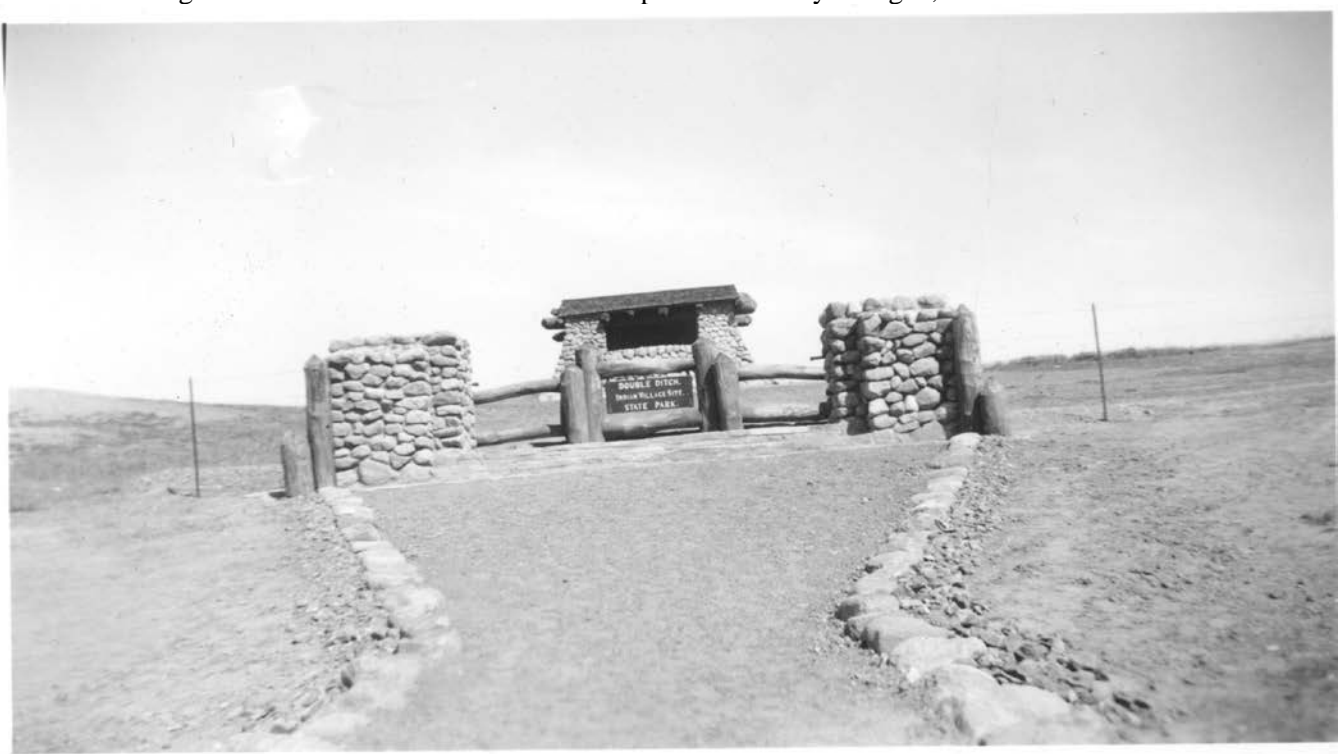
A closer view of the entrance from the west.