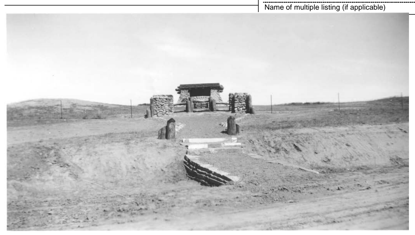
View of the original entrance from the west. 5/1/1938