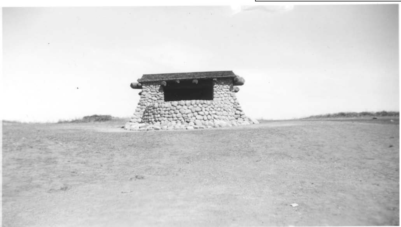
The shelter from the west.

Name of multiple listing (if applicable)