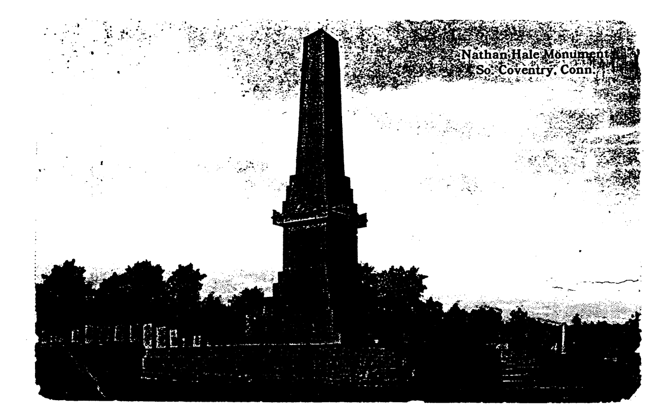
Figure 2. Postcard View, CAPTAIN NATHAN HALE MONUMENT, 1914, Coventry, Connecticut