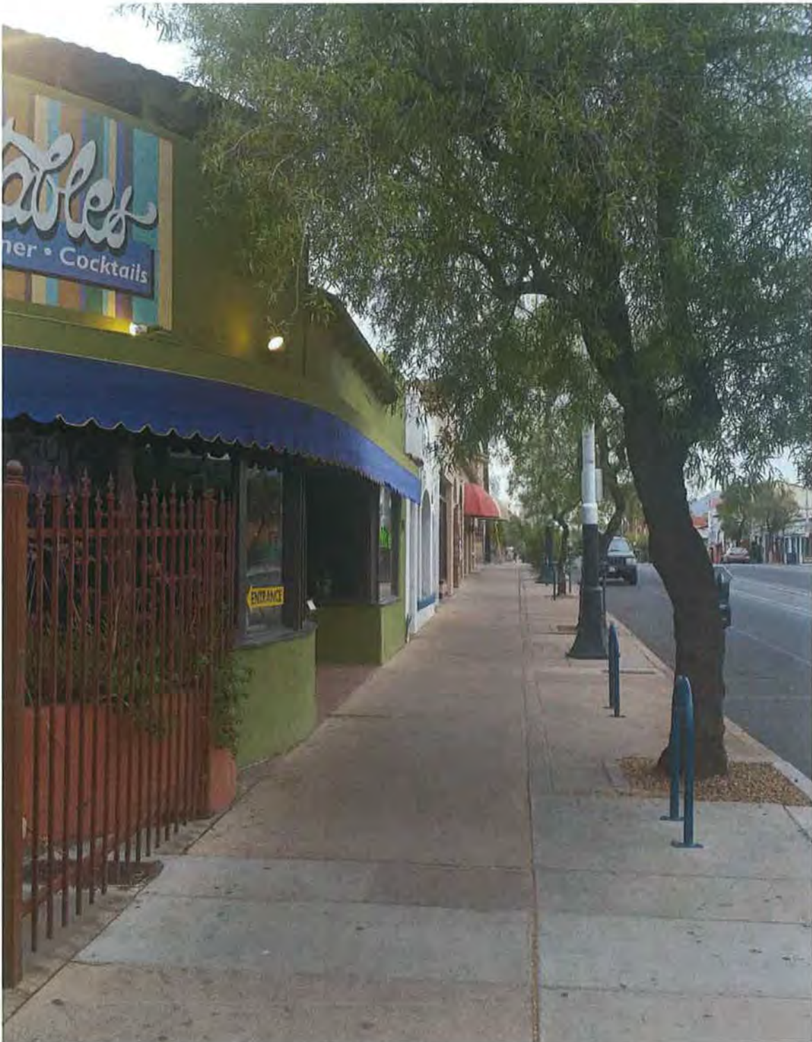
AZ_PimaCounty_FourthAvenueCommercialHistoricDistrict_0014 West side of 4 th Avenue, between 6 th and 5 th Street, looking north.