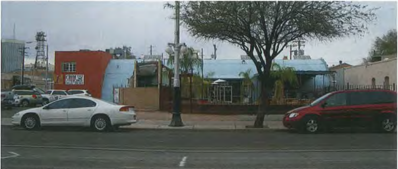
Photograph 6. Example of Contemporary Folk architecture at 305 N Fourth Ave., view facing west (Poster Frost Mirto 2016; AZ_PimaCounty_FourthAvenueCommercialHistoricDistrict_0006)

Contemporary folk houses reflect the need for economical shelter without fashionable design or detailing. These buildings are inexpensive and often prefabricated, many of which are outfitted with appliances and furnishings. In addition, they are often of a narrow linear design, can be placed in any number of locations, and in some cases can be moved easily by towing. Contemporary Folk buildings include Quonset huts, mobile homes, A-frames, and geodesic domes (McAlester and McAlester 2005).