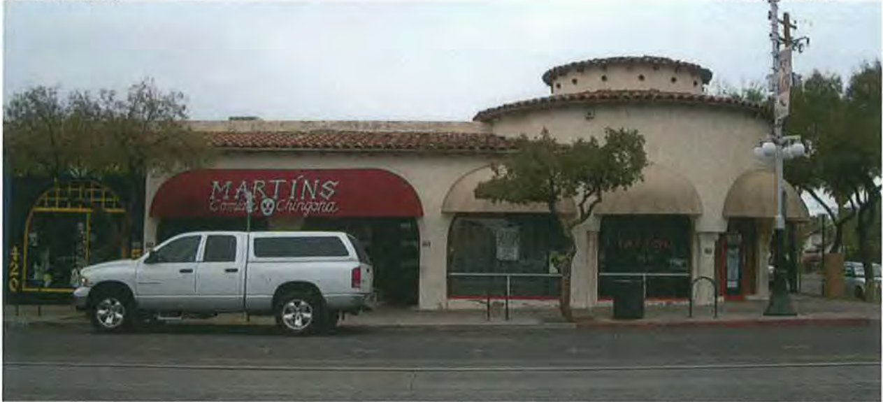
Photograph 2. Example of Spanish Colonial architecture designed by Josias Joesler at 616-618 N Fourth Ave., view facing west (Poster Frost Mirto 2016; AZ_PimaCounty_FourthAvenueCommercialHistoricDistrict_0002)