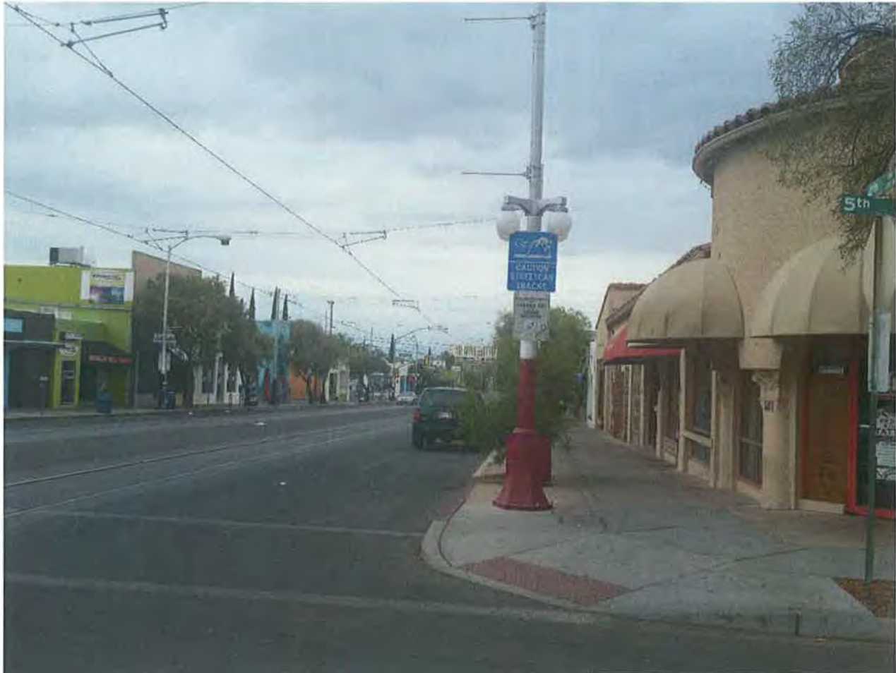
AZ_PimaCounty_FourthAvenueCommercialHistoricDistrict_0016 West side of 4 th Avenue, at 5 th Street, looking southeast.