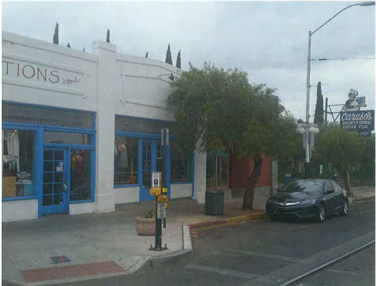
AZ_PimaCounty_FourthAvenueCommercialHistoricDistrict_0013 East side of 4 th Avenue, at 6 th Street, looking southeast.