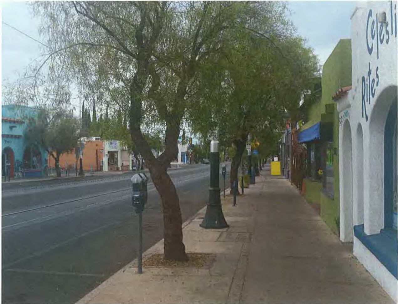
AZ_PimaCounty_FourthAvenueCommercialHistoricDistrict_0015 West side of 4 th Avenue, between 6 th and 5 th Street, looking southeast.