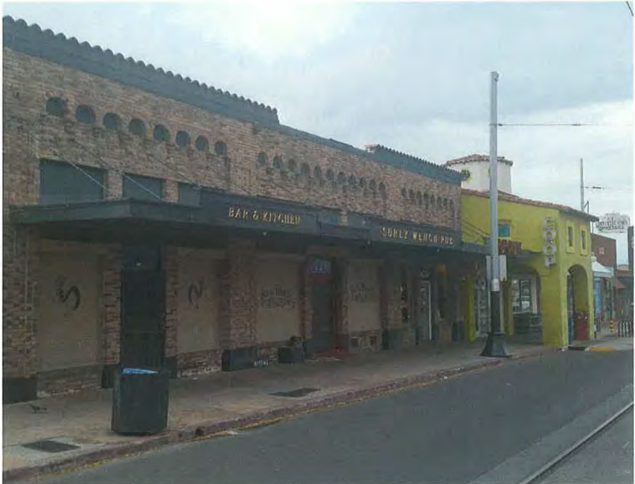
AZ_PimaCounty_FourthAvenueCommercialHistoricDistrict_0012 East side of 4 th Avenue, between 7 th and 6 th Street, looking southeast.