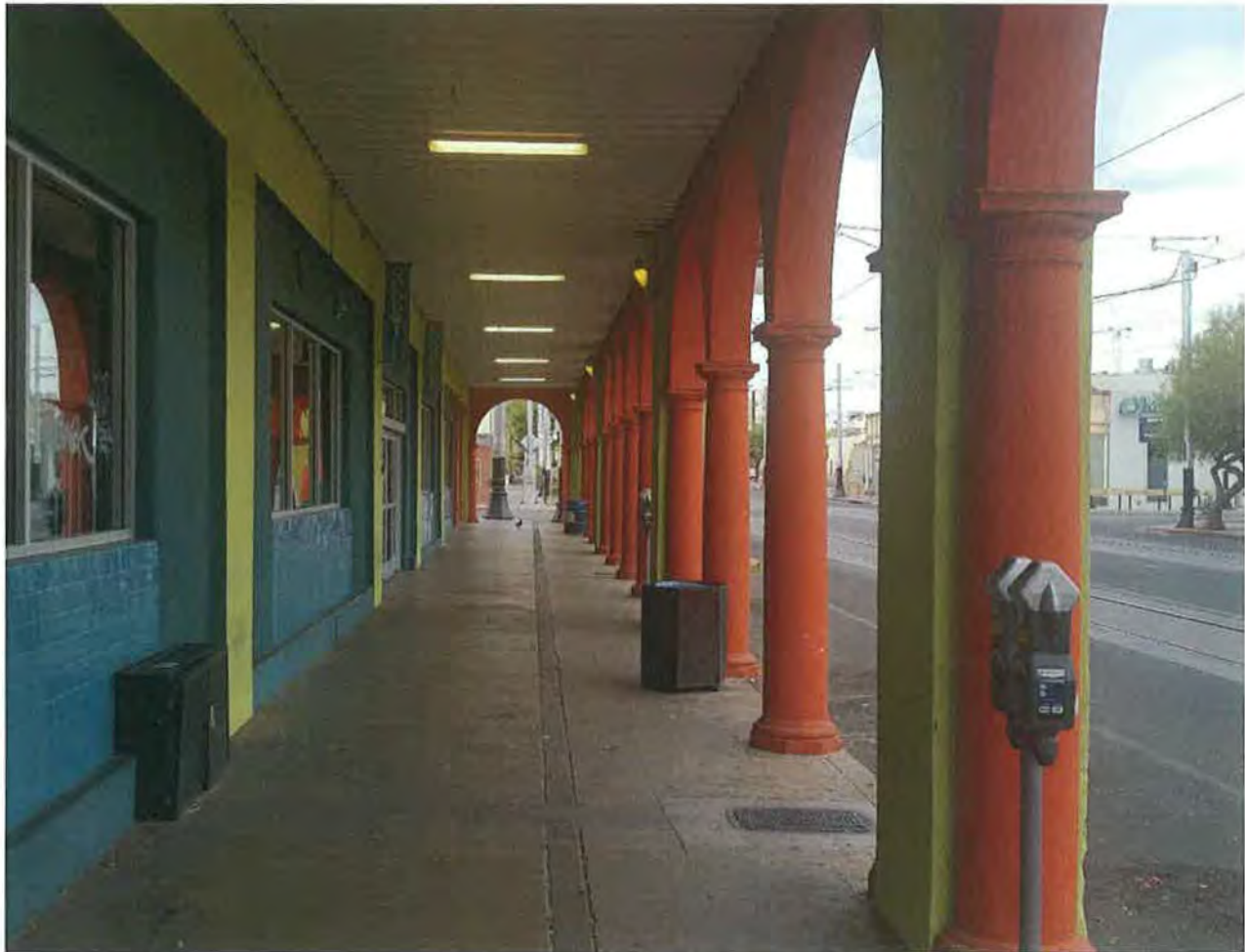
AZ_PimaCounty_FourthAvenueCommercialHistoricDistrict_0009 East side of 4 th Avenue, between 8 th and 7 th Street, looking south.