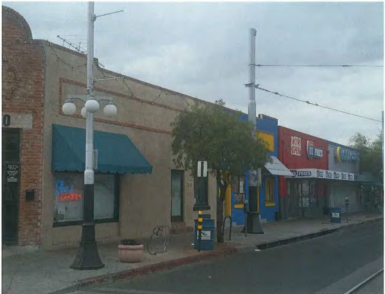
AZ_PimaCounty_FourthAvenueCommercialHistoricDistrict_0010 East side of 4 th Avenue, between 8 th and 7 th Street, looking southeast.