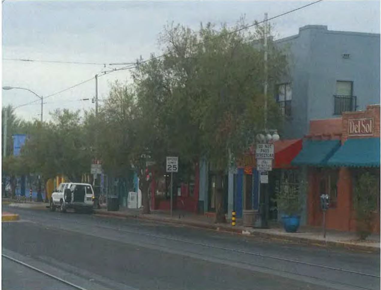
AZ_PimaCounty_FourthAvenueCommercialHistoricDistrict_0011 West side of 4 th Avenue, between 7 th and 6 th Street, looking southwest.