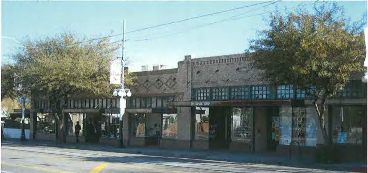
Photograph 5. Example of Victorian Commercial architecture located at 210-224 N. Fourth Ave., view facing northeast (Poster Frost Mirto 2016; AZ_PimaCounty_FourthAvenueCommercialHistoricDistrict_0005)