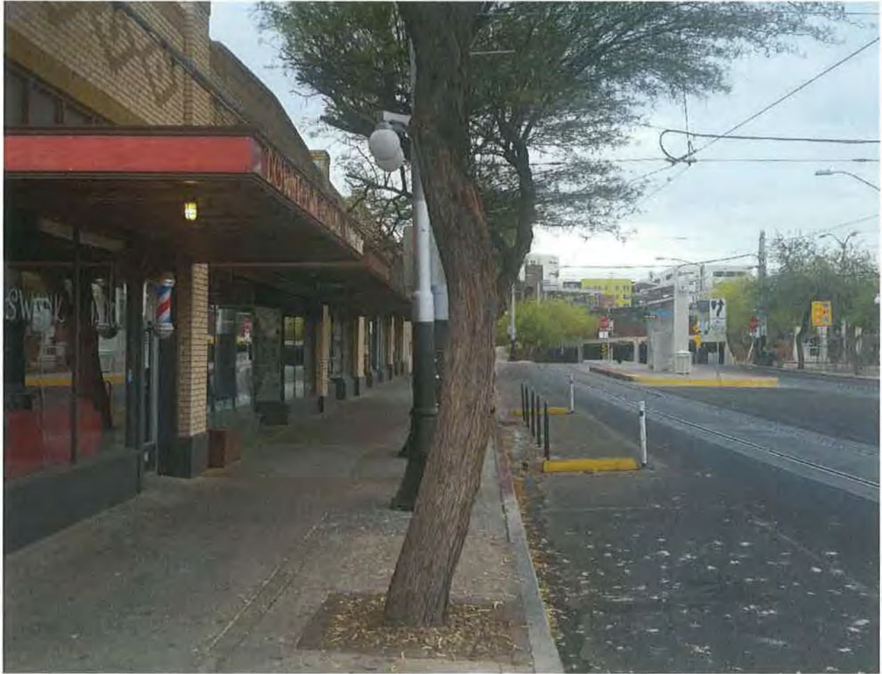
AZ_PimaCounty_FourthAvenueCommercialHistoricDistrict_0008 East side of 4 th Avenue, between 8 th and 9 th Street, looking south.