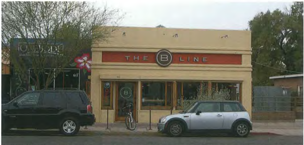
Photograph 3. Example of Art Moderne architecture at 621 N Fourth Ave., view facing west (Poster Frost Mirto 2016; AZ_PimaCounty_FourthAvenueCommercialHistoricDistrict_0003).

This architectural style features soft or rounded corners, flat roofs, smooth wall finishes without ornamentation, and horizontal bands of windows and coping to create a streamlined appearance. This streamlined appearance is a key feature of this architectural style and is achieved by curved glass around building corners, curved canopies, and use of aluminum and stainless steel in window and doorframes.