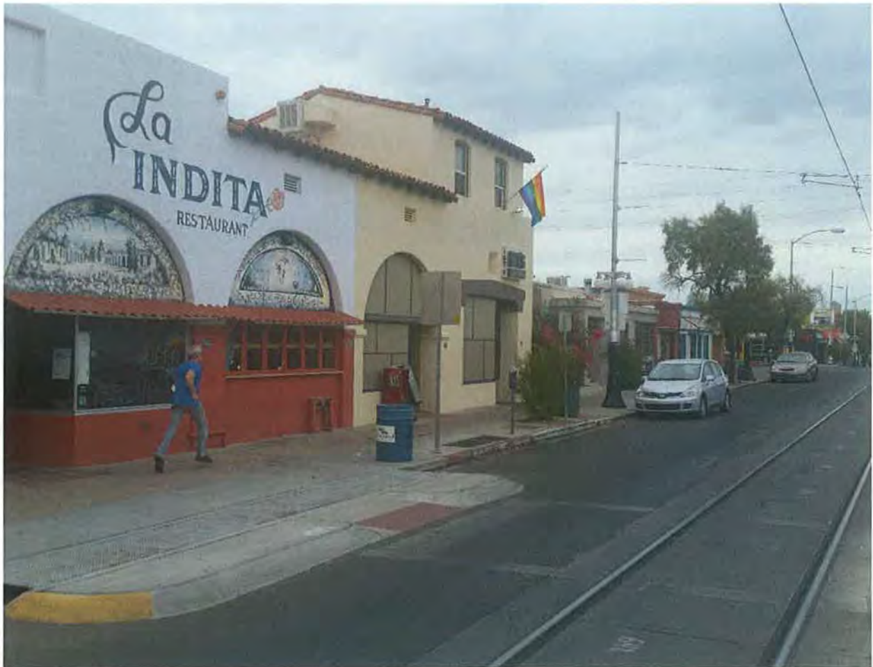
AZ_PimaCounty_FourthAvenueCommercialHistoricDistrict_0017 East side of 4 th Avenue, between 5 th and 4 th Street, looking southeast.