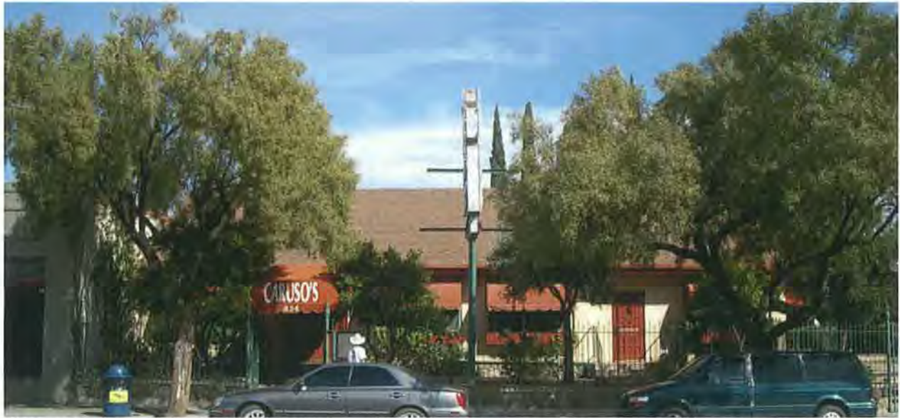
Photograph 4. Example of Character Ranch architecture at 434 N Fourth Ave., view facing east (Poster Frost Mirto 2016; AZ_PimaCounty_FourthAvenueCommercialHistoricDistrict_0004).

Character Ranch is a form of ranch house architecture. Ranch houses are typically single-story buildings, low in profile and with the mass of the house visible from the street. They also exhibit large front yards, visible garages that are often part of the building, large picture windows with shutters, and a low-pitched roof. Character Ranch differs slightly from the typical ranch model through the incorporation of different roof forms, and fanciful trim and ornamental features tacked onto the façade. Character Ranch employs a number of details associated with earlier Period Revival styles.