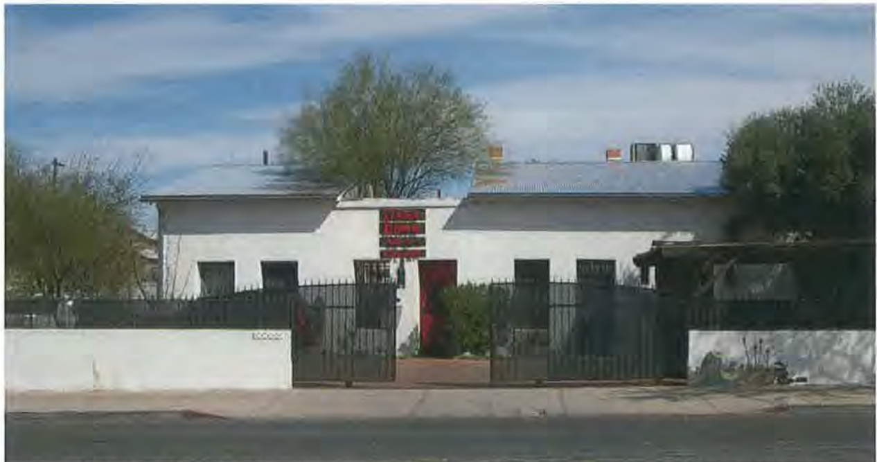
Photograph 1. Example of Transformed Sonoran architecture at 228 N Fourth Ave, view facing east (Poster Frost Mirto 2016; AZ_PimaCounty_FourthAvenueCommercialHistoricDistrict_0001).

Transformed Sonoran refers to buildings modified from the Sonoran tradition. The early Sonoran single-room adobe block house was the basic building unit of the larger urban barrios. Buildings had a simple square or rectangular plan, shared walls with adjacent units, and were constructed of adobe with flat roofs. In Transformed Sonoran, row houses were capped with gable or pyramidal roofs, and outfitted with manufactured materials like fired brick, milled lumber, and tin. In addition, these buildings also featured a deeper set-back than their predecessors located at the front property line or street edge (Nequette and Jeffery 2002).