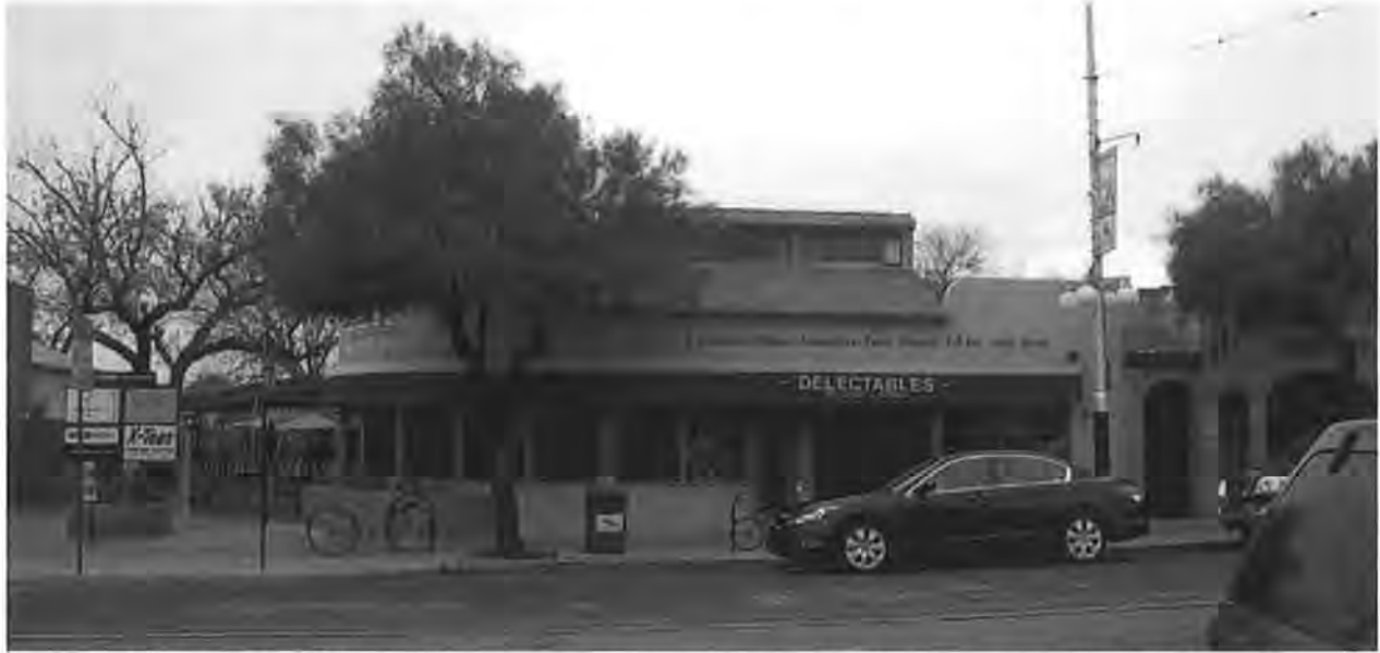
Photograph 7. Example of Modern Commercial architecture designed by Arthur Brown at 527-533 N Fourth Ave., view facing west (Poster Frost Mirto 2016; AZ_PimaCounty_FourthAvenueCommercialHistoricDistrict_0007)

At the heart of modernist ideology is the rejection of the early 19 th century aesthetic of historicism. In general terms, modern architecture is marked by a flat roof, large expanses of glass that blur the line between indoor and outdoor space, the use of steel, no formal façade or “public face”, smooth stucco or curtain wall, little to no ornamentation, and in regional examples the use of local materials (McAlester and McAlester 2005).