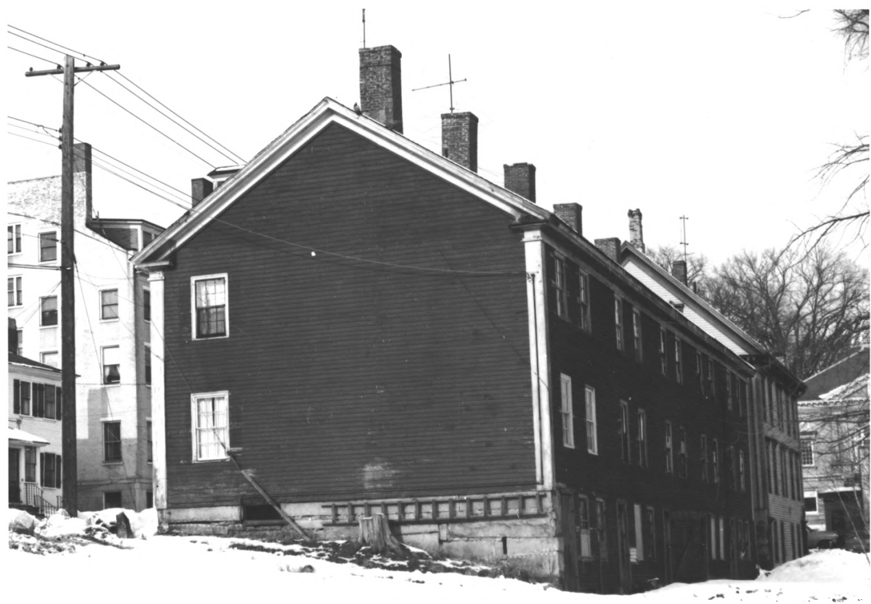
The Row House, Hallowell, Maine (south elevation)