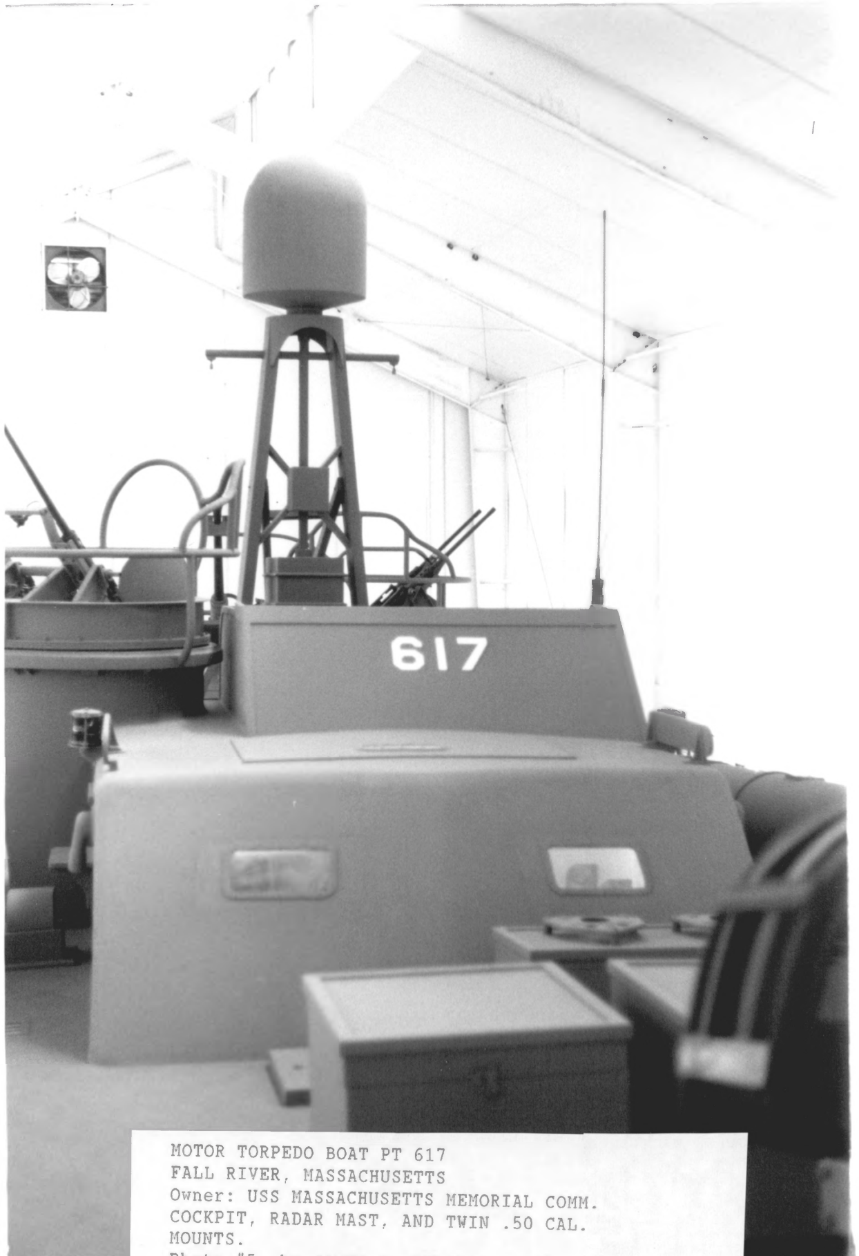
MOTOR TORPEDO BOAT PT 617 FALL RIVER, MASSACHUSETTS Owner: USS MASSACHUSETTS MEMORIAL COMM. COCKPIT, RADAR MAST, AND TWIN .50 CAL. MOUNTS. Photo #5 by JAMES P. DELGADO, 1989 Courtesy of: NATIONAL PARK SERVICE