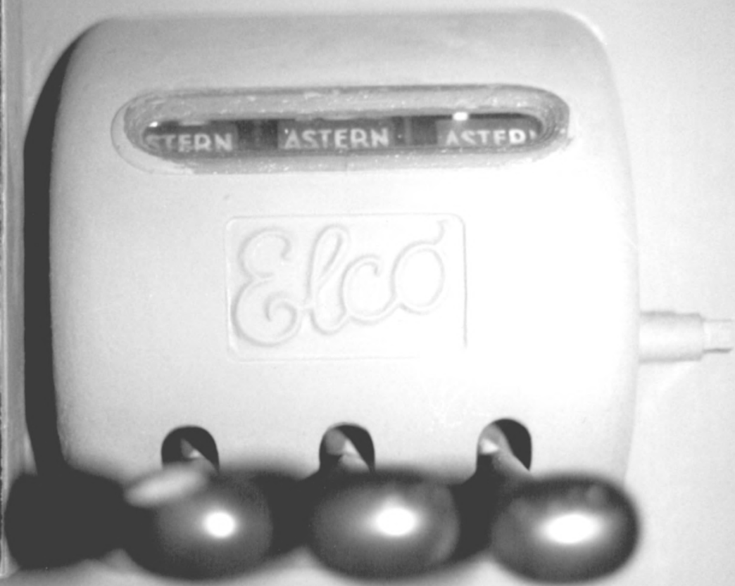
MOTOR TORPEDO BOAT PT 617 FALL RIVER, MASSACHUSETTS Owner: USS MASSACHUSETTS MEMORIAL COMM. ELCO THROTTLES IN THE COCKPIT OF PT 617. Photo #6 by JAMES P. DELGADO, 1989 Courtesy of: NATIONAL PARK SERVICE