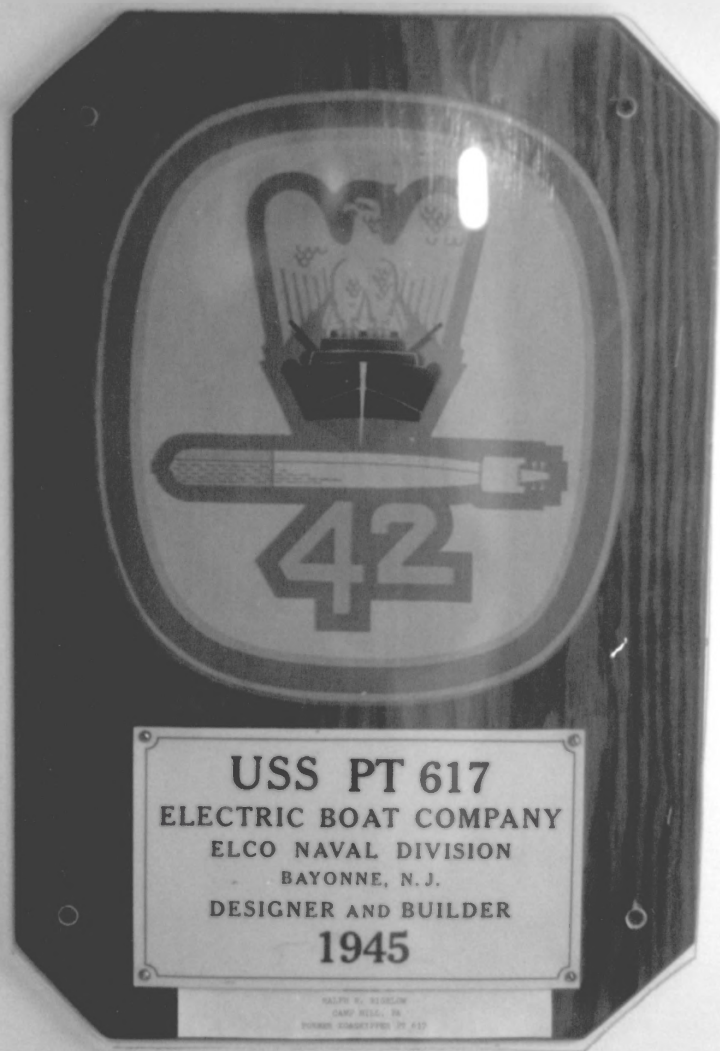
MOTOR TORPEDO BOAT PT 617 FALL RIVER, MASSACHUSETTS Owner: USS MASSACHUSETTS MEMORIAL COMM. ORIGINAL BUILDER'S PLATE AND SQUADRON 42 INSIGNIA ABOARD PT 617. Photo #7 by JAMES P. DELGADO, 1989 Courtesy of: NATIONAL PARK SERVICE