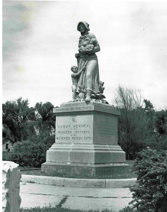
Figure 3 – Historic Views of Council Grove Madonna of the Trail, 1938 (L) and 1948 (R) (Kansas State Historical Society Photo Collection, Madonna of the Trail)