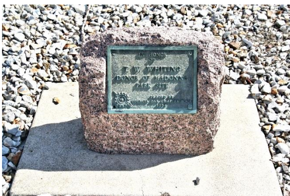
Figure 4 – Current Views of other commemorative markers in the park (Spencer, 2017)