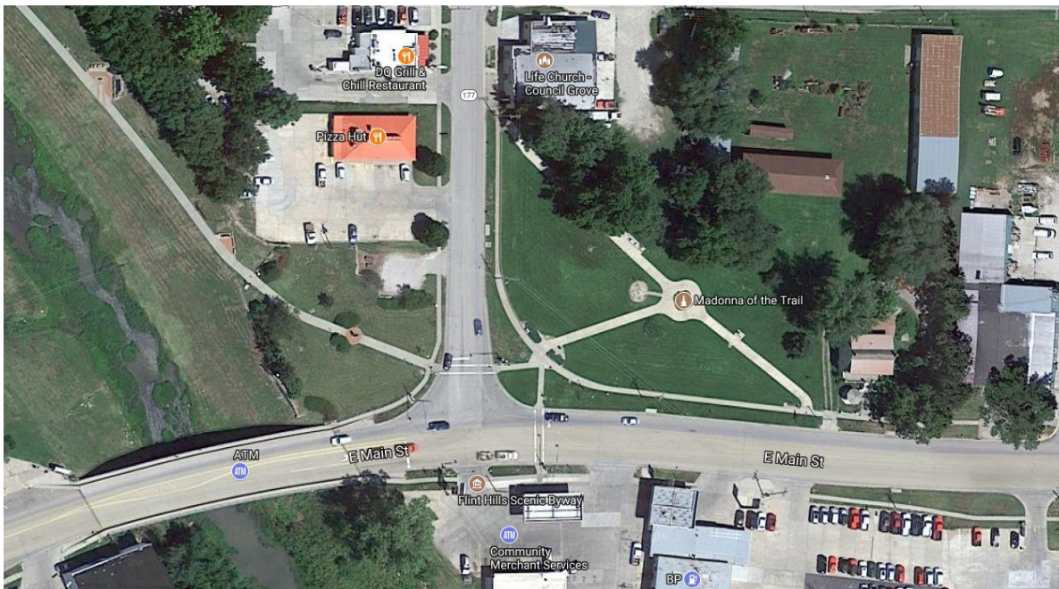
Figure 1 – Context Map and Site Map (Google Maps, 2017) Madonna of the Trail NW Corner of HWY 177 and Hwy 56 Council Grove, Morris County, KS Latitude/Longitude: 38.662071, -96.486912 (WGS 84)