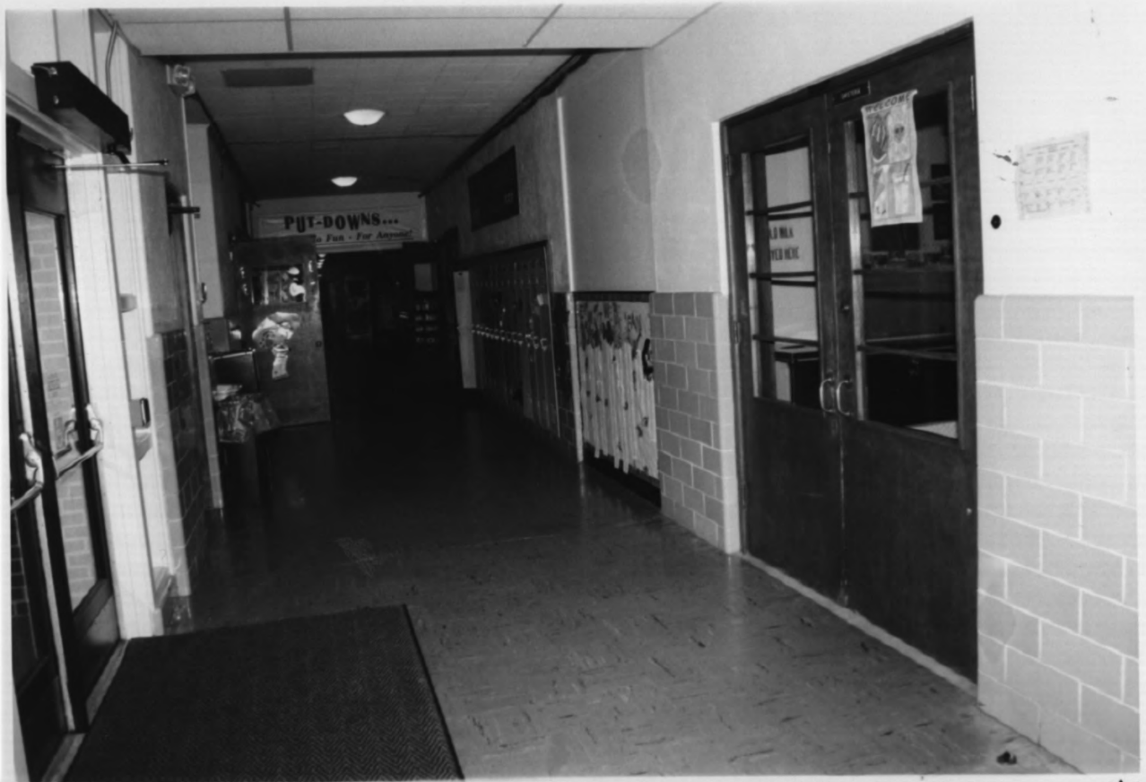
PROTECTION HIGH SCHOOL, COMANCHE COUNTY, KANSAS