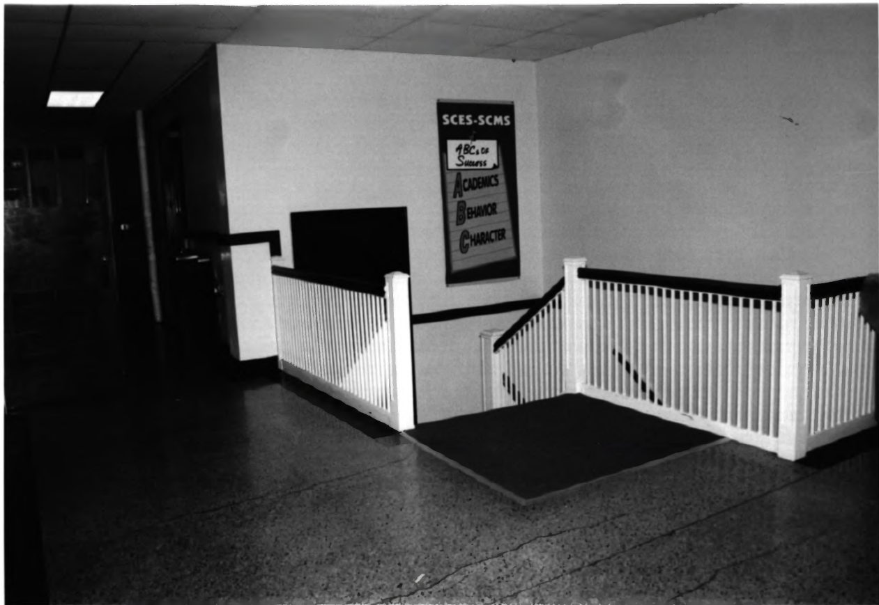
PROTECTION HIGH SCHOOL, COMANCHE COUNTY, KANSAS