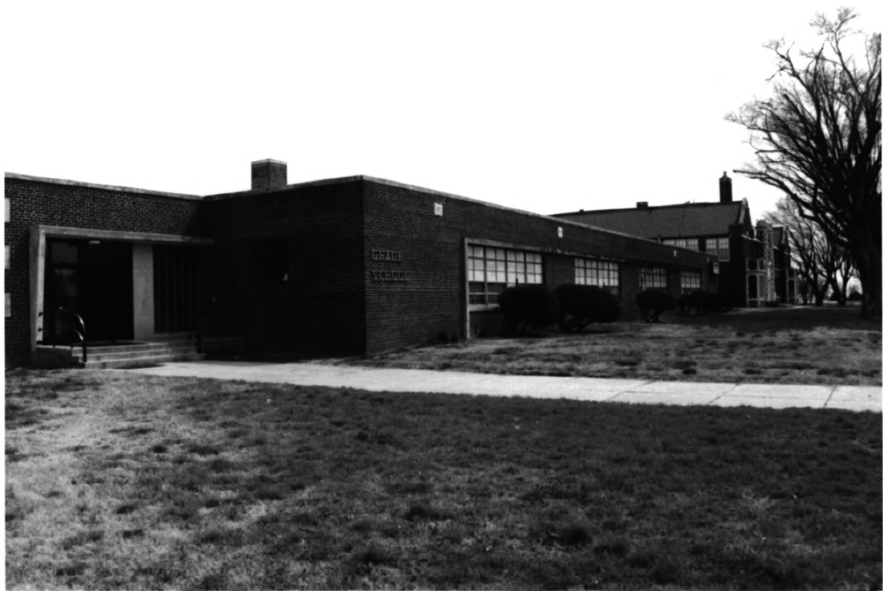
PROTECTION HIGH SCHOOL, COMANCHE COUNTY, KANSAS #10