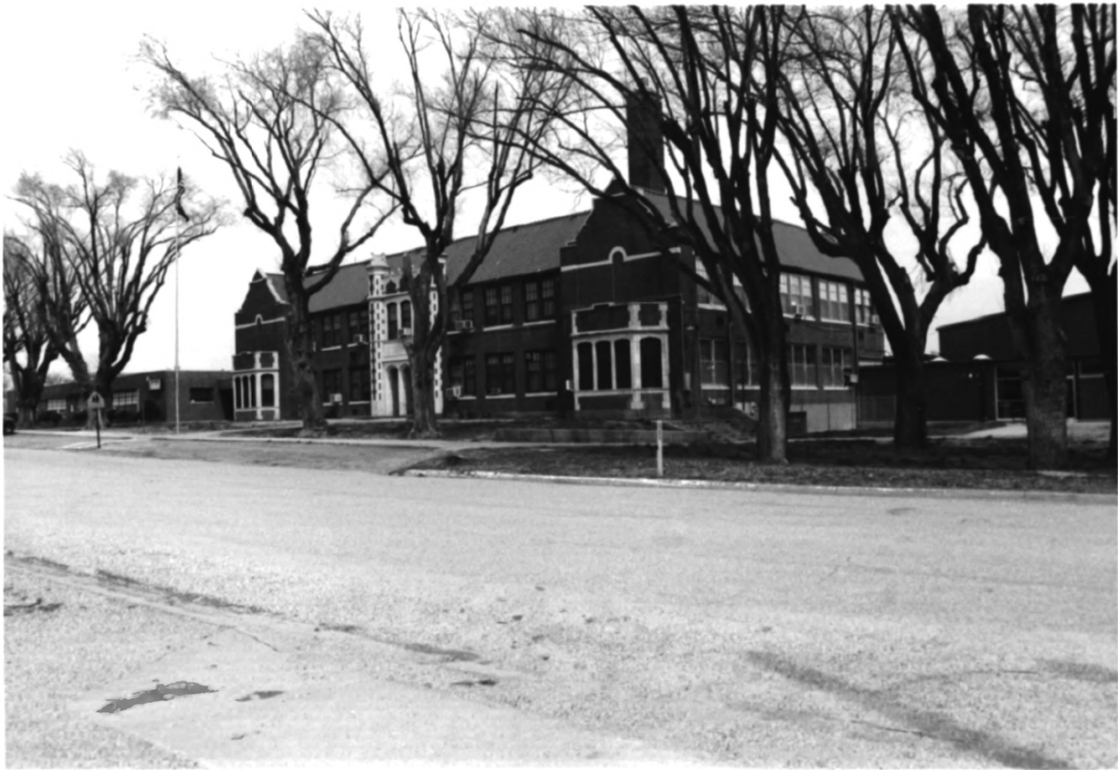
PROTECTION HIGH SCHOOL, COMANCHE COUNTY, KANSAS