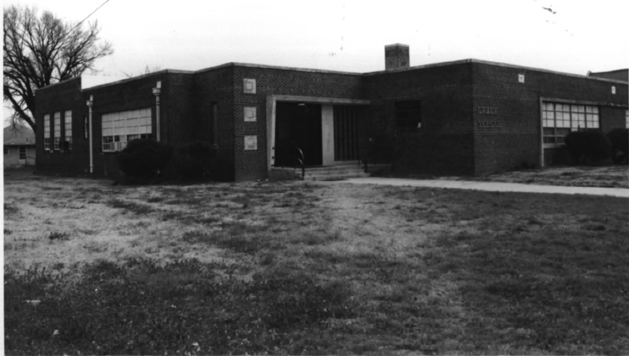
PROTECTION HIGH SCHOOL, COMANCHE COUNTY, KANSAS