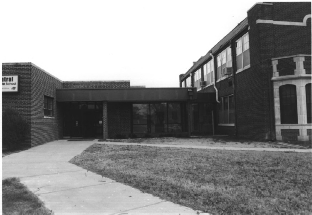
PROTECTION HIGH SCHOOL, COMANCHE COUNTY, KANSAS