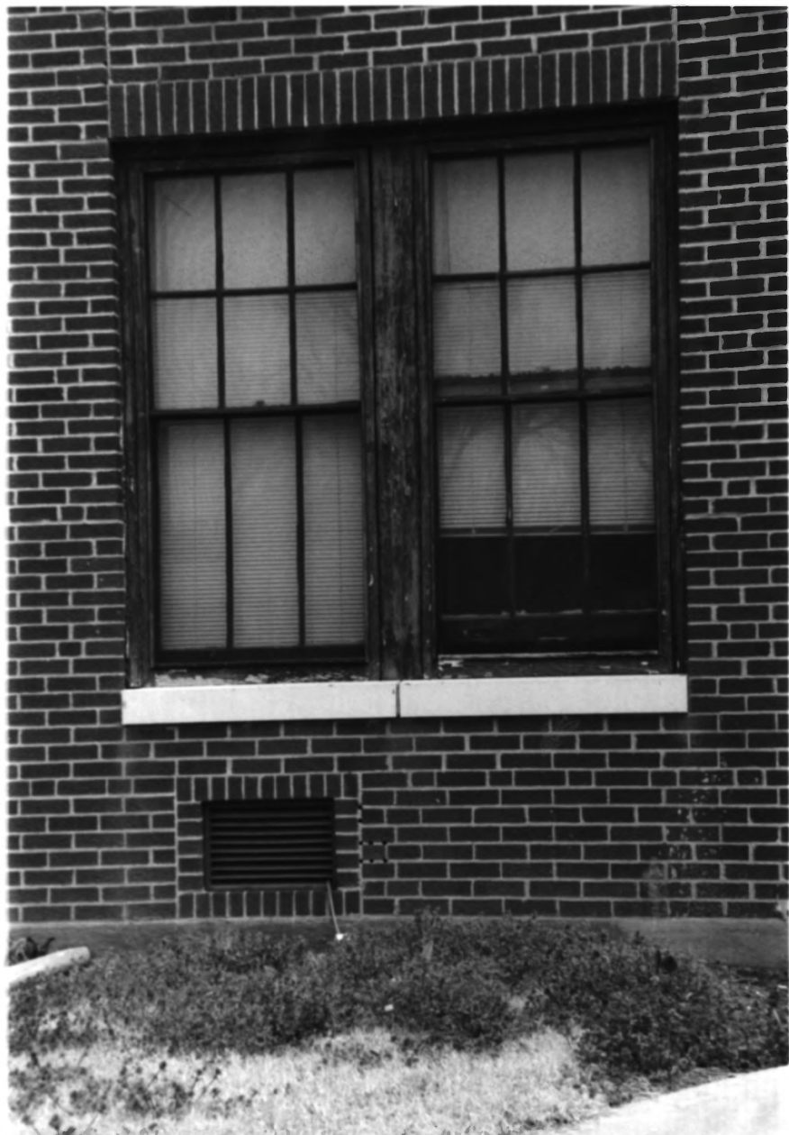
PROTECTION HIGH SCHOOL, COMANCHE COUNTY, KANSAS