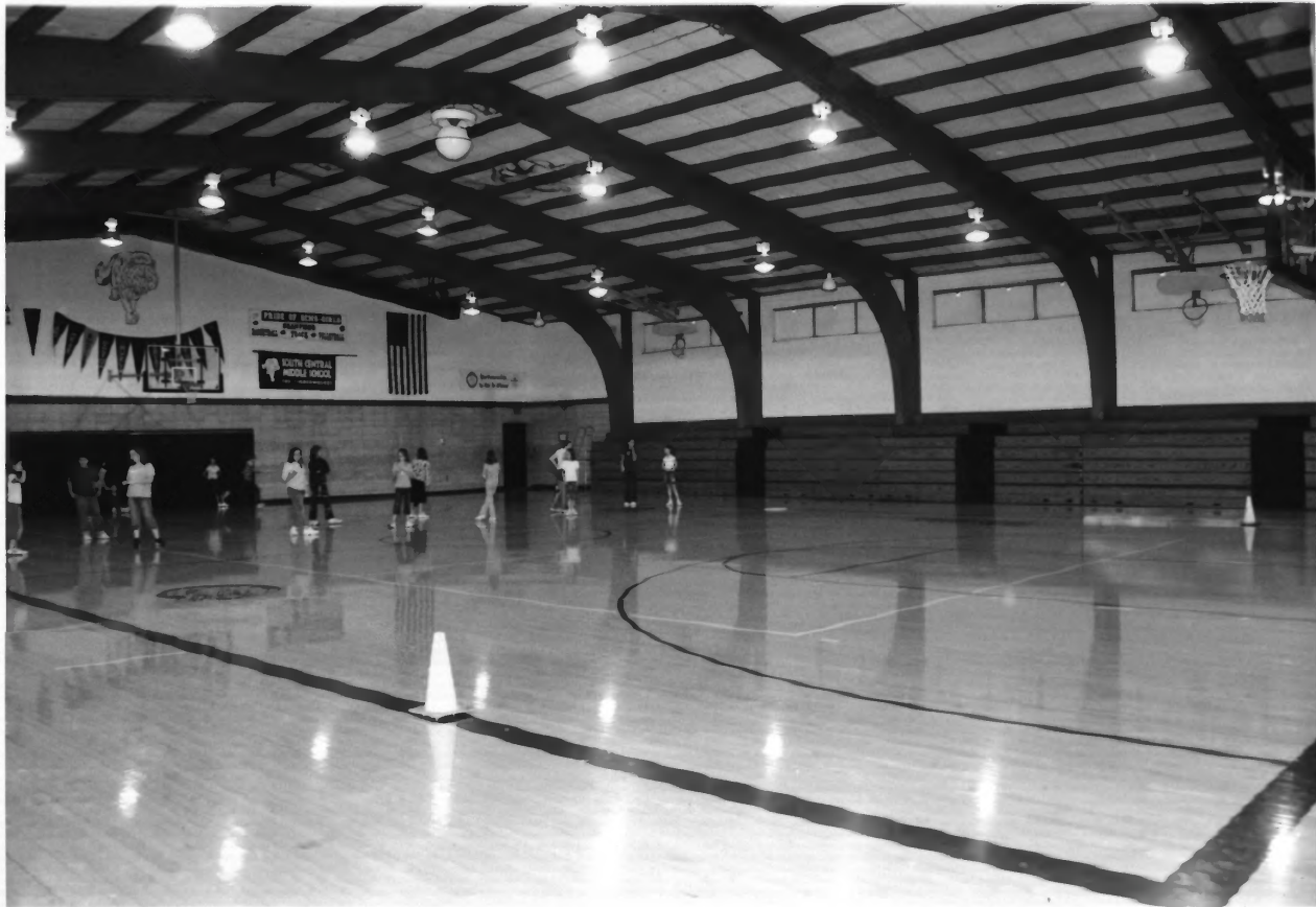
PROTECTION HIGH SCHOOL, LOMANCHE COUNTY, KANSAS