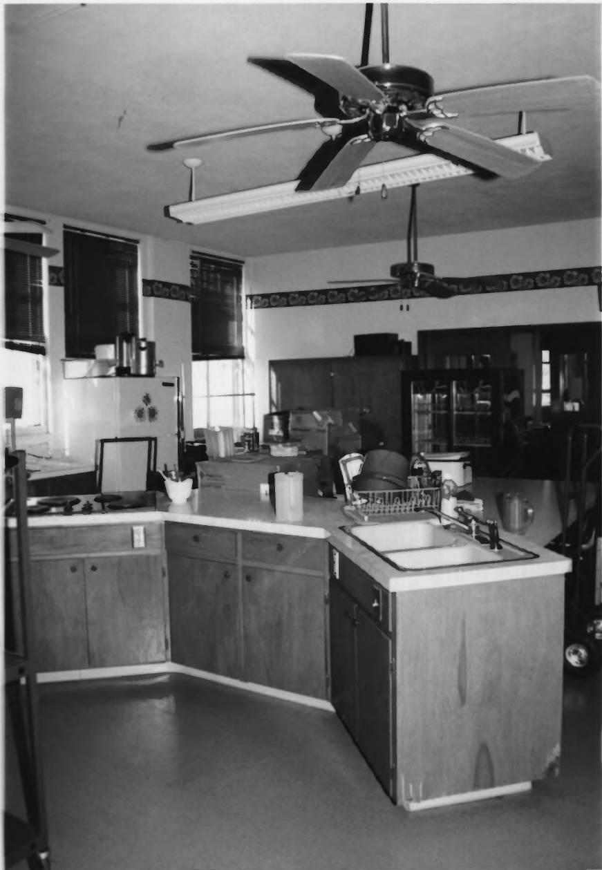
PROTECTION HIGH SCHOOL, COMANCHE COUNTY, KANSAS #17