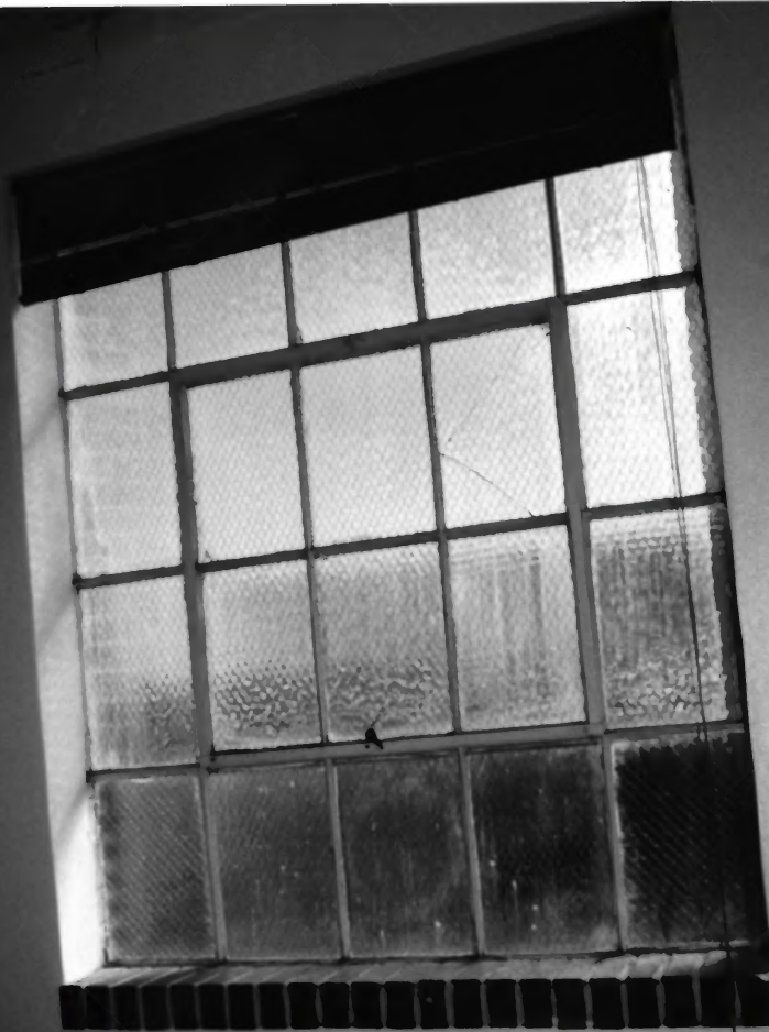
PROTECTION HIGH SCHOOL , COMANCHE COUNTY , KANSAS #21