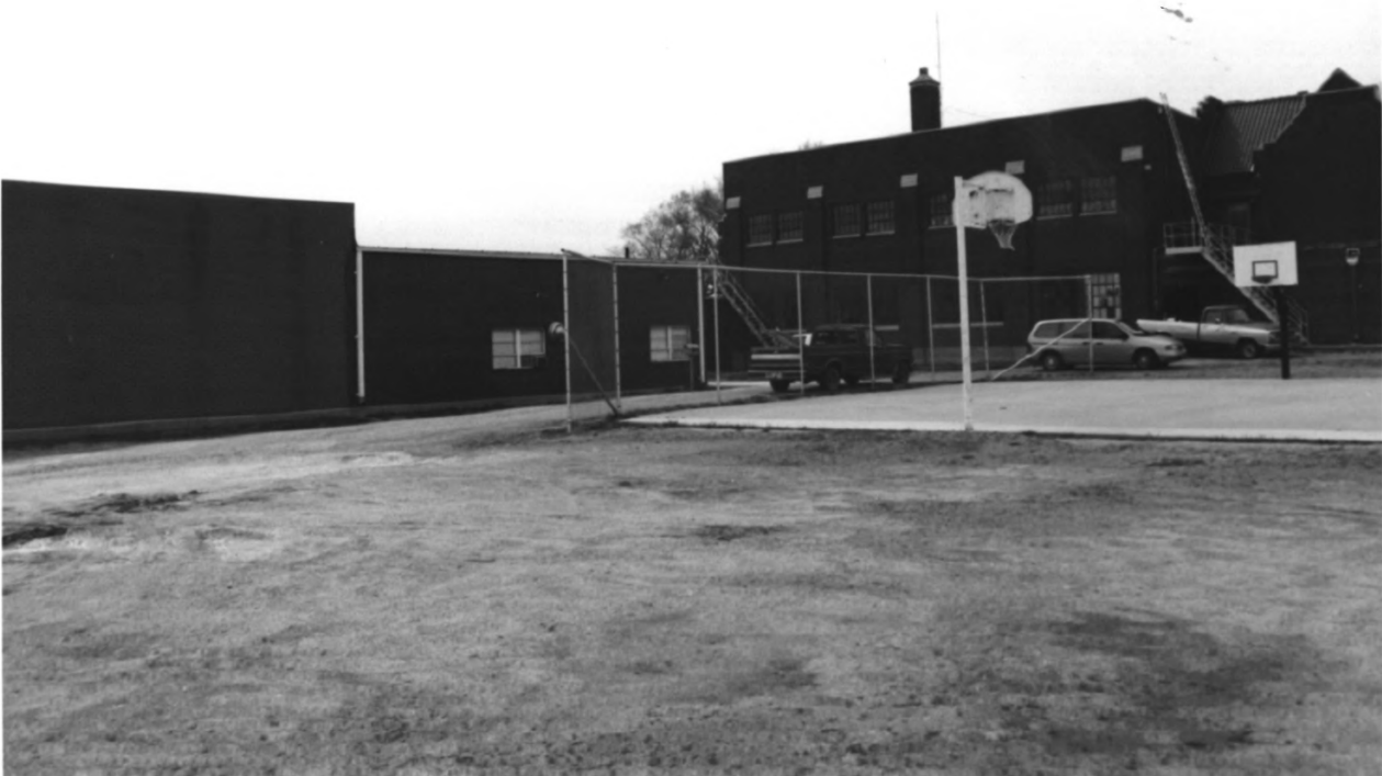
PROTECTION HIGH SCHOOL, COMANCHE COUNTY, KANSAS