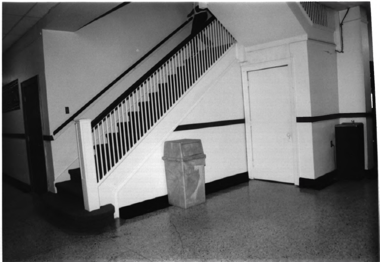
PROTECTION HIGH SCHOOL. COMANCHE COUNTY. KANSAS