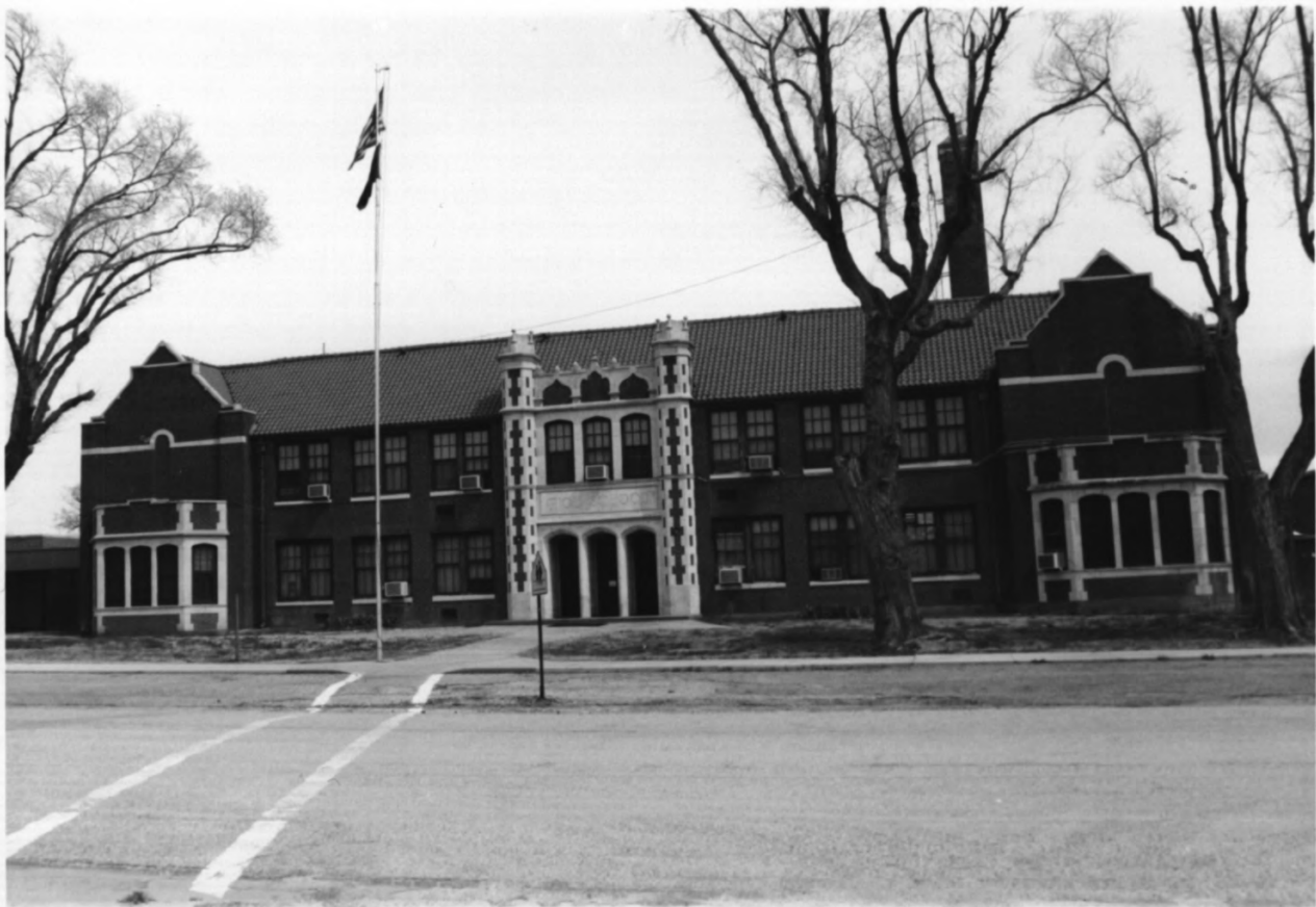
PROTECTION HIGH SCHOOL, COMANCHE COUNTY, KANSAS