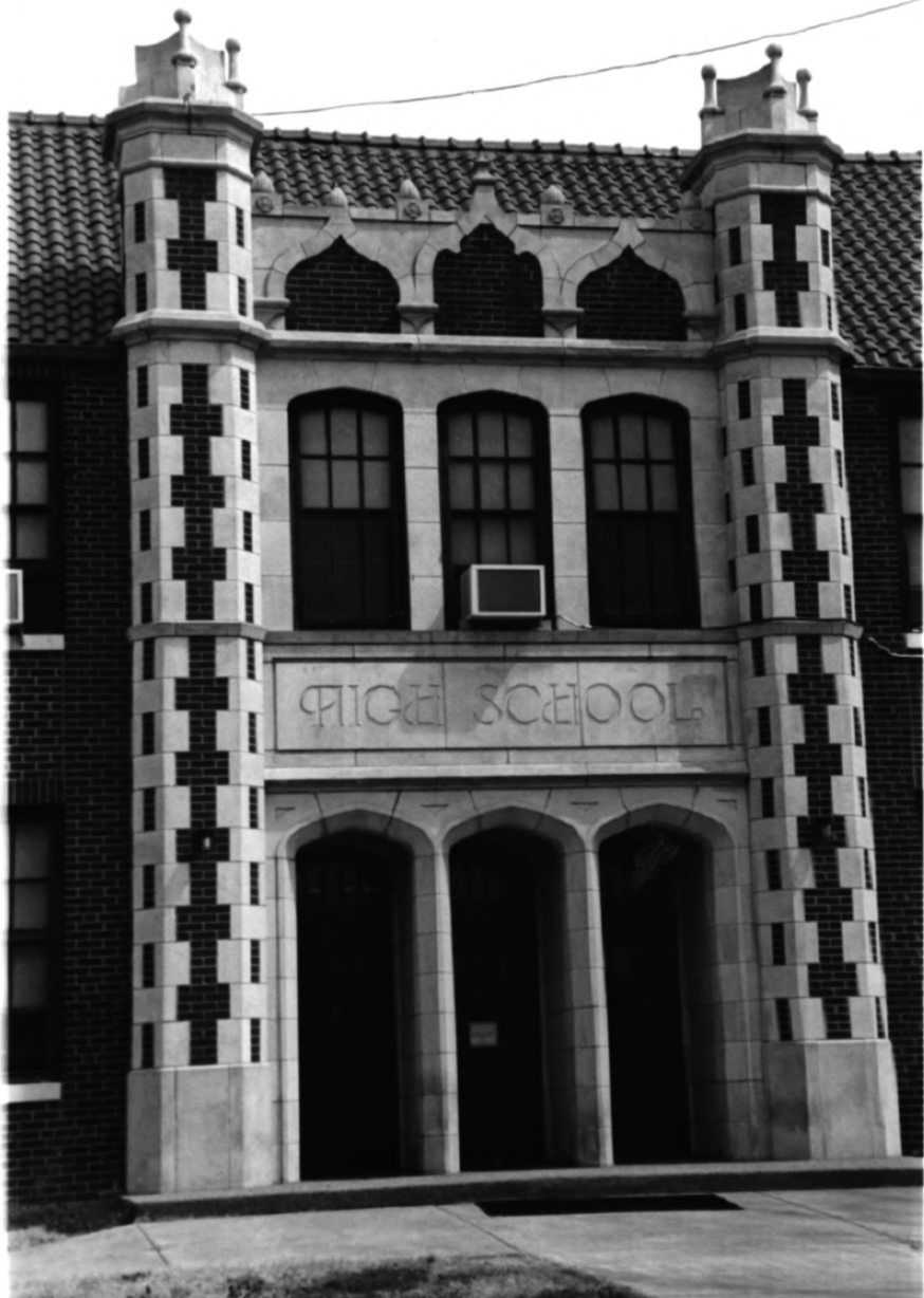
PROTECTION HIGH SCHOOL, COMANCHE COUNTY, KANSAS #2