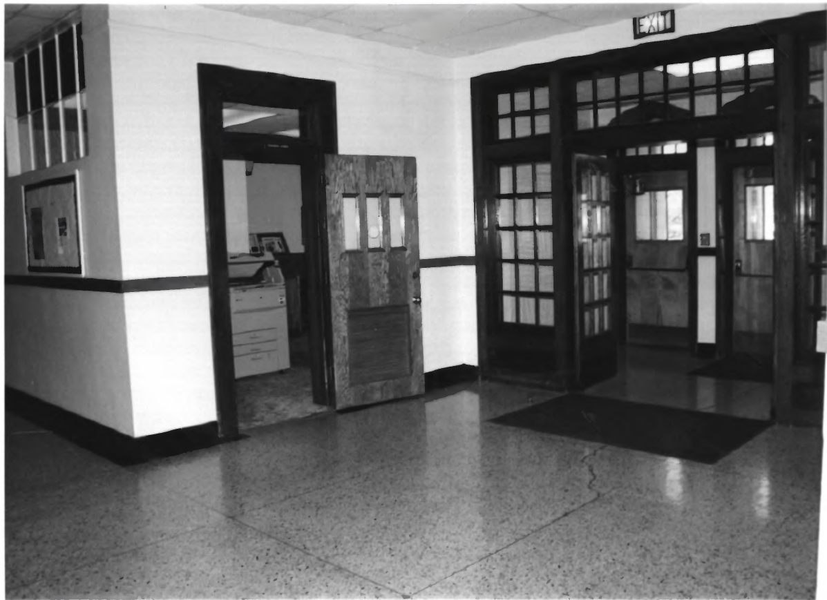
PROTECTION HIGH SCHOOL, COMANCHE COUNTY, KANSAS