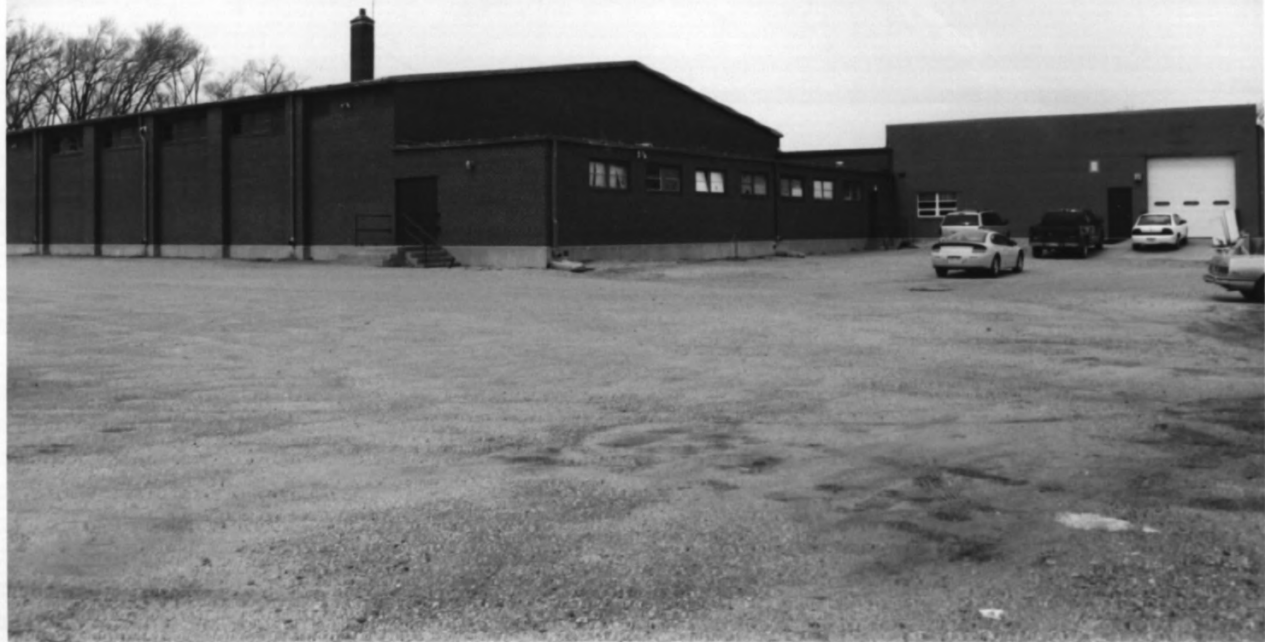
PROTECTION HIGH SCHOOL, COMANCHE COUNTY, KANSAS