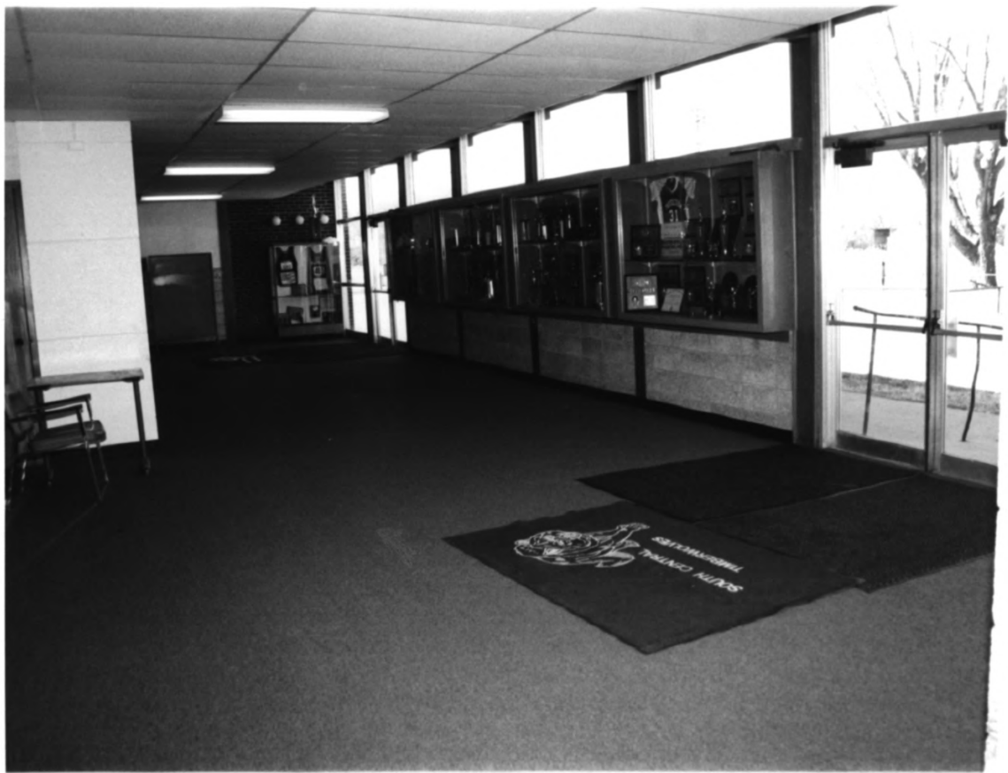
PROTECTION HIGH SCHOOL, COMANCHE COUNTY, KANSAS