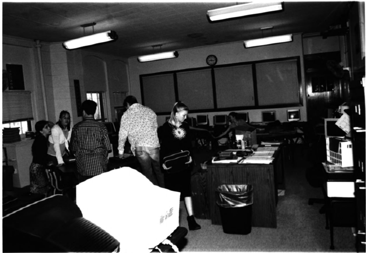
PROTECTION HIGH SCHOOL, COMANCHE COUNTY, KANSAS