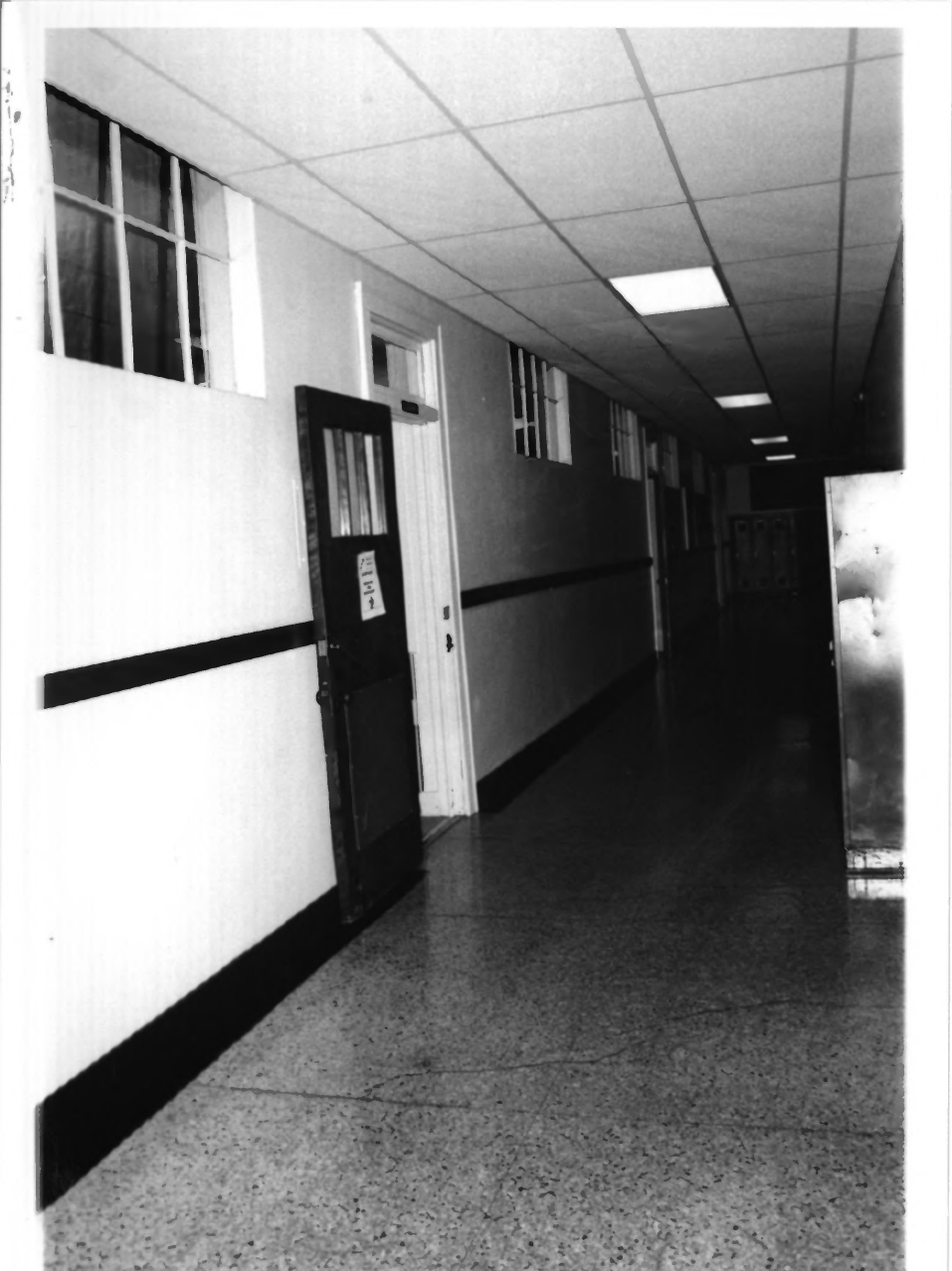
PROTECTION HIGH SCHOOL, COMANCHE COUNTY, KANSAS #12