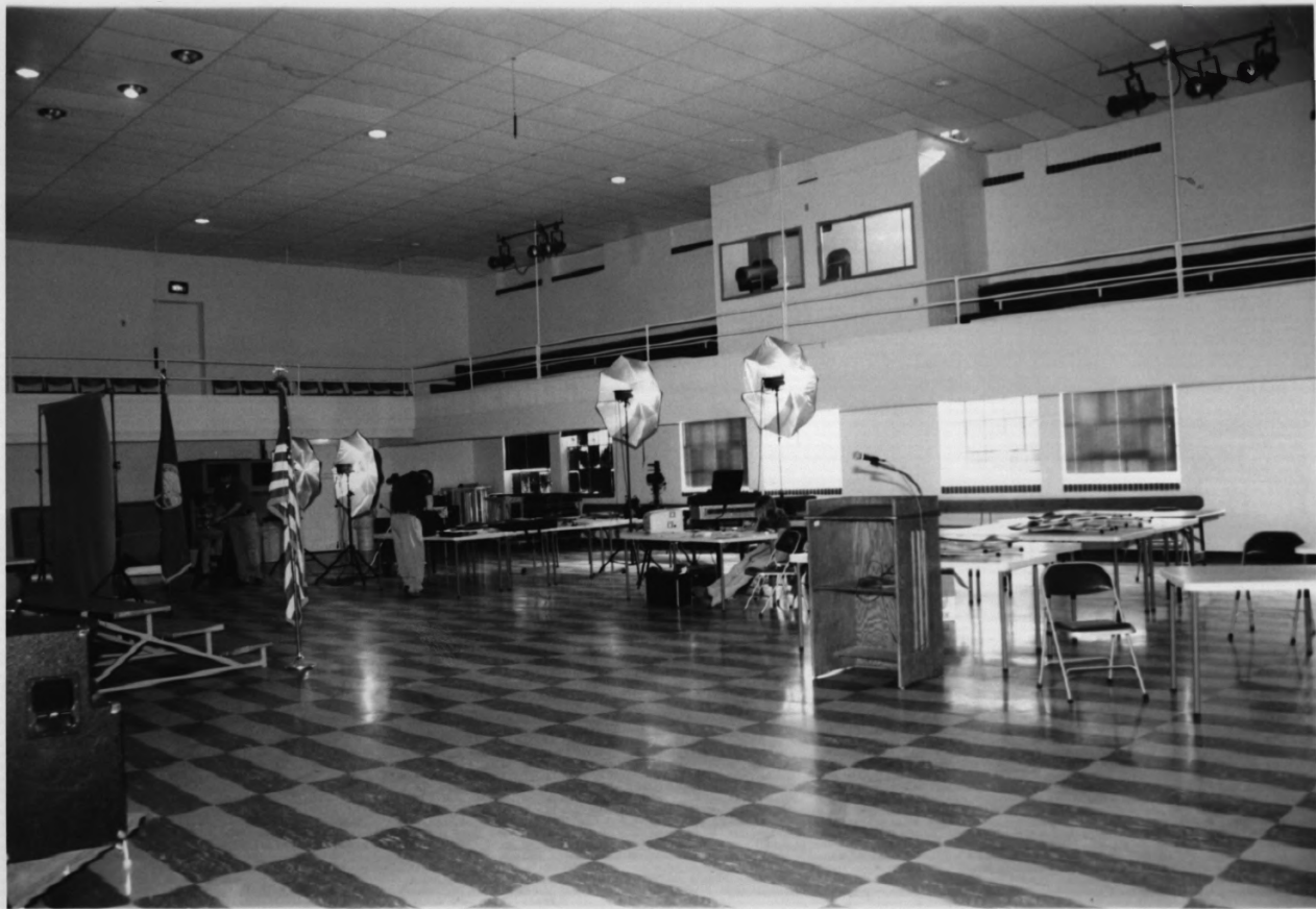
PROTECTION HIGH SCHOOL, COMANCHE COUNTY, KANSAS