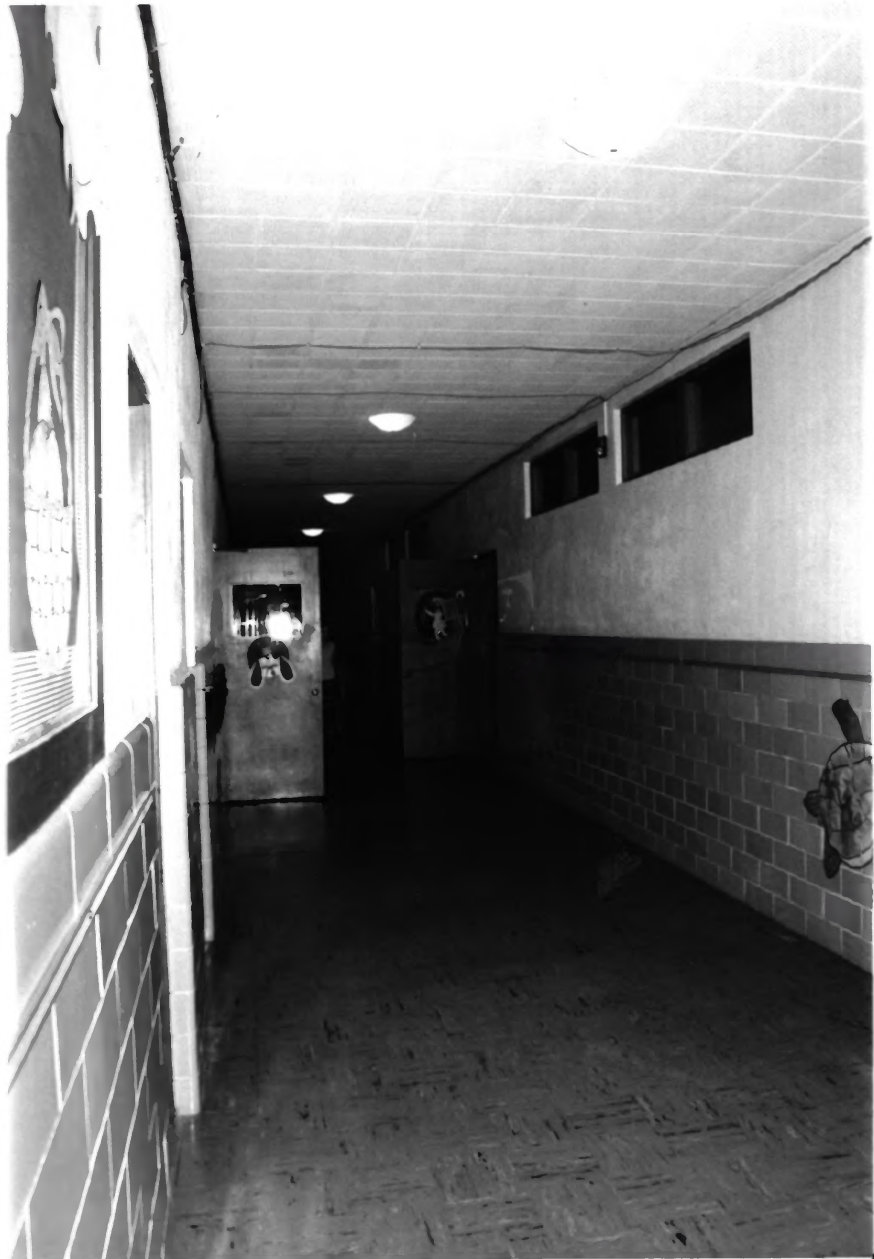
PROTECTION HIGH SCHOOL, COMANCHE COUNTY, KANSAS 25