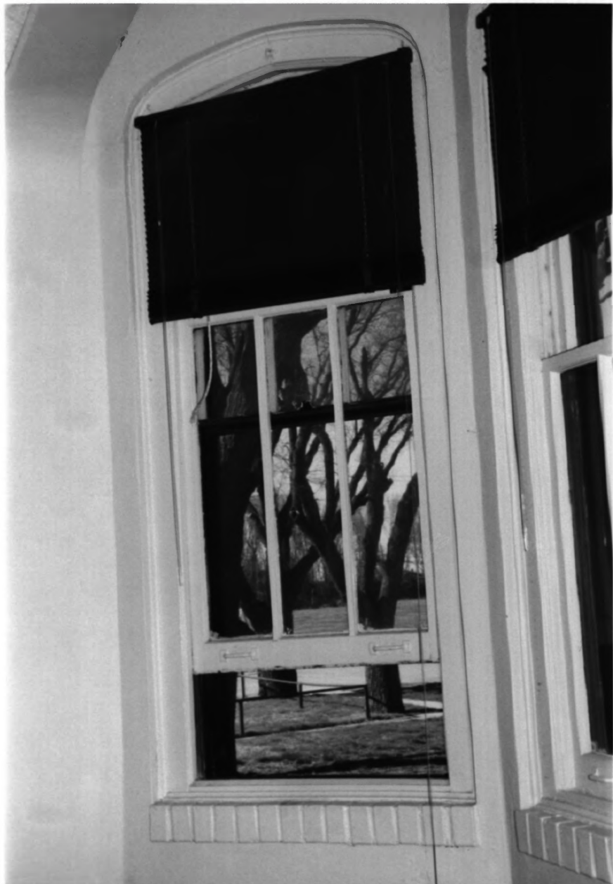
PROTECTION HIGH SCHOOL, COMANCHE COUNTY, KANSAS #18