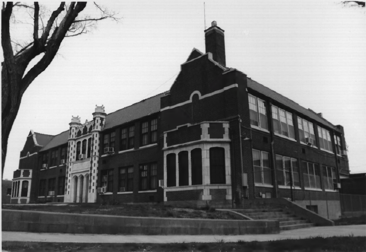
PROTECTION HIGH SCHOOL, COMANCHE COUNTY, KANSAS