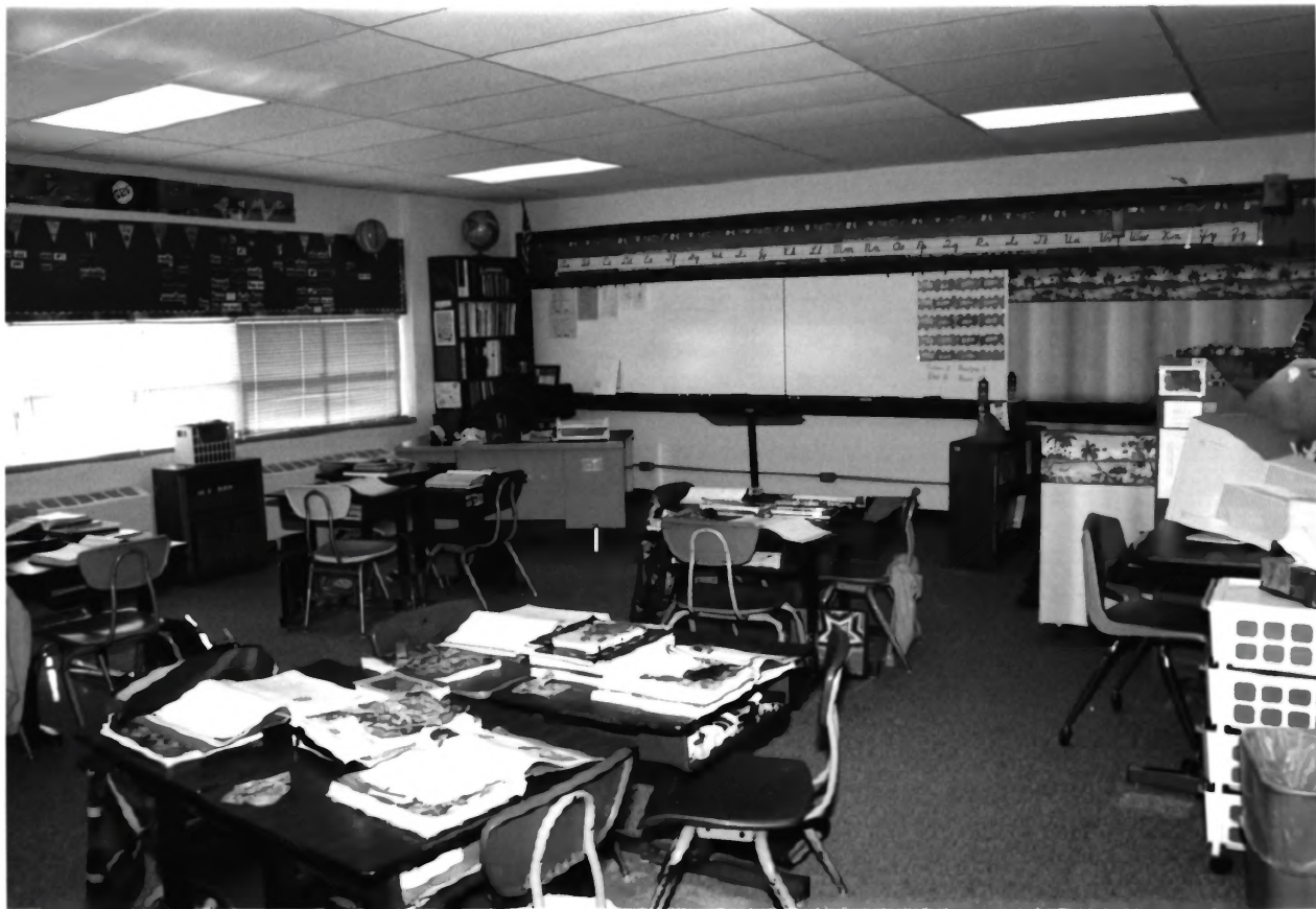
PROTECTION HIGH SCHOOL, COMANCHE COUNTY, KANSAS