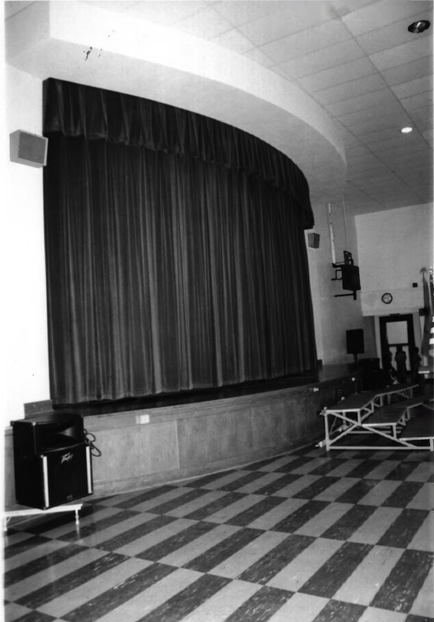
PROTECTION HIGH SCHOOL, COMANCHE COUNTY, KANSAS #20