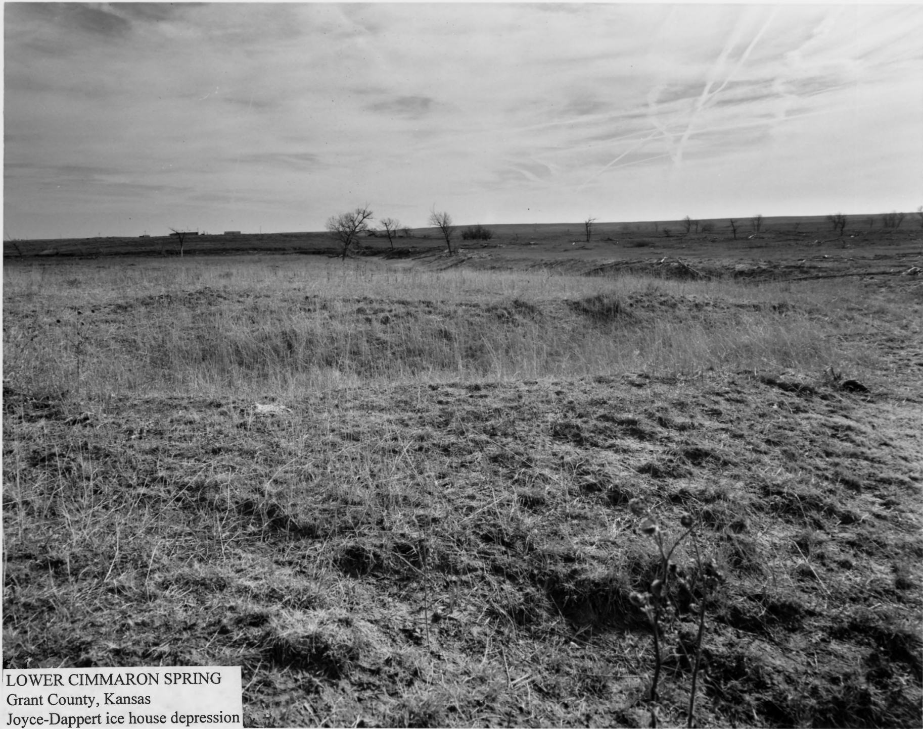
LOWER CIMMARON SPRING Grant County, Kansas Joyce-Dappert ice house depression Photo by Arnold Thallheimer, 9/93