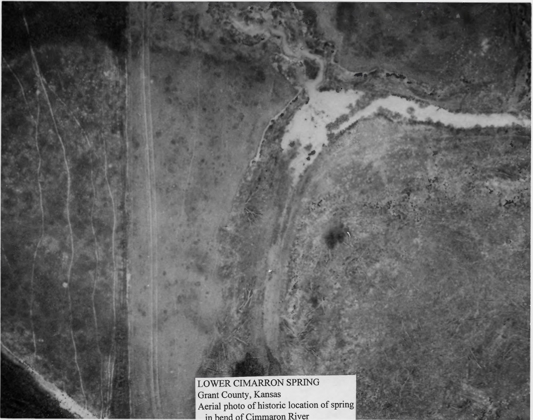
LOWER CIMARRON SPRING Grant County, Kansas Aerial photo of historic location of spring in bend of Cimarron River