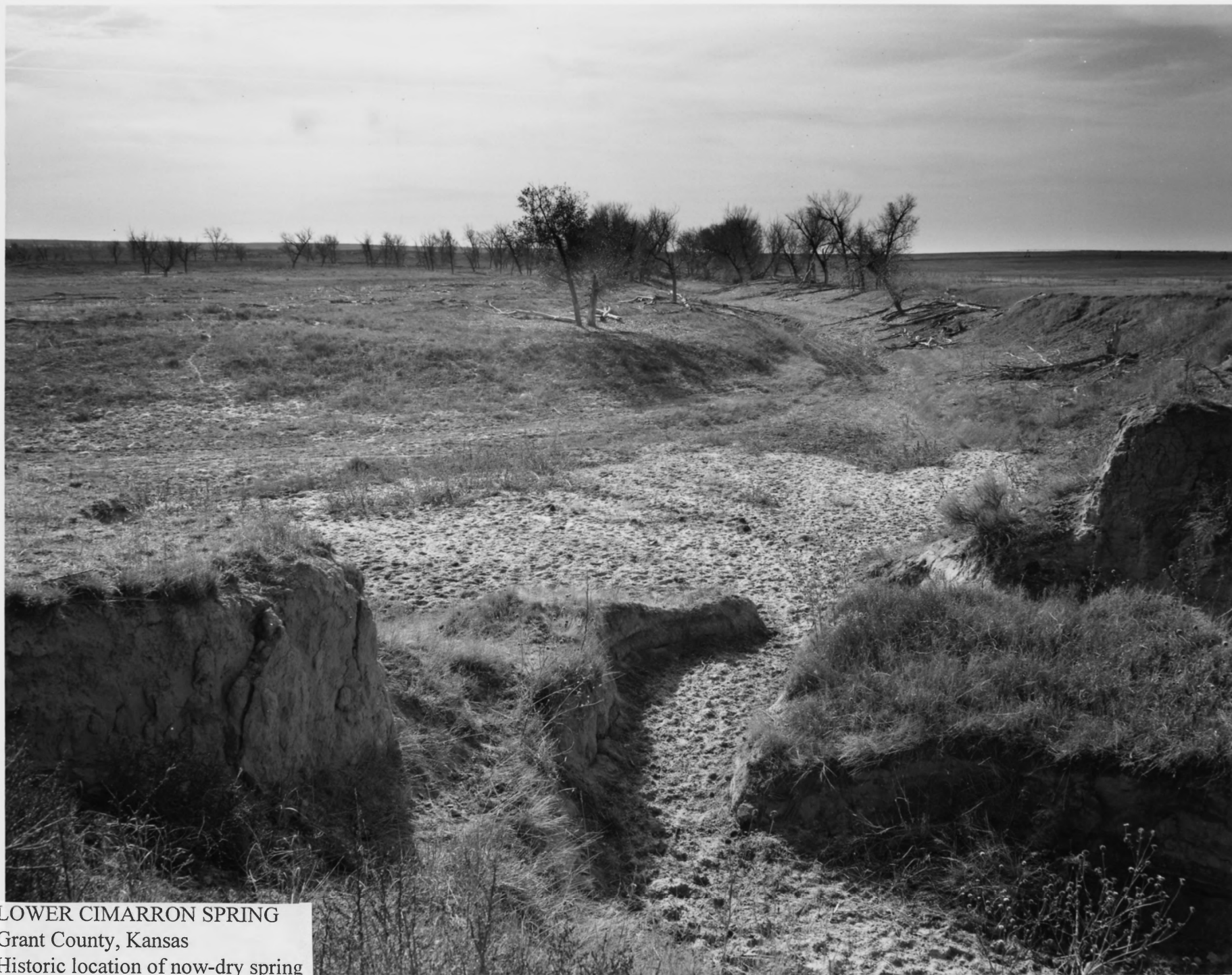
LOWER CIMARRON SPRING Grant County, Kansas Historic location of now-dry spring Photo by Arnold Thallheimer, 9/93