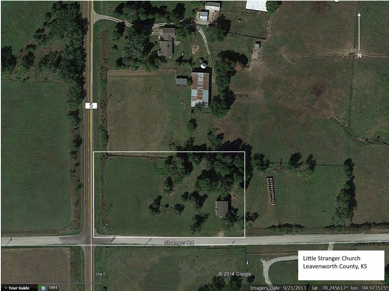
Figure 2: Close-In Aerial Image, Google Earth, 2014.

Leavenworth County, Kansas County and State