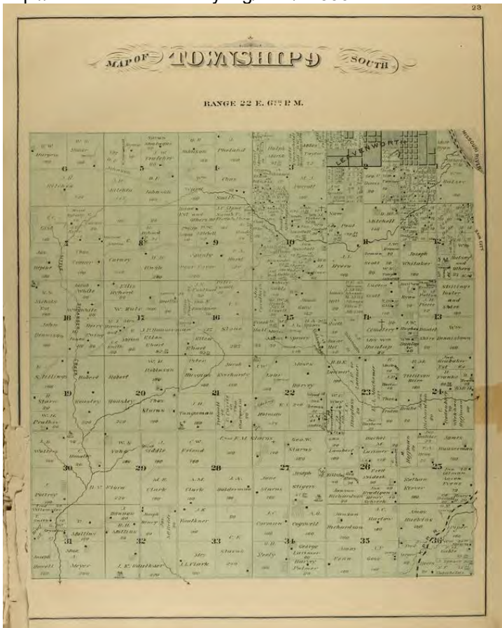
Figure 3: Atlas Map of Leavenworth County, Missouri Publishing Co., 1878. Source: http://www.kansasmemory.org/item/223967