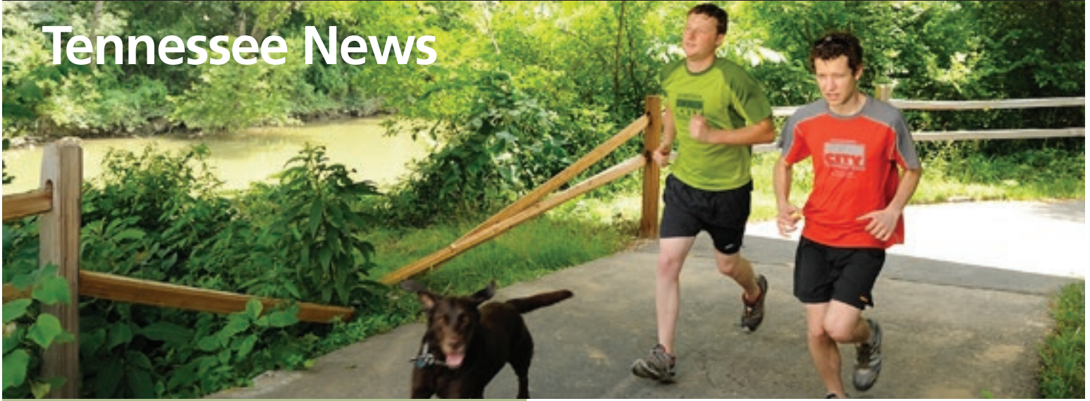
Runners on a section of the Chattanooga Riverwalk.