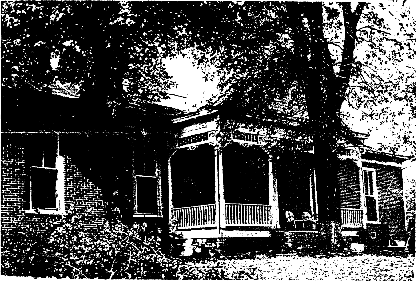
Munfordville School--Older photograph pre-1920s when the Victorian trim around the porch was removed.