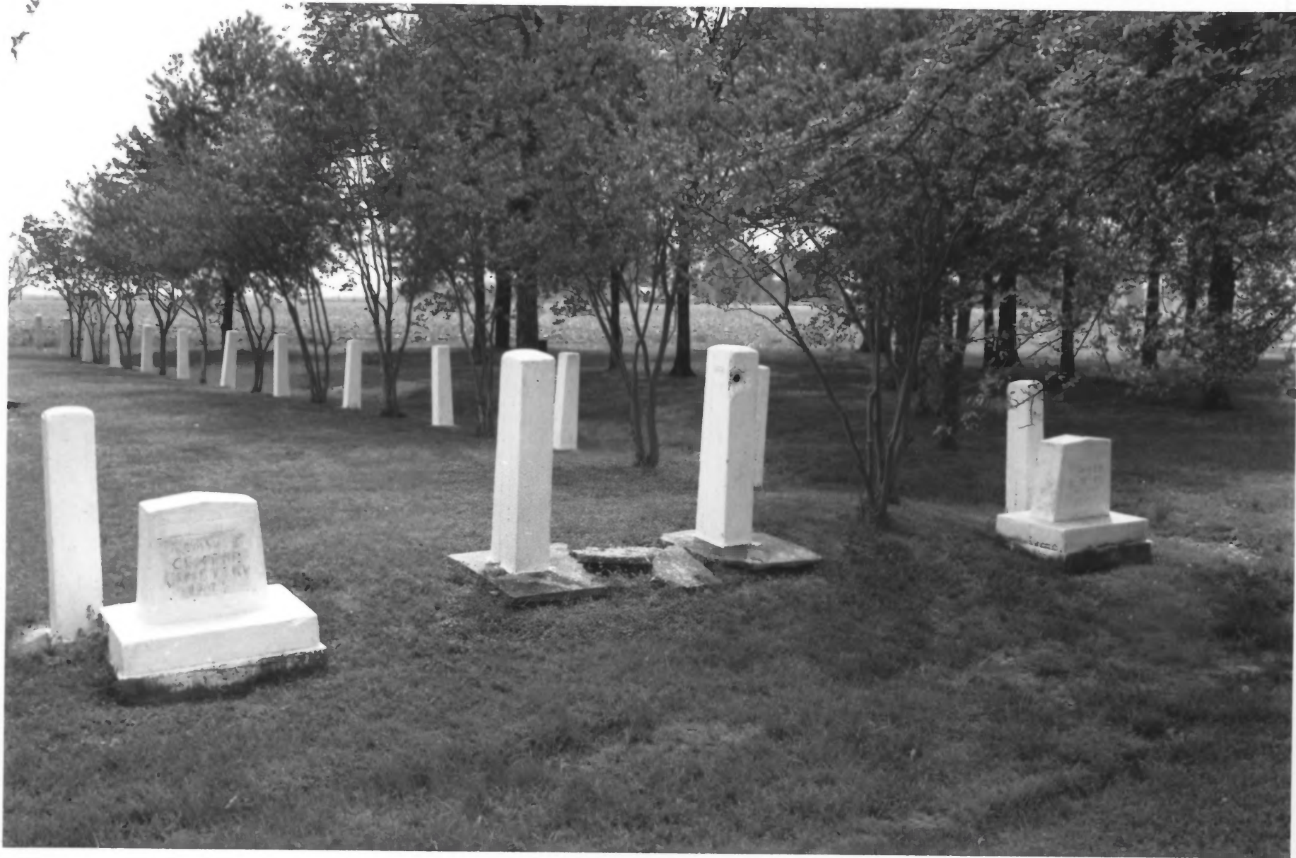
ROHWER RELOCATION CENTER MEMORIAL CEMETERY