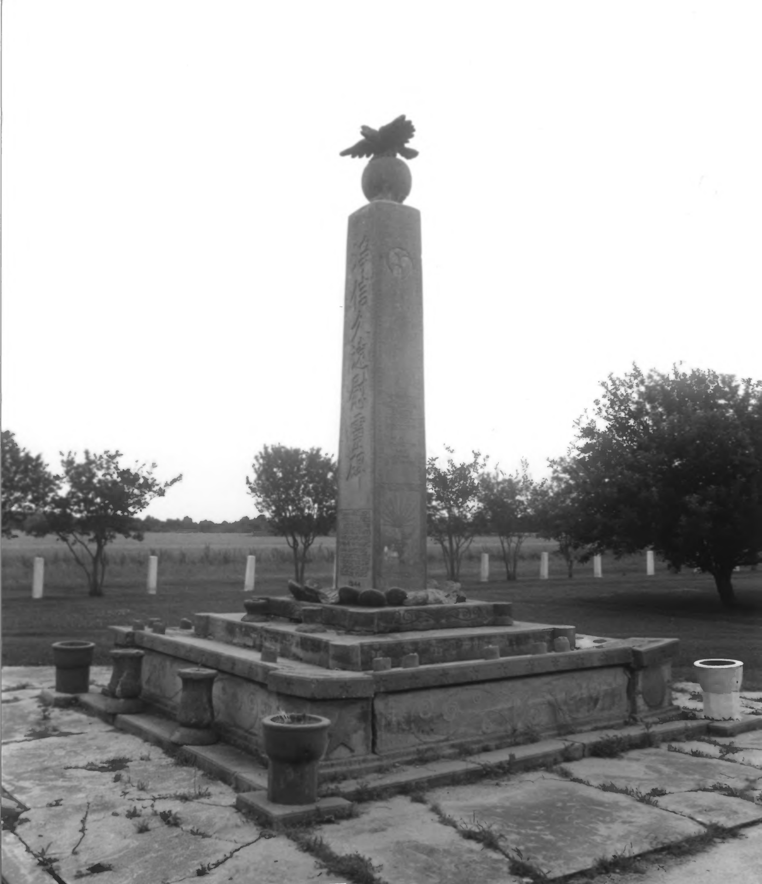
ROHWER RELOCATION CENTER MEMORIAL CEMETERY Rohwer, Arkansas Evacuee's Memorial Photo by K. Story, May 1990