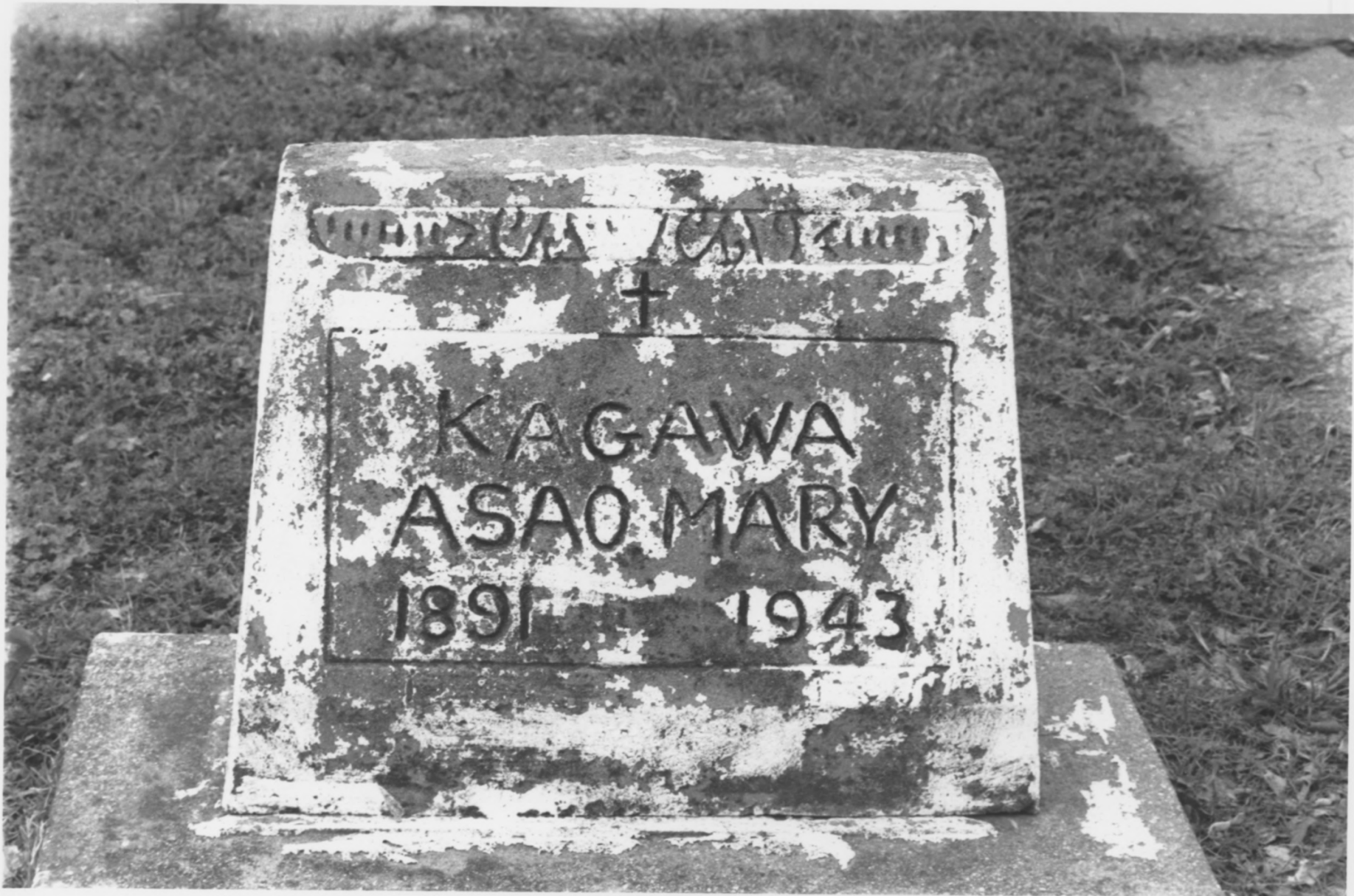
ROHWER RELOCATION CENTER MEMORIAL CEMETERY Rohwer, Arkansas Christian Gravestone Photo by A. Albright, April 1990