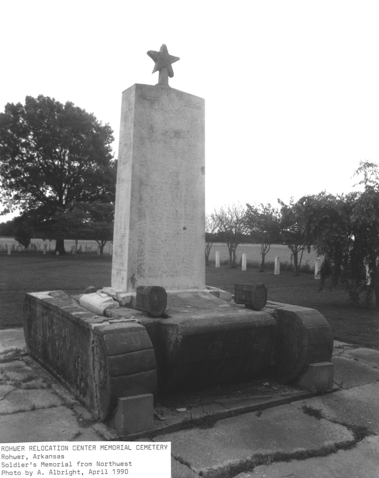
ROHWER RELOCATION CENTER MEMORIAL CEMETERY Rohwer, Arkansas Soldier's Memorial from Northwest Photo by A. Albright, April 1990