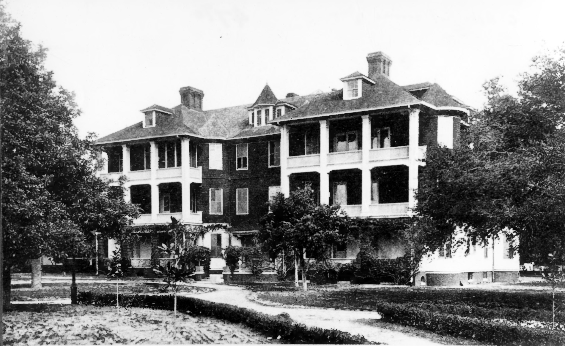
THE SAN SOUCI. JEKYL ISLAND, GA.