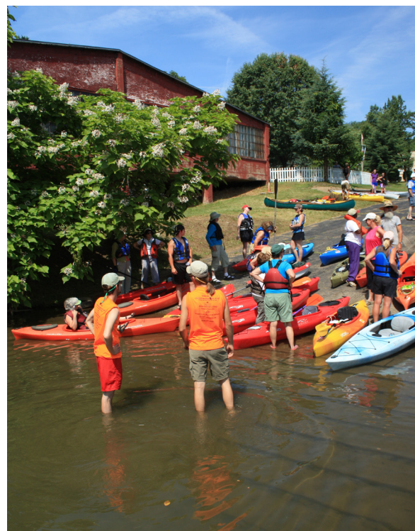
Student Conservation Association (SCA) staff help paddlers enter the Monongahela River at Rices Landing in summer 2012.