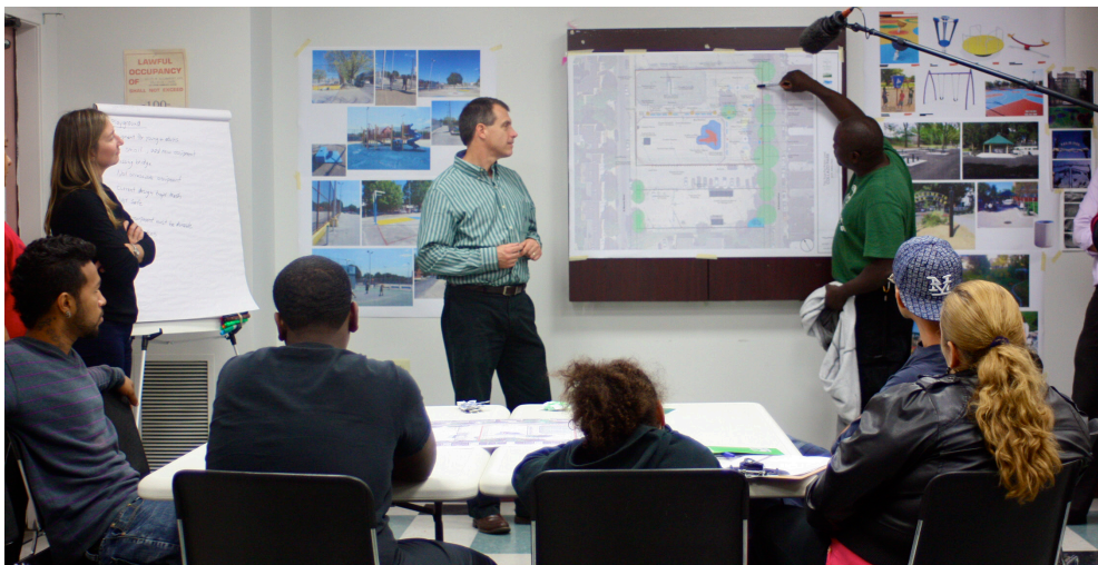
Wells Appell Architects and Trust for Public Land review the re-design of Collazo Park with the local community.