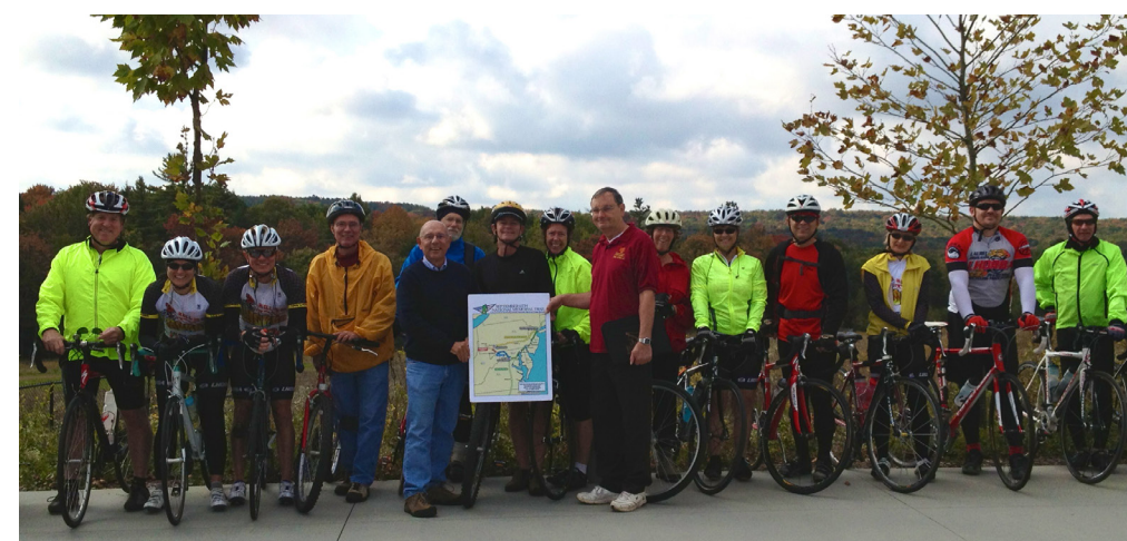
The first 9/11 Trail group bike ride, starting out at Flight 93 National Memorial, fall 2012.

Project Partner: September 11th National Memorial Trail Alliance NPS Contact: Peggy Pings Location: Seven state triangle including Shanksville, PA (Flight 93 National Memorial), New York City (World Trade Center), Washington DC (Pentagon) Congressional Districts: PA - 1, 2, 4, 5, 6, 7, 8, 9, 10, 11, 12, 13, 14, 15, 16, 17, 18