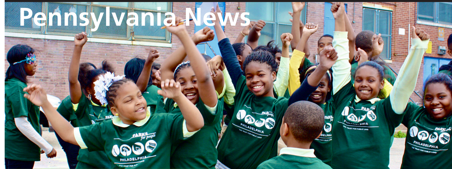
William Dick School students celebrate the launch of schoolyard greening in Philadelphia.