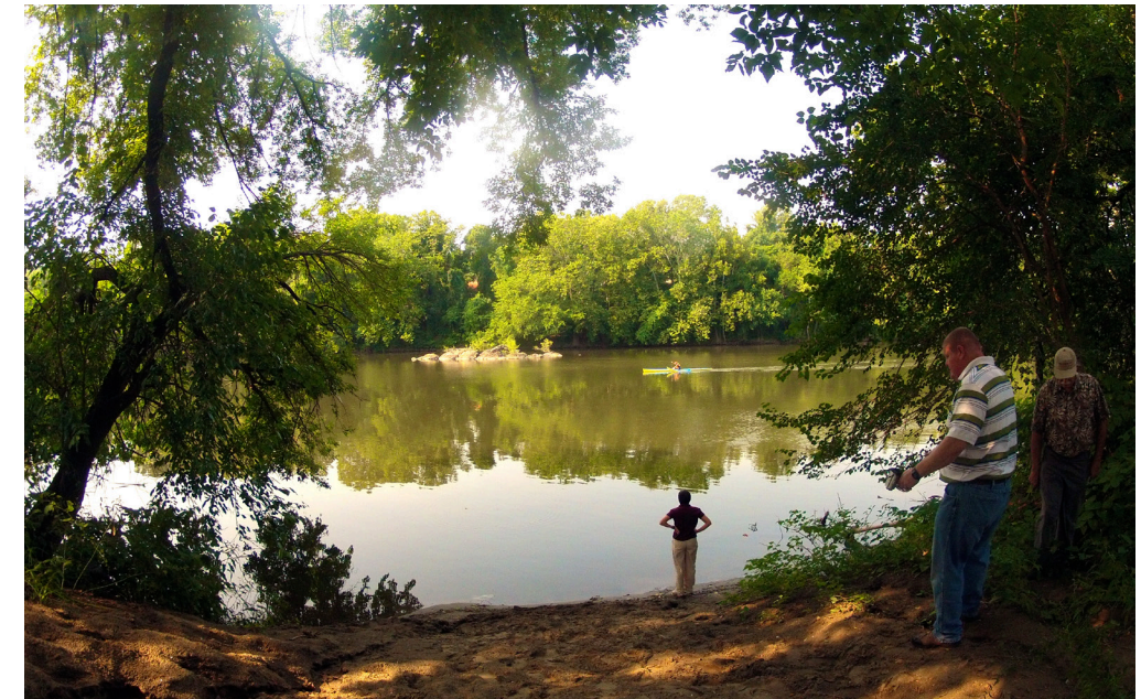
Members of the Schuylkill River Heritage Area, the PA Fish, and Boat Commission, RTCA, and the Dragon Boat Association participate in a boat access site reconnaissance.

Facilitate public participation; guide improving landing and launch facilities; assist with strategic plan.