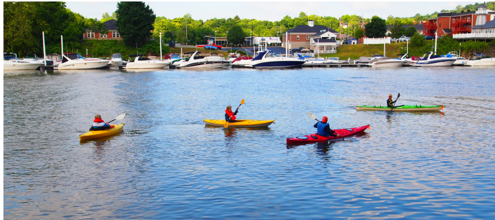
Beaver County Rowing Association holds a "Learn To Row" event on Beaver River in June 2012.

Assist with water trail planning, inventory of access sites, mapping and brochure development; assist with partnership building, public involvement, education, outreach, and fundraising.