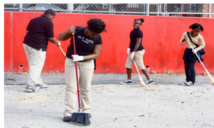
Students at William Dick School participate in a schoolyard clean-up day.

Assist with participatory design process and stewardship planning with students and community residents in schools and recreation centers.