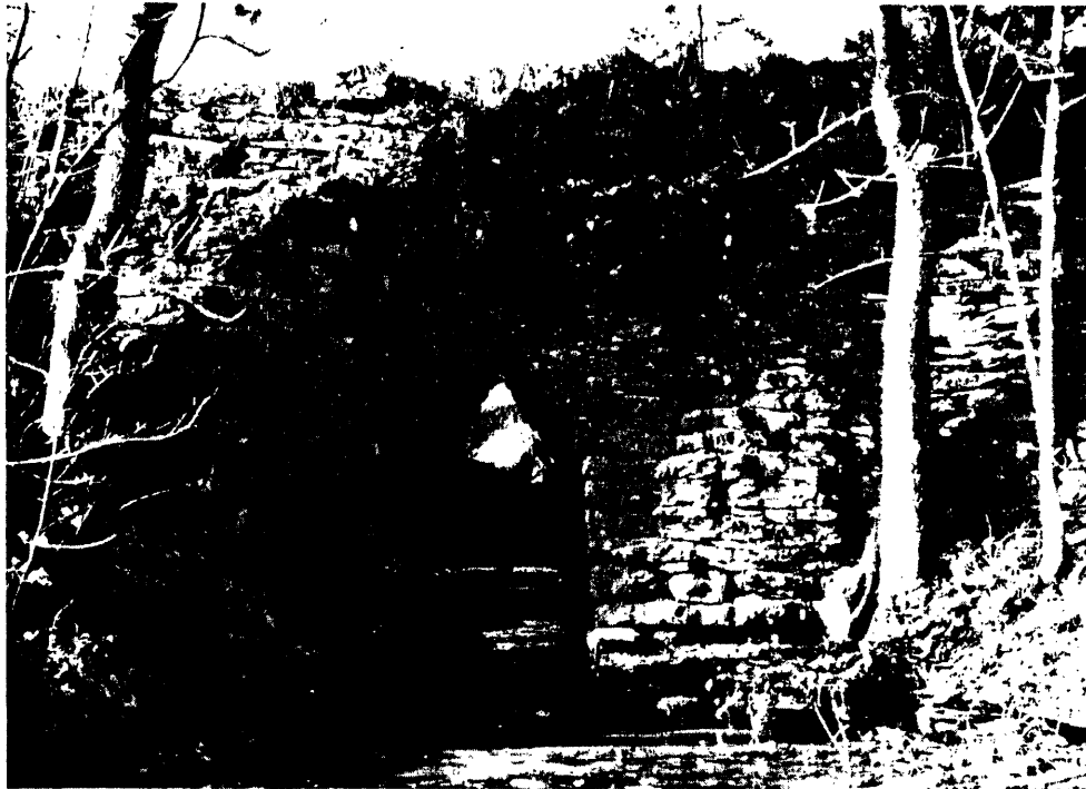
Fig. 4.2 TURNPIKE BRIDGE. An uncommon pointed arch bridge spans a small run of Dix River in Boyle County. Most pike bridges have round arches.

Figure 1. Photo and description of the Clifton Road culvert from Murray-Wooley and Raitz' Rock Fences of the Bluegrass (ibid).