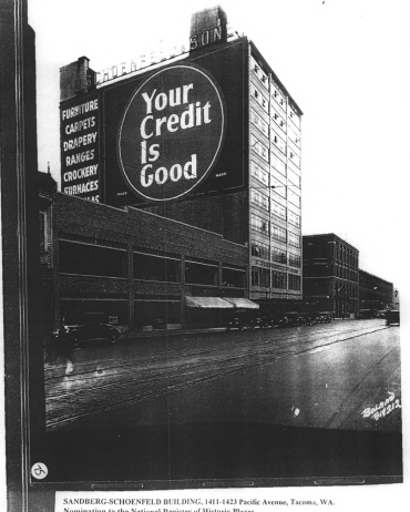
Nomination to the National Register of Historic Places Historic Photograph, TPL NW Room. Northwest Angle, ea. 1930