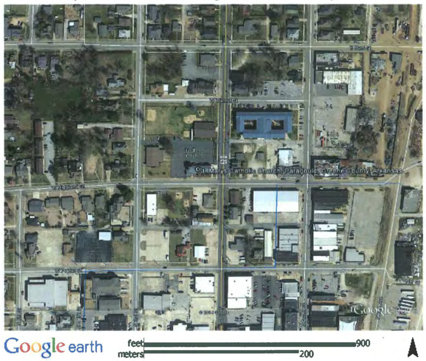
St. Marys Catholic Church, Paragould, Greene County, Arkansas