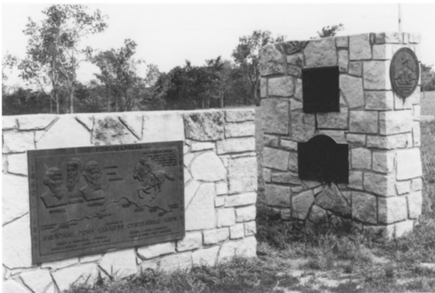
Commemorative plaques to SW of building. Landmark plaque is square plaque on right