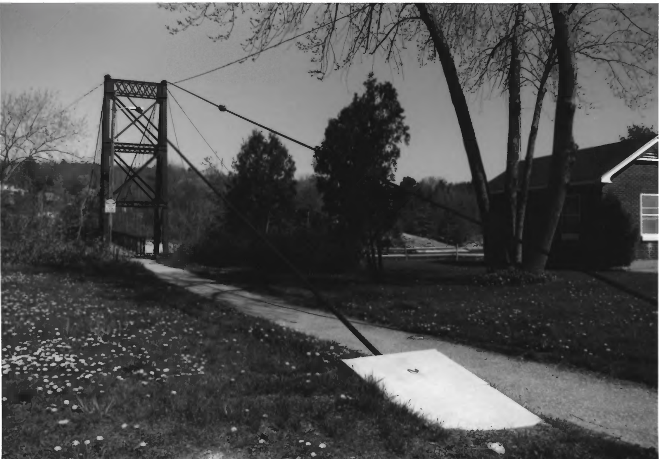
ANDRO SCOGGIN SWINGING BRIDGE; LUMBERLAND AND SAGadahoc CO's, ME 10F4