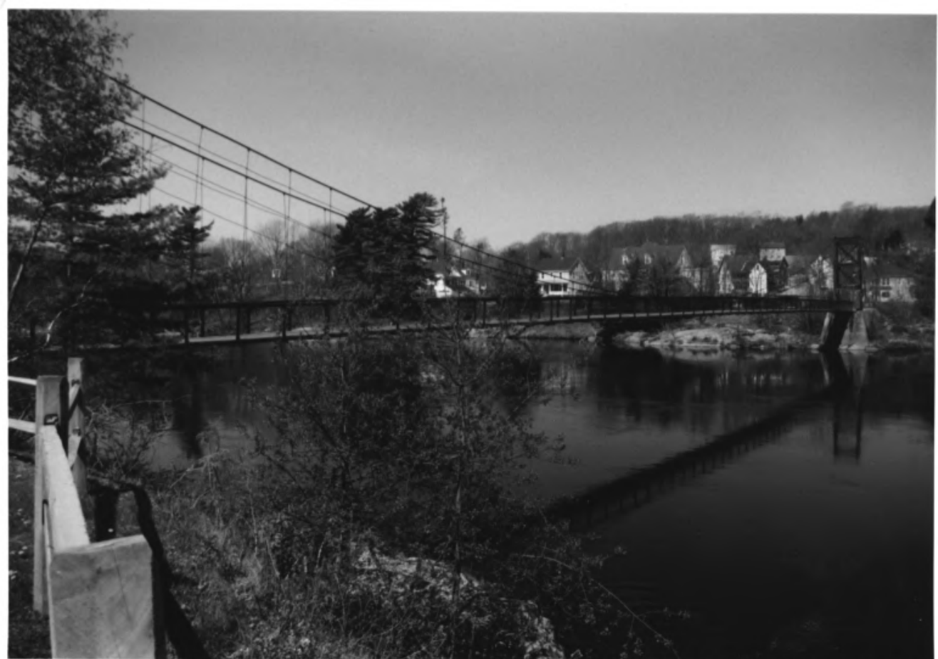
ANDROSCOGGIN SWINGING BRIDGE; CUMBERLAND AND SAGadahoc COUNTIES, MAINE