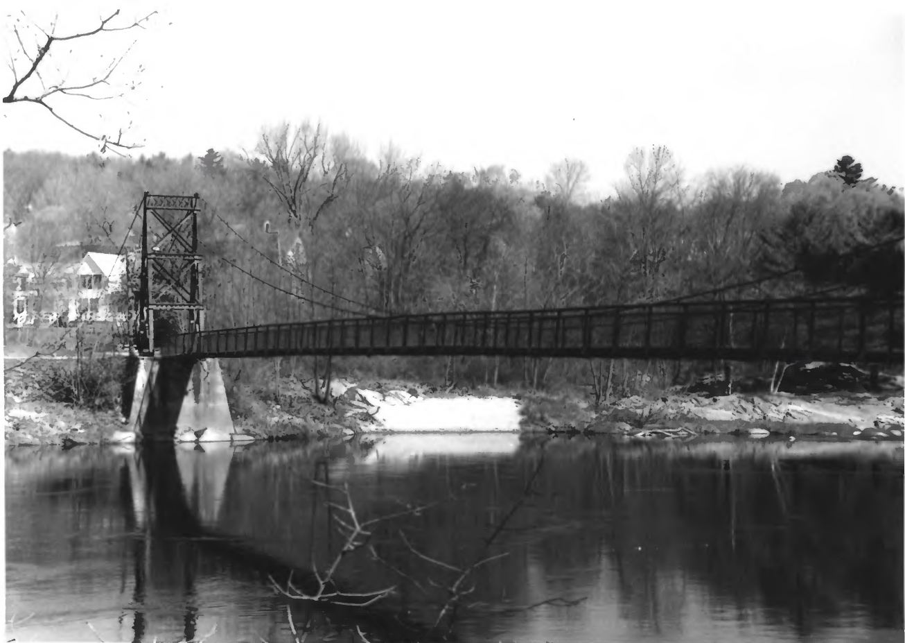
ANDROSCOGGIN SWINGING BRIDGE; CUMBERLAND + SACATAHOC COUNTIES, MAINE