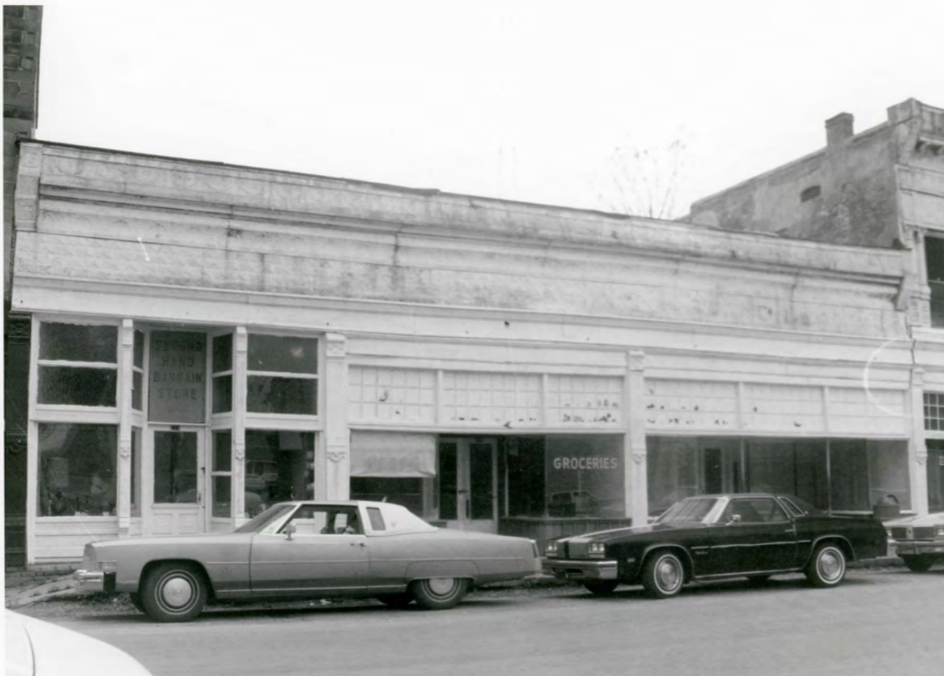
CL-45 Ewan Building 124-128 Second HISTORIC RESOURCES OF CLARENDON Jeff Lewellen, photographer Negatives at AHPP Viewed from the Northwest