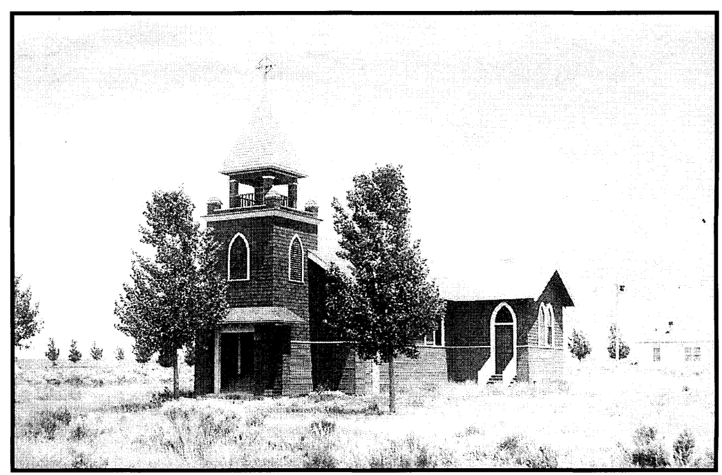
Pre-1925 photograph of St. John's Episcopal Church in original location viewed to the northeast.