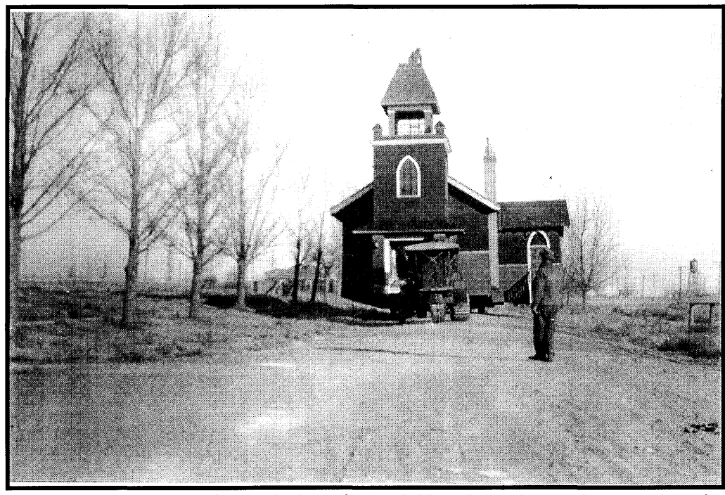
Late 1925 photograph of St. John's Episcopal Church on the road to new location.