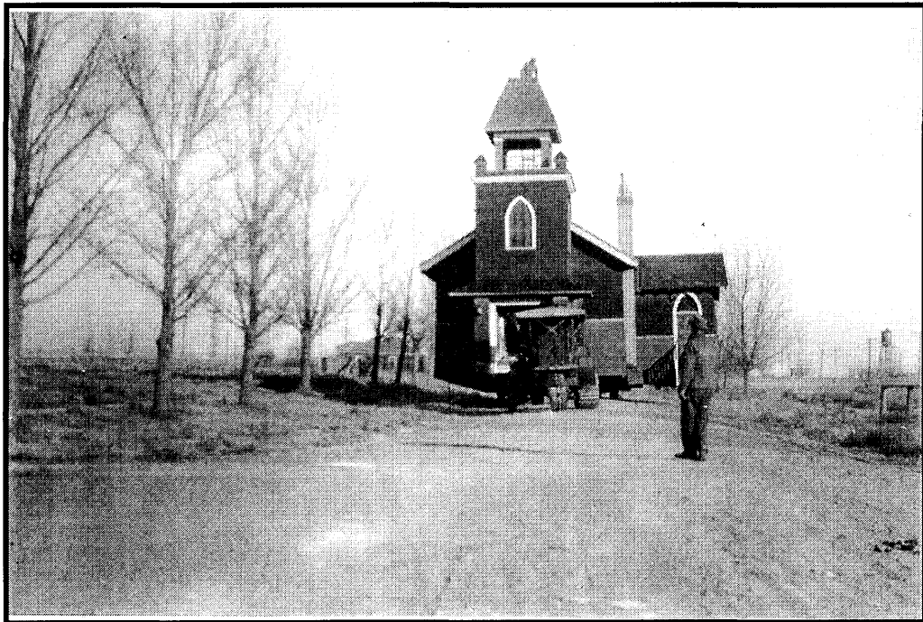
Late 1925 photograph of St. John's Episcopal Church on the road to new location.