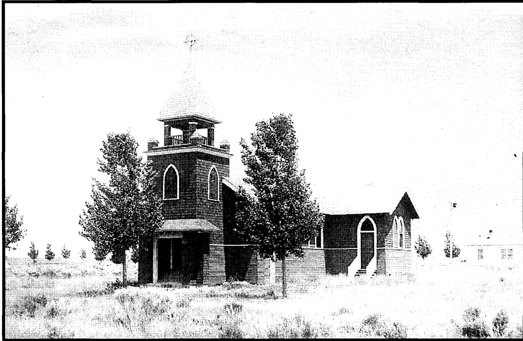
Pre-1925 photograph of St. John's Episcopal Church in original location viewed to the northeast.