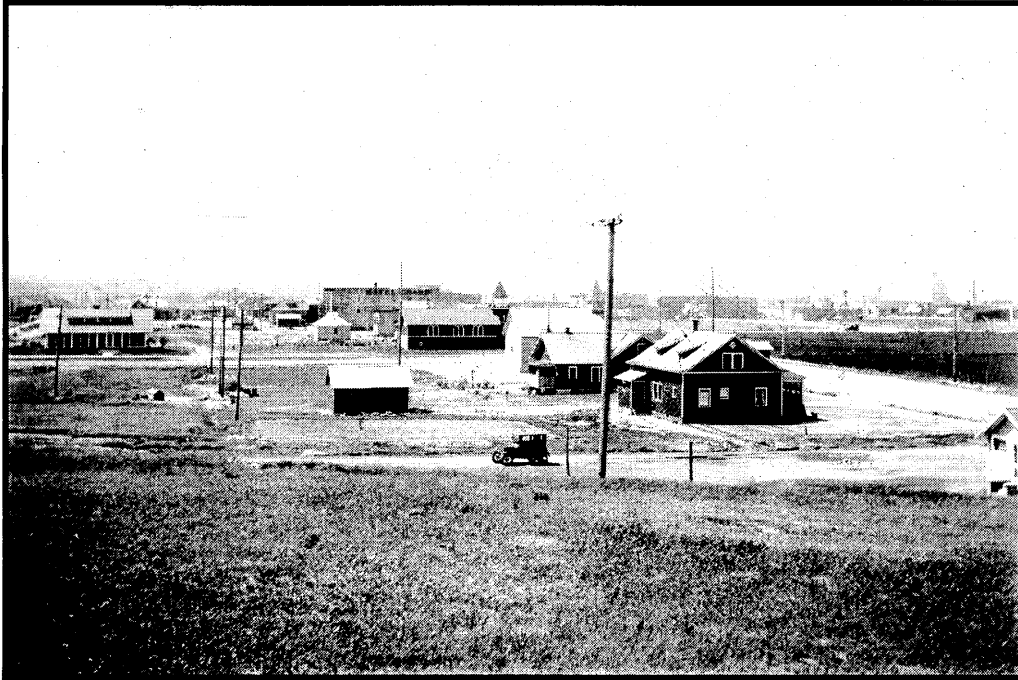
Late 1925 photograph of St. John's Episcopal Church in new location.