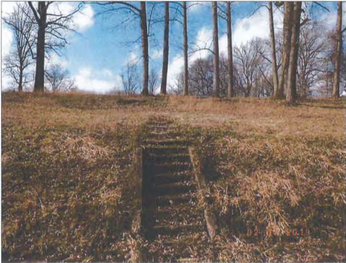
Figure 1: Historic location of the Patton, John E., House. Photo taken February 1, 2019 by a consultant with the Environmental Corporation of America. Photographer is facing west towards where the house once stood.