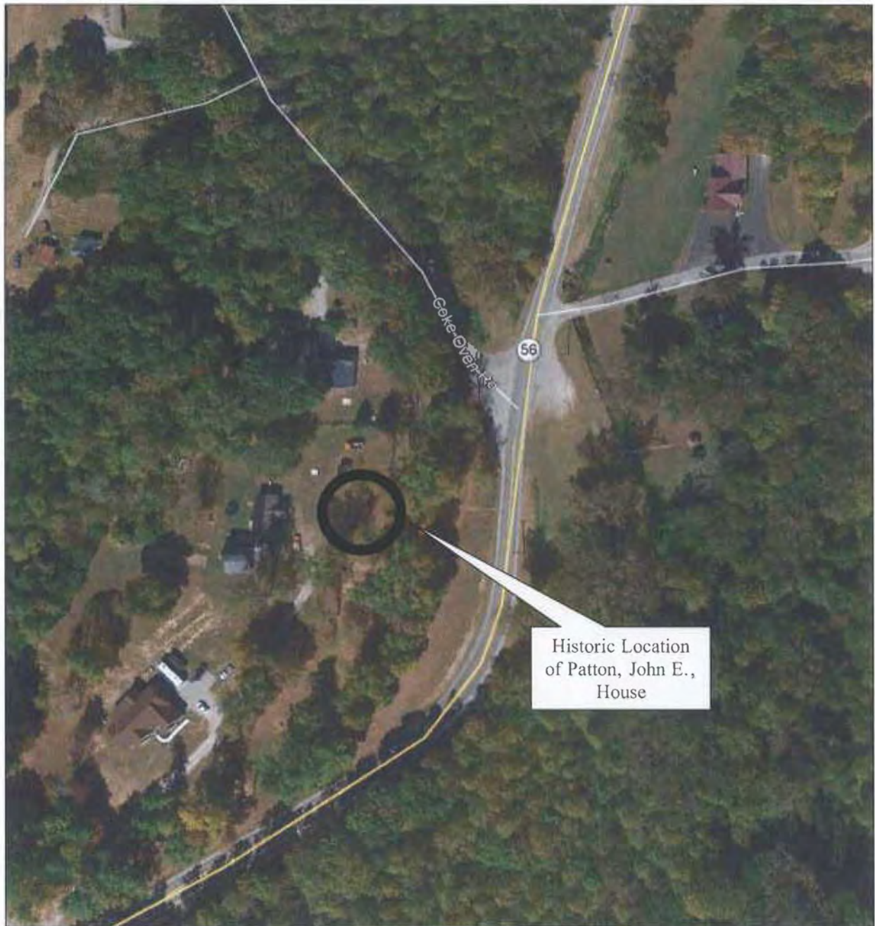
Figure 2: Imagery from Google Earth, dated 10/11/2016. The imagery also shows that the Patton House is no longer extant and that there is new construction on the lot.