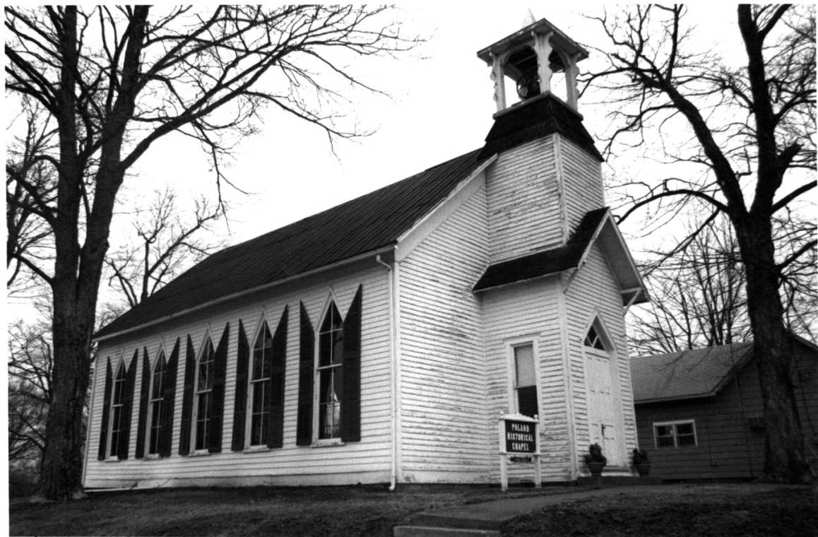
POLAND PRESBYTERIAN CHURCH CLAY COUNTY, IN.