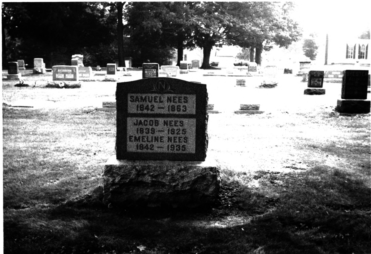
POLAND PRESBYTERIAN CHURCH CLAY COUNTY, IN.