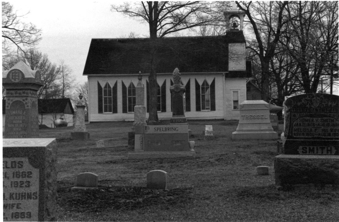
POLAND PRESBYTERIAN CHURCH CLAY COUNTY. IN.