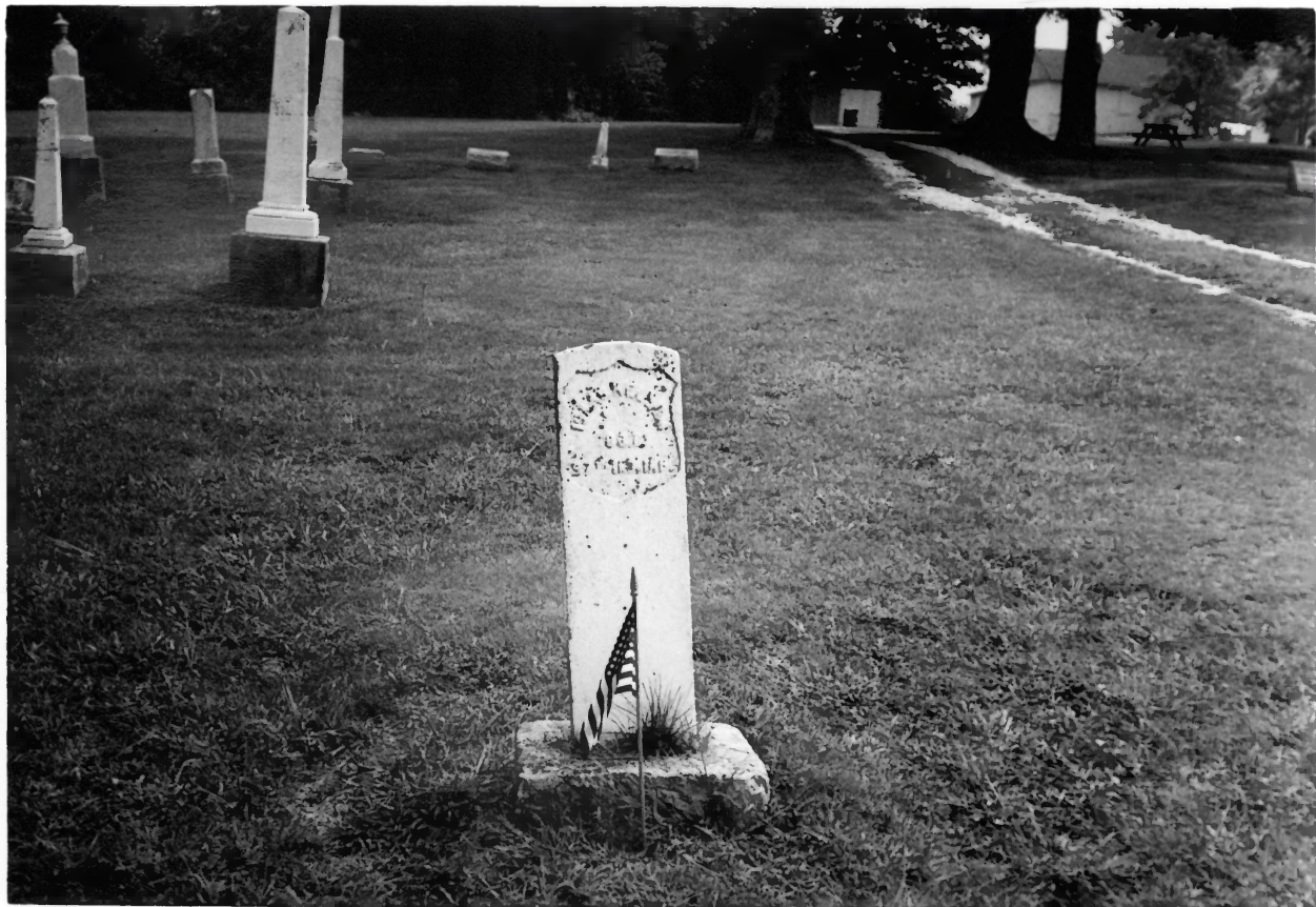
POLAND PRESBYTERIAN CHURCH CLAY COUNTY. IN.