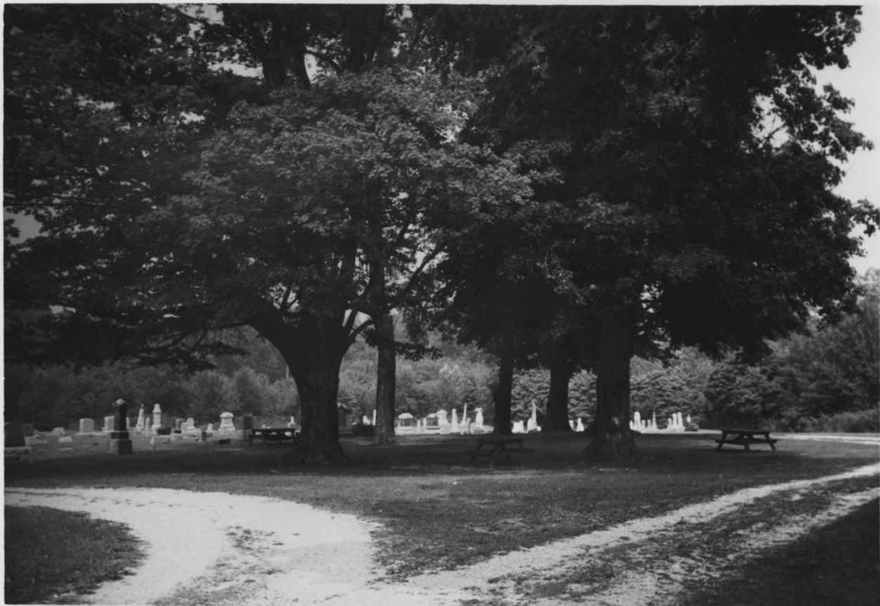
POLAND PRESBYTERIAN CHURCH CLAY COUNTY. IN.