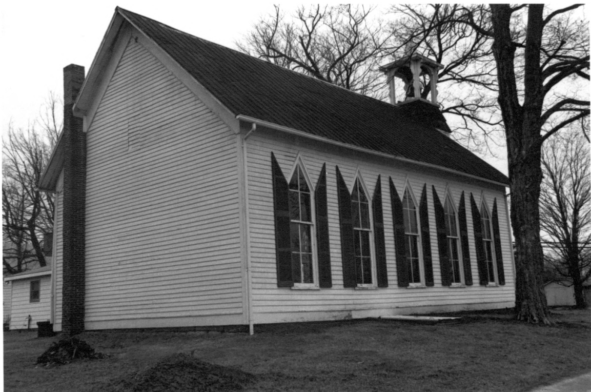
POLAND PRESBYTERIAN CHURCH CLAY COUNTY, IN.