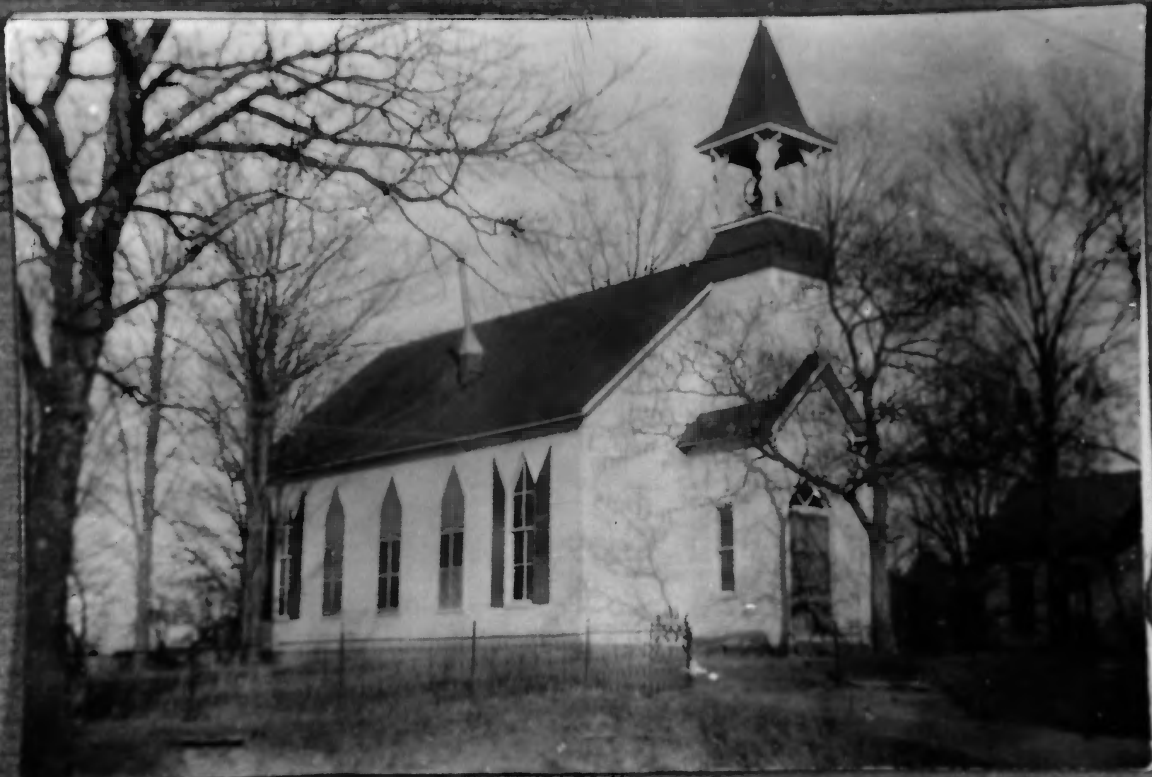
POLAND PRESBYTERIAN CHURCH CLAY COUNTY, IN