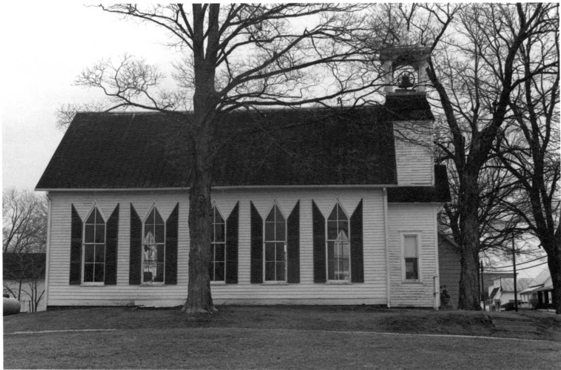
POLAND PRESBYTERIAN CHURCH CLAY COUNTY. IN.