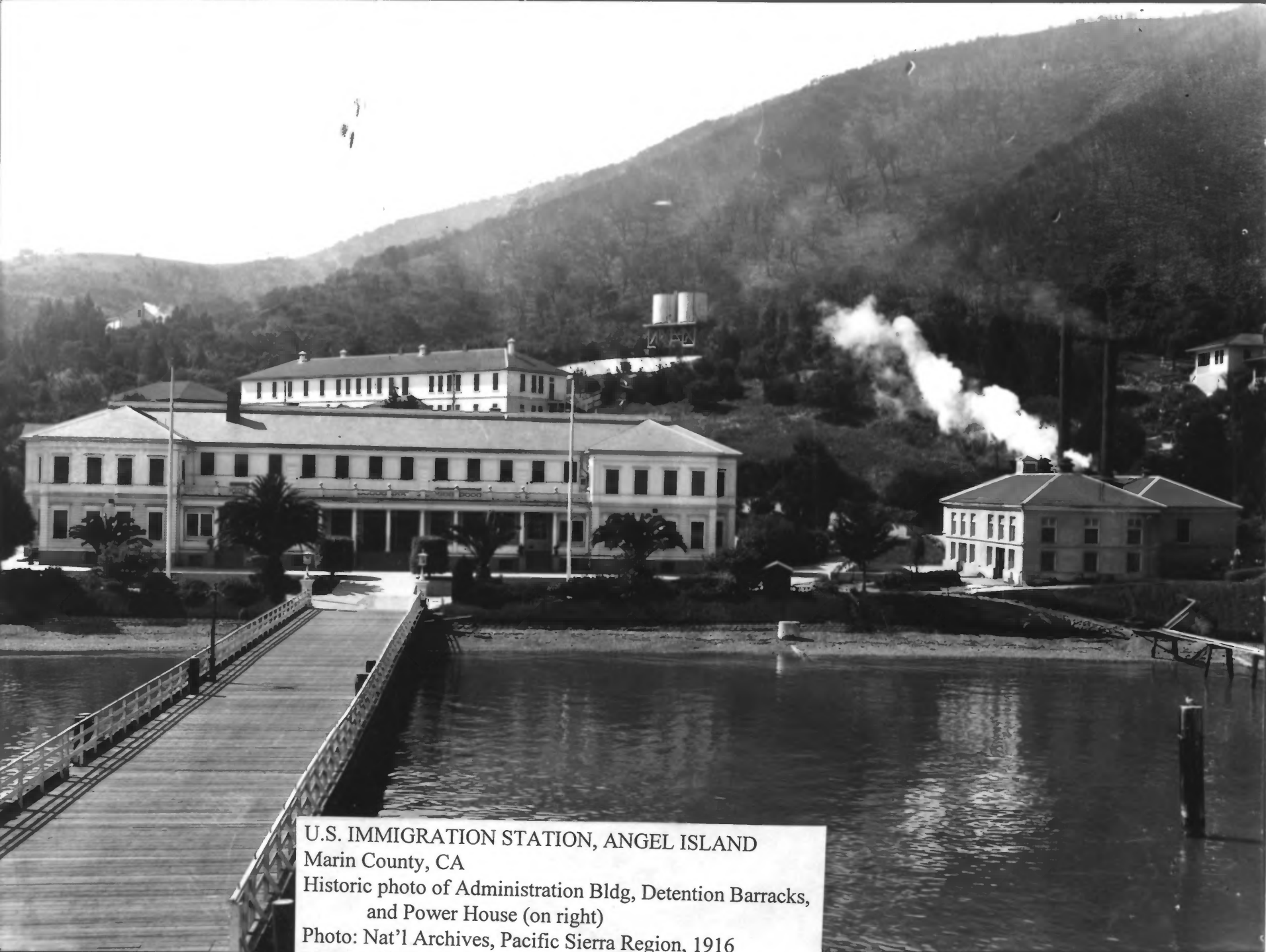
U.S. IMMIGRATION STATION, ANGEL ISLAND Marin County, CA Historic photo of Administration Bldg, Detention Barracks, and Power House (on right) Photo 1 (Map photo 11)