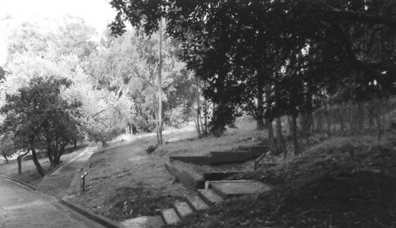
U.S. IMMIGRATION STATION, ANGEL ISLAND Marin County, CA Remains/foundations of Station Employees Residences Photo: Jim Burke, 1996 Photo 6 (Map photo 2 )