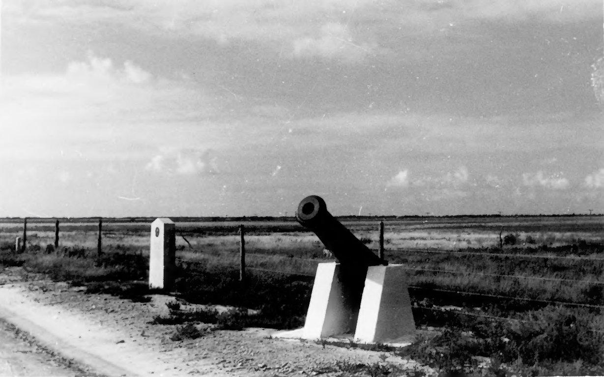
PALO ALTO BATTLEFIELD, Texas. Chaparral has been cleared from these fields and fences erected where Taylor clashed with Mexican forces in the first major battle of the War with Mexico.