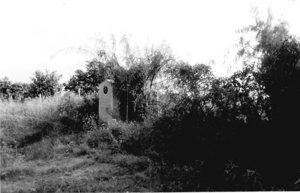
RESACA DE LA PALMA BATTLEFIELD, Texas. Citrus orchards partially cover the field where Taylor drove the Mexican Army from a resaca and across the Rio Grande.