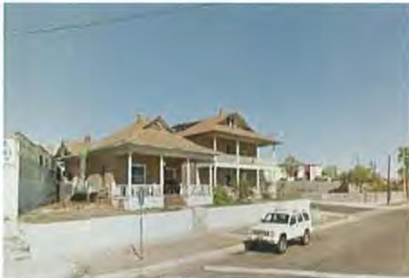
The Fredley House (left) and Fredley Apartments (right) prior to the fire, Sept. 5, 2017.

The Arizona State Historic Preservation Office requests the Keeper of the National Register of Historic Places to remove the Fredley Apartments at 406 S. 2nd Ave. from the National Register. The property no longer possesses integrity to convey its former significance.