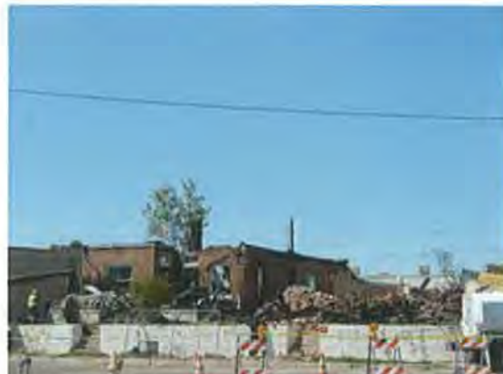
The Fredley House (left) and Fredley Apartments (right) immediately after the fire, Sept. 5, 2017.