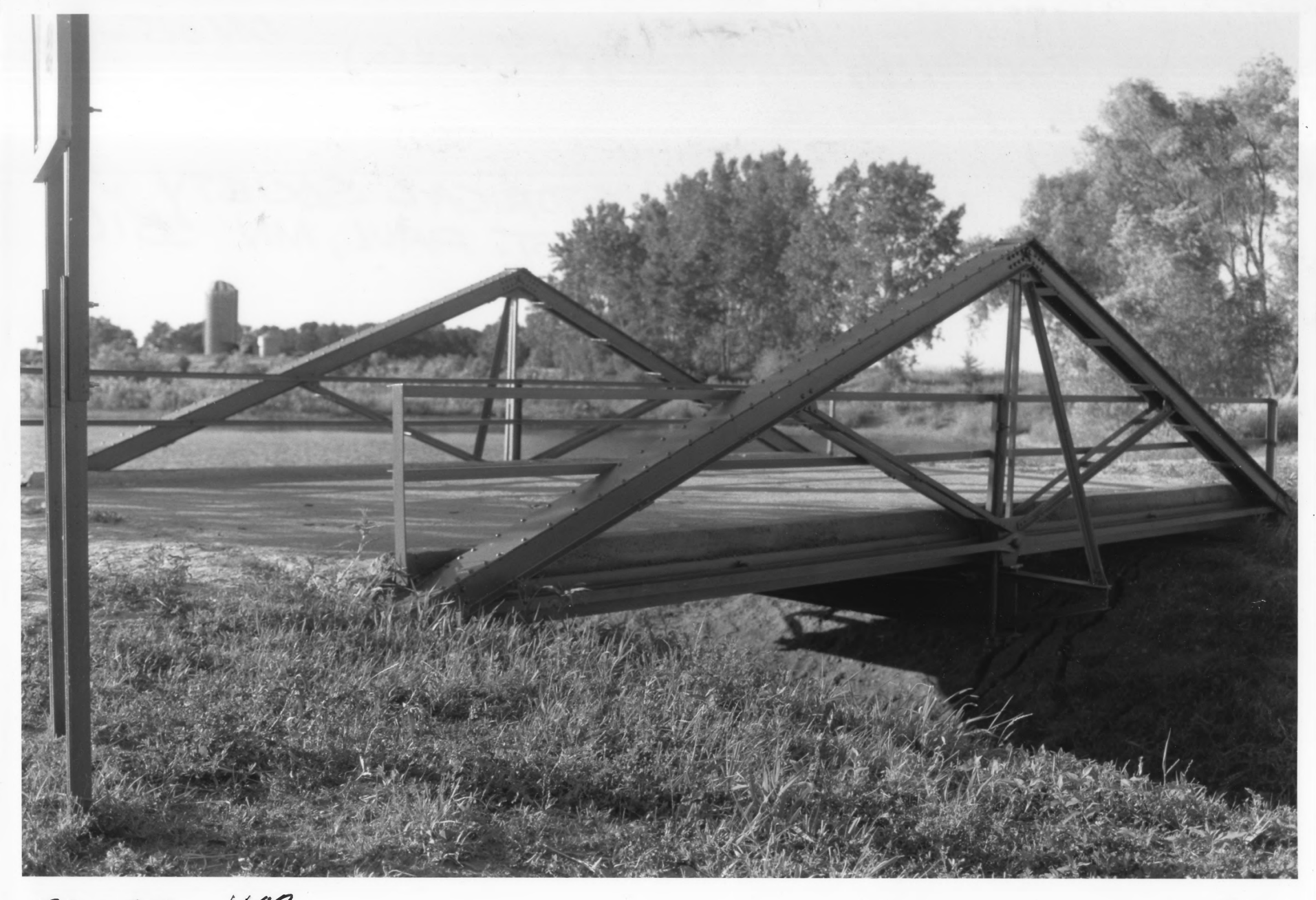
BRIDGE 1482 LUVERVE TOWNSHIP, ROCK COUNTY, MINNESOTA # 0/1015-20