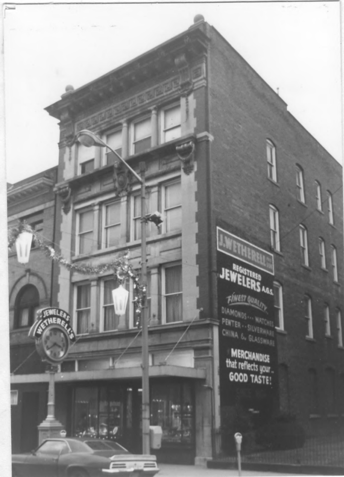
Oeldorf Building/ Wetherell's Jewelers 809 Market St. 80-73