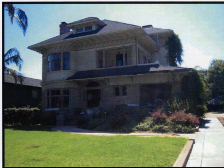
CA_Los Angeles County_Mary E Denham House_0002