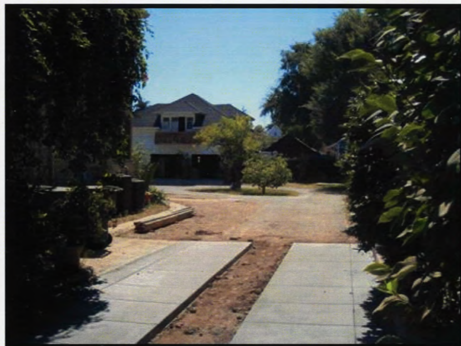
CA_Los Angeles County_Mary E Denham House_0006