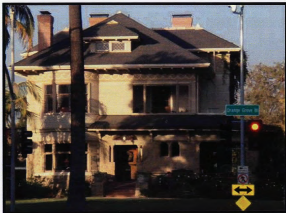
CA_Los Angeles County_Mary E Denham House_0001