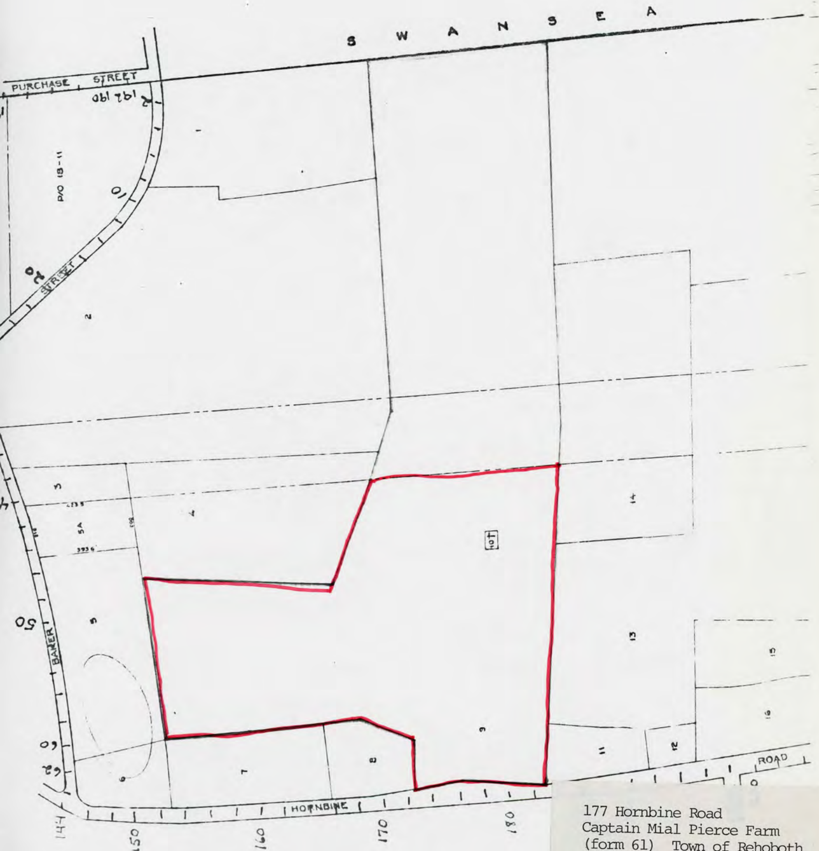
177 Hornbine Road Captain Mial Pierce Farm (form 61) Town of Rehoboth Property Map 1978 scale 1"=200'