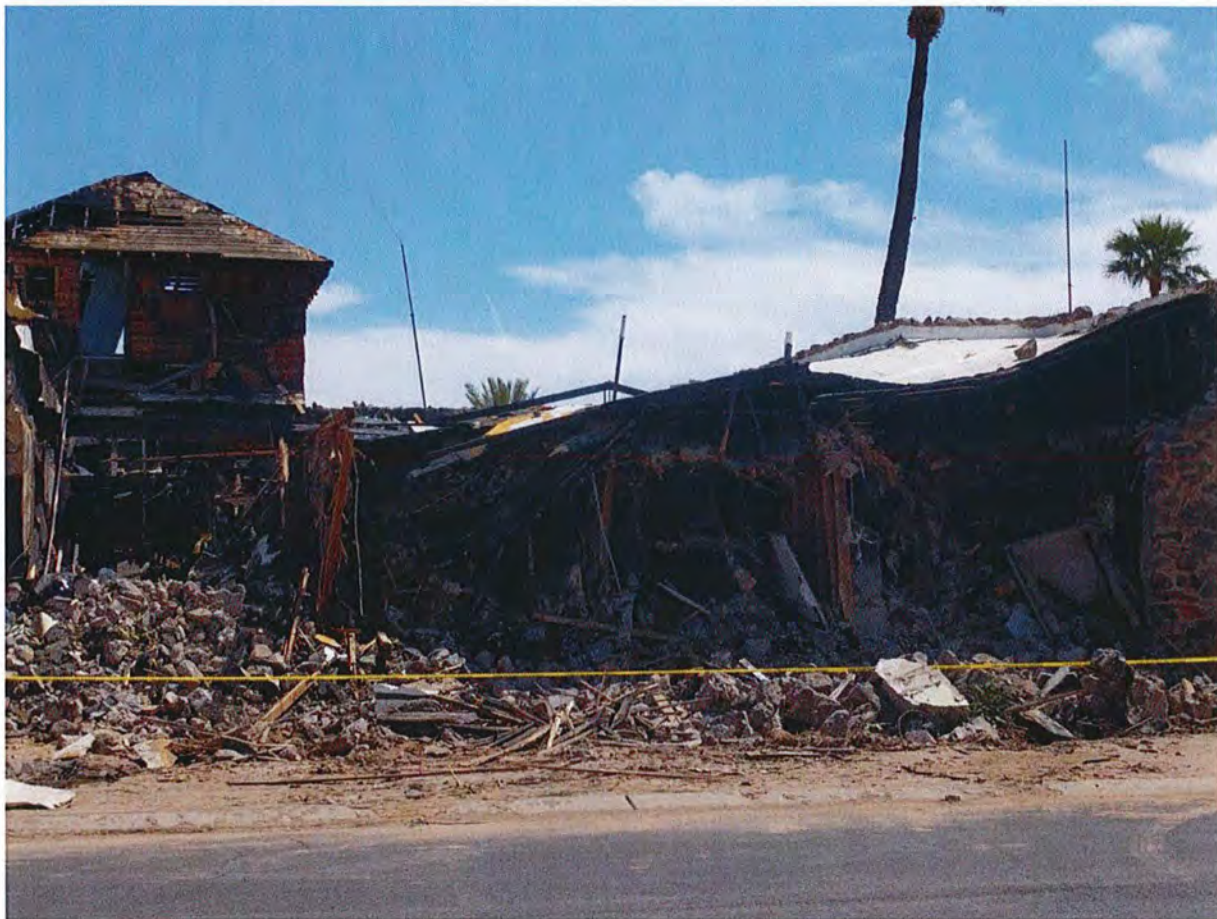
Remains of the Fisher Memorial Home following a destructive fire. Smathers, Heather, "Burned CG Historic Structure May Have to be Demolished," Casa Grande Dispatch , April 10, 2017. https://www.pinalcentral.com/casa_grande_dispatch/area_news/burned-cg-historic-structure-may-have-to-be-demolished/article_d685b426-e27c-5c05-8567-a5688e819bb6.html

On April 7, 2017, a fire effectively destroyed the Fisher Memorial Home and it has been demolished following an evaluation that the property could not be restored. The Arizona State Historic Preservation Office requests that the Keeper of the National Register of Historic Places remove this property from the National Register.