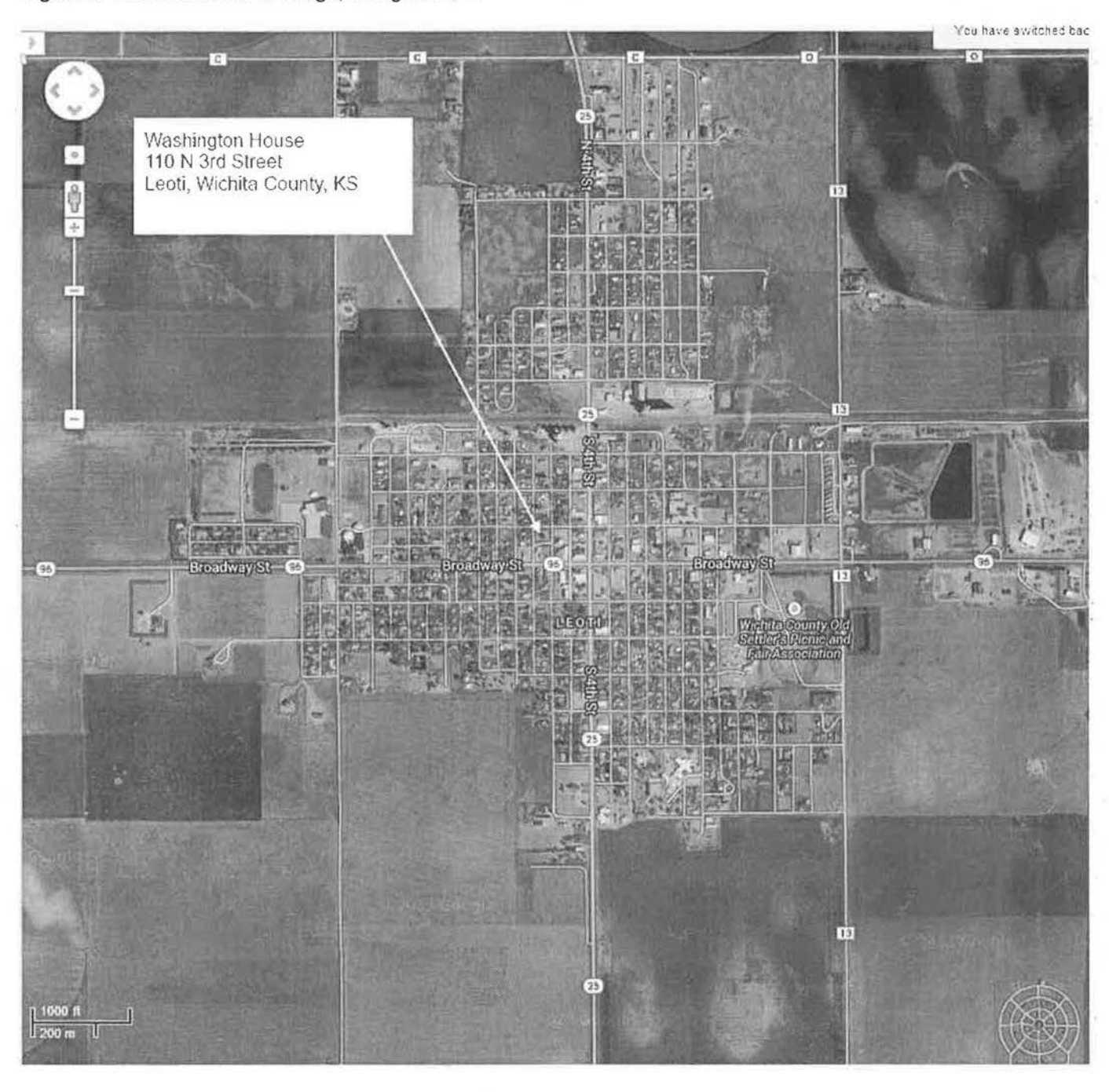
Figure 1: Contextual aerial image.