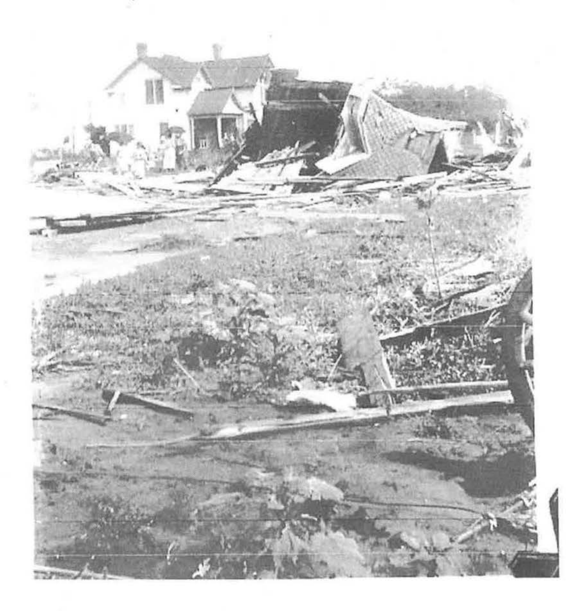
Figure 6: Washington House, 1923, shortly after tornado destroyed much of Leoti.