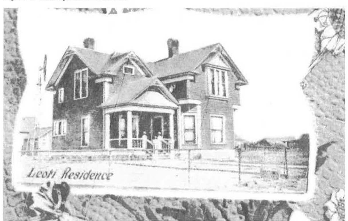
Figure 5: Washington House (left). No date.