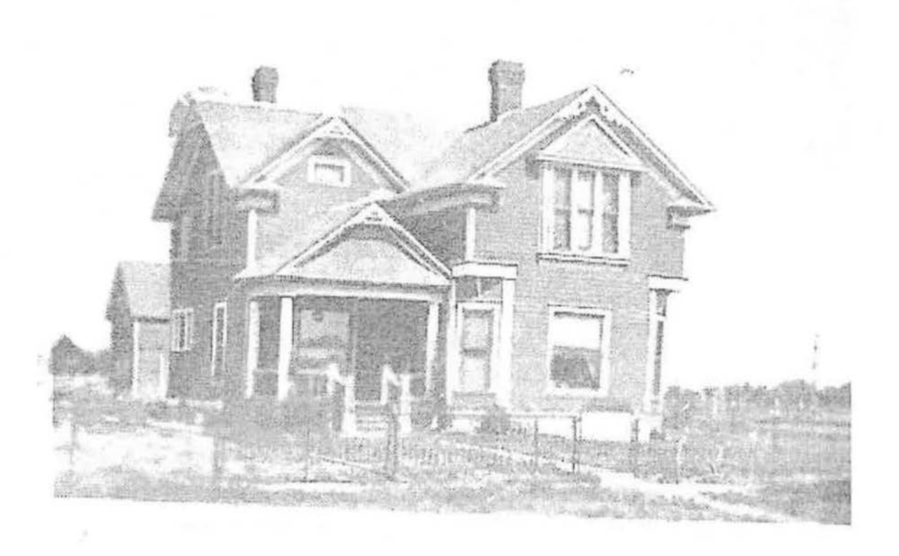
Figure 3: Washington House. East elevation. No date.

Washington, W. B. and Julia, House Name of Property