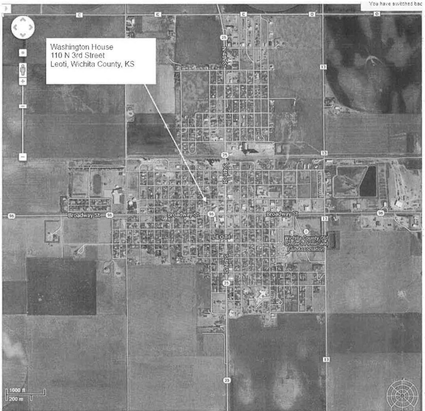
Figure 1: Contextual aerial image, Google 2014.