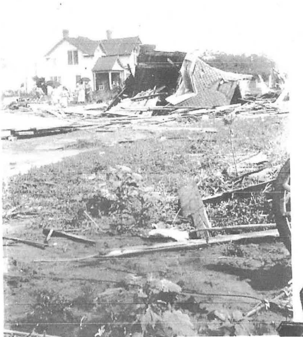
Figure 6: Washington House, 1923, shortly after tornado destroyed much of Leoti.