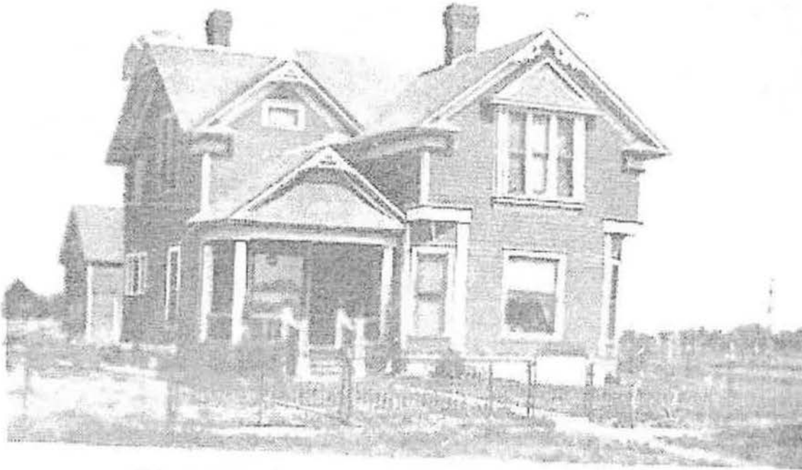
Figure 3: Washington House. East elevation. No date.