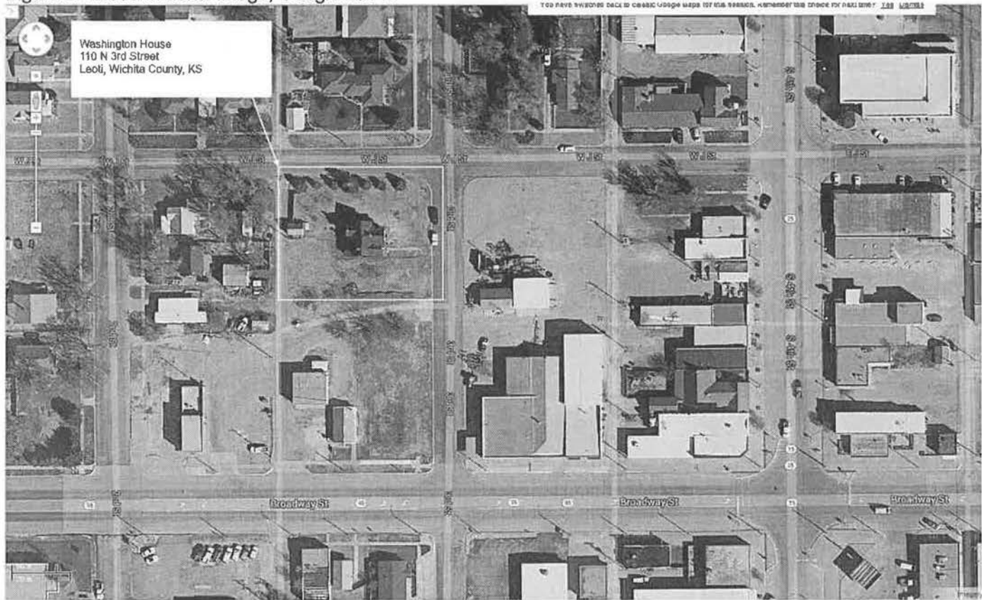
Figure 2: Close-in aerial image, Google 2014.