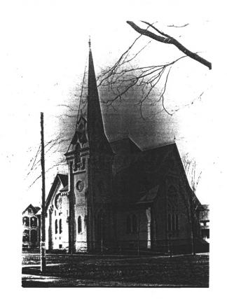
First Congregational Church, Michigan City, Indiana in 1904, before 1907 fire