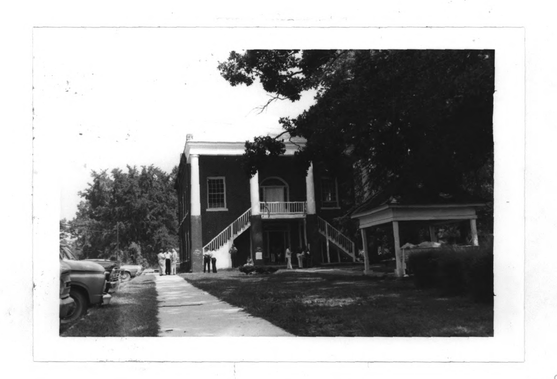
BANKS COUNTY COURTHOUSE

The interior of the courtroom has been changed little and has kept its integrity.