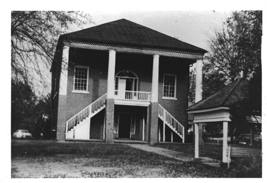
PAGE STEP ILL RECEIVED FEB 2 9 1980 NATIONAL REGISTER

ARCHITECTURAL SURVEY FORM BANKS COUNTY COURTHOUSE