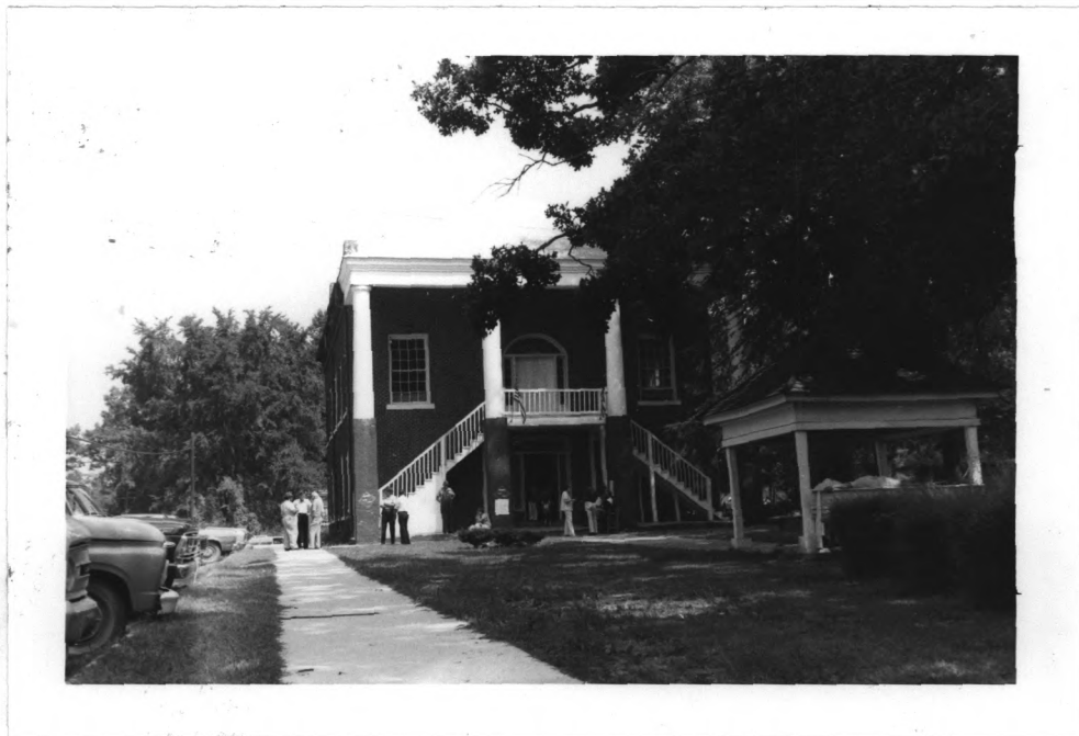
BANKS COUNTY COURTHOUSE

The interior of the courtroom has been changed little and has kept its integrity.