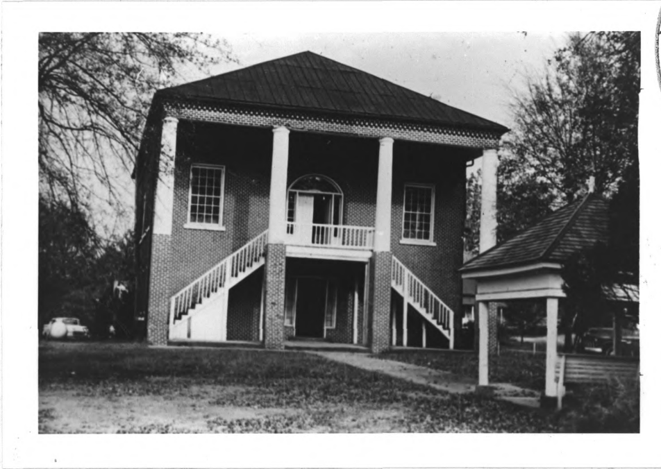
BEFORE PAINTING OF BRICK