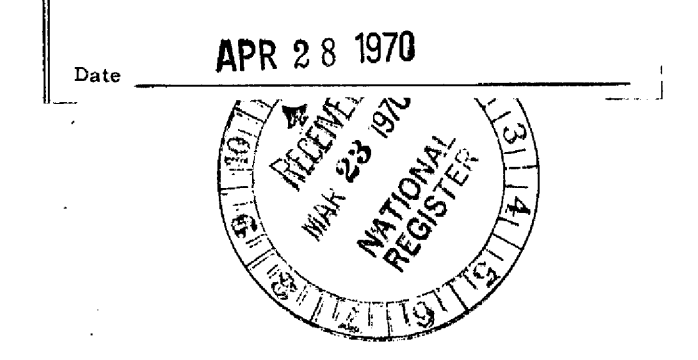
Chief, Office of Archeology and Historic Preservation

I hereby certify that this property is included in the National Register.