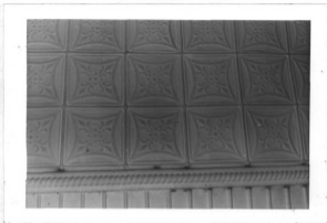
PRESSED METAL COURTROOM CEILING - DETAIL