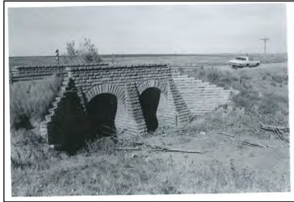
Pawnee River Tributary Bridge, Bazine vicinity (ca. 1928). NR-listed, 1985.