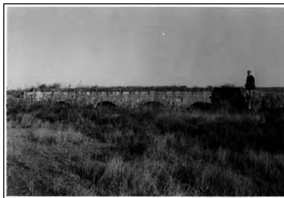
North Fork Walnut Creek Tributary Bridge, Beeler vicinity (ca. 1941). Only known quadruple arch in county.