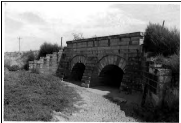
Bridge FS-530, Ness City vicinity (ca. 1933). Bridge to be replaced.