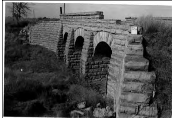
Walnut Creek Tributary Bridge, Bazine vicinity (ca. 1935).