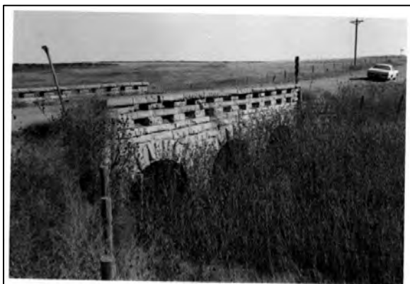
Bridge FS-450, Bazine vicinity (ca. 1935). Only known bridge in county with this decorative side rail.