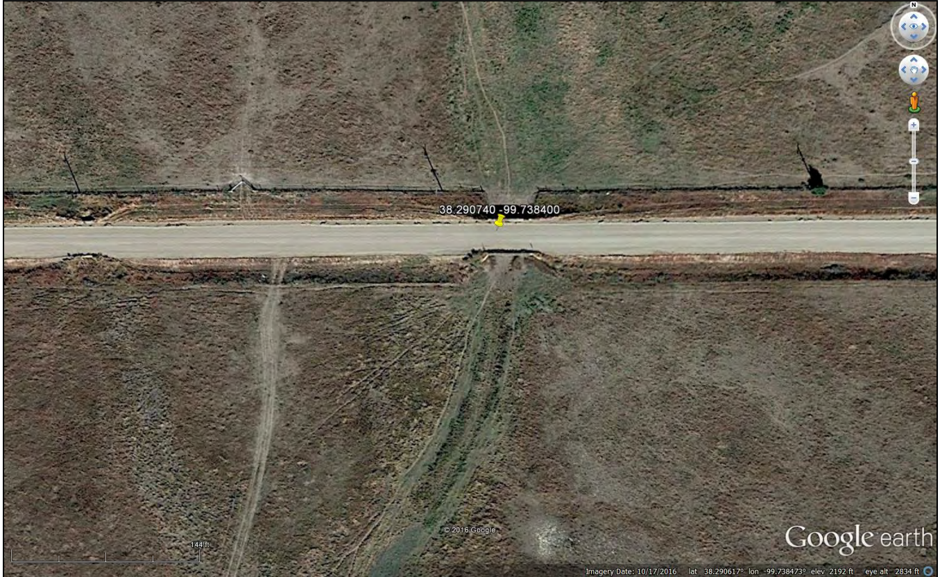
Boundary Map. 2016 Google aerial image, showing location of bridge along road.

Bazine vicinity, Ness County County and State