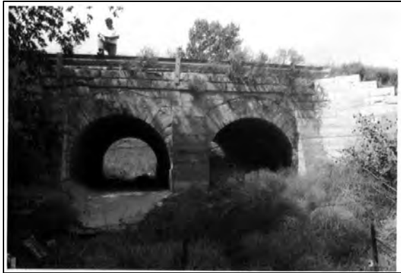
Bridge #680550, Ransom vicinity (ca. 1928).