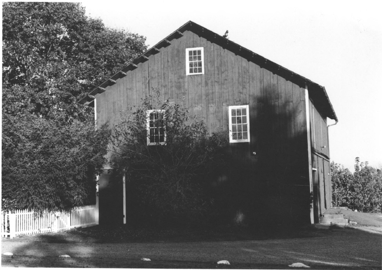
West end of Gulick Barn, looking east. The main doors are on the barely visible south wall. This mortised and tenoned brace-framed structure dates from ca. 1850, but incorporates parts of an older barn with hewn beams. This barn, 30 ft. by 40 ft., is about 90 ft. south of the Gulick House.

Gulick House 1978 South Brunswick west end of Middlesex County barn New Jersey 034