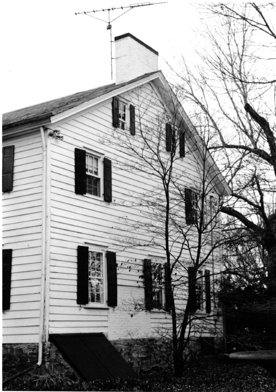
Southeast corner of Gulick House. This was built sometime after the first unit, but well before 1800, and probably before ca. 1770. This shows east end wall of this east segment, with brick chimney back behind the main fire place. Windows are 9/6 double hung on first floor, and 6/6 on second.

Gulick House 1978 South Brunswick southeast Middlesex County corner of New Jersey 034 house