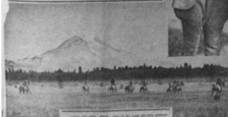
READY TO GO. One of the most attractive features of the Woodstock Hunt Club is the fact that it is open to all.