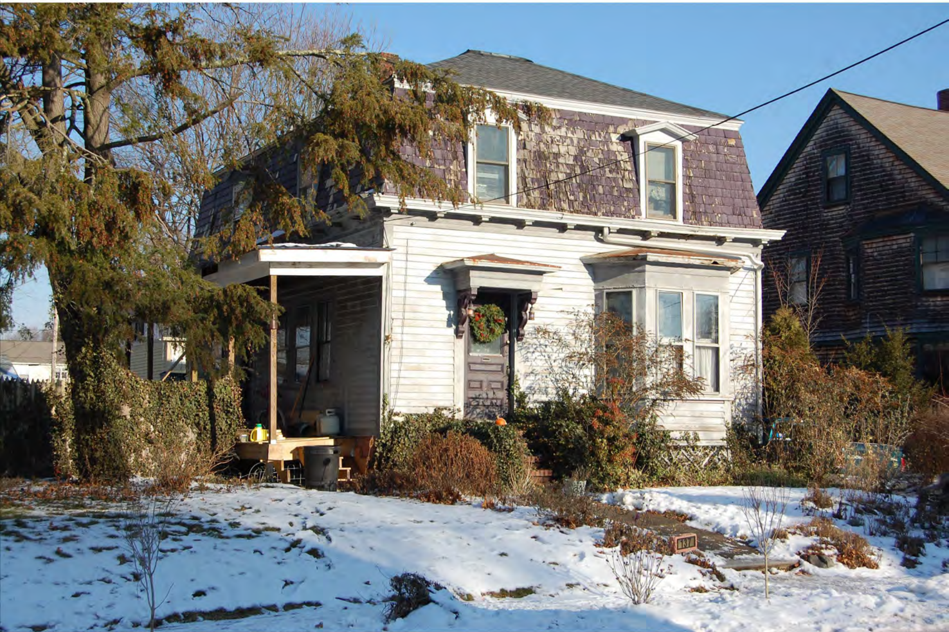
Edgewood Historic District - Anstis Greene Estate Plats Providence Co., RI Photo 7 of 13