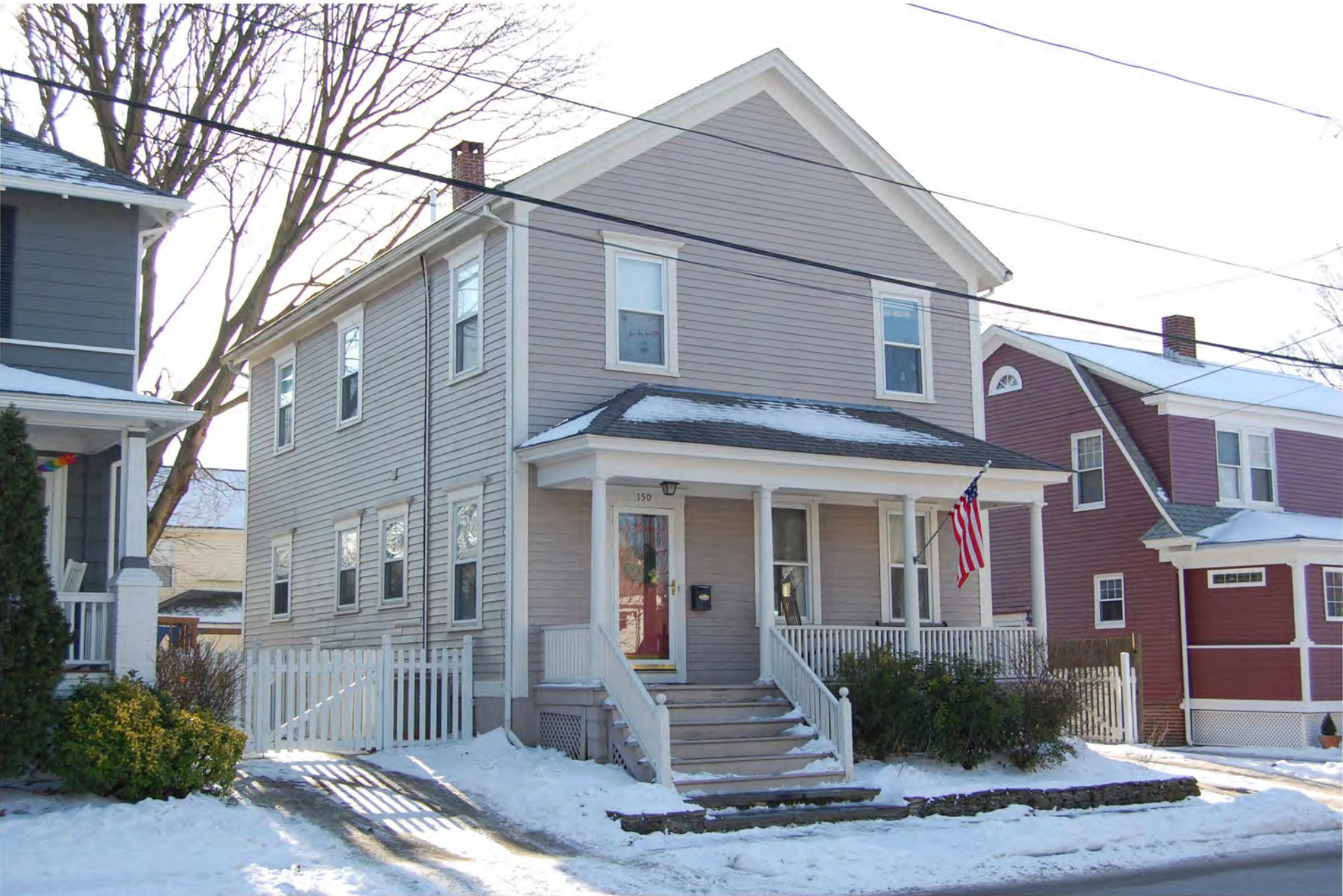
Edgewood Historic District - Anstis Greene Estate Plats Providence Co., RI Photo 6 of 13