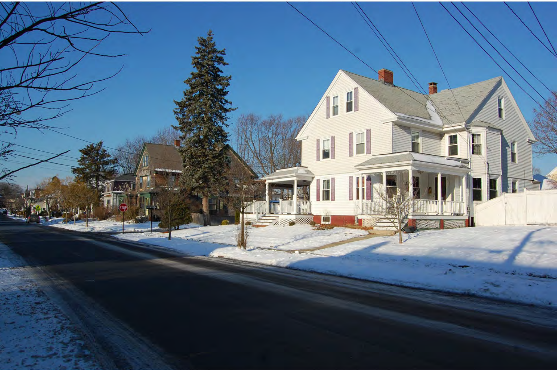
Edgewood Historic District - Anstis Greene Estate Plats Providence Co., RI Photo 1 of 13