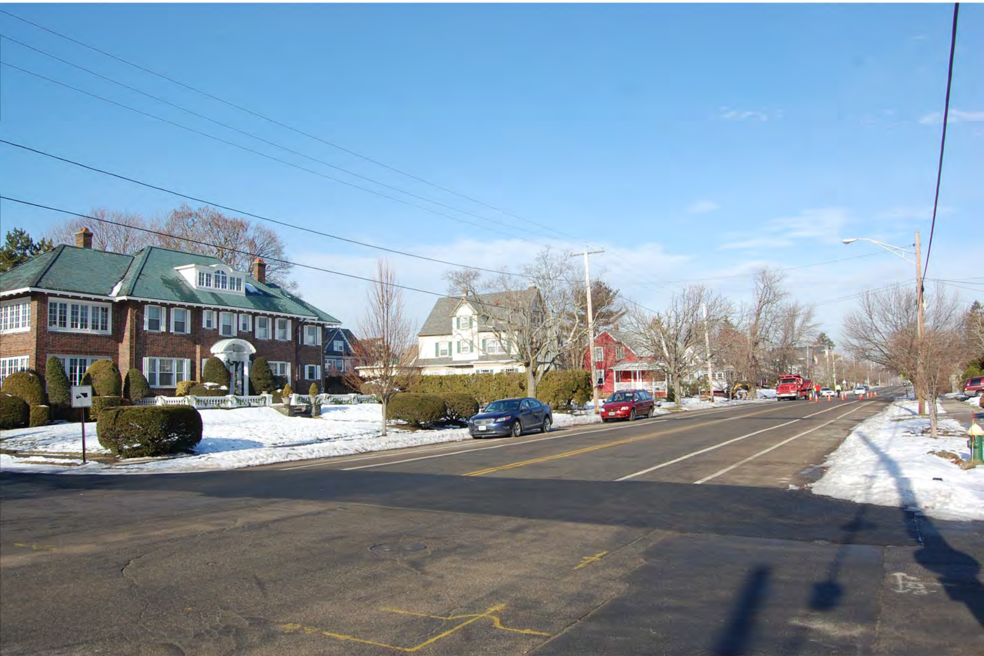
Edgewood Historic District - Anstis Greene Estate Plats Providence Co., RI Photo 4 of 13