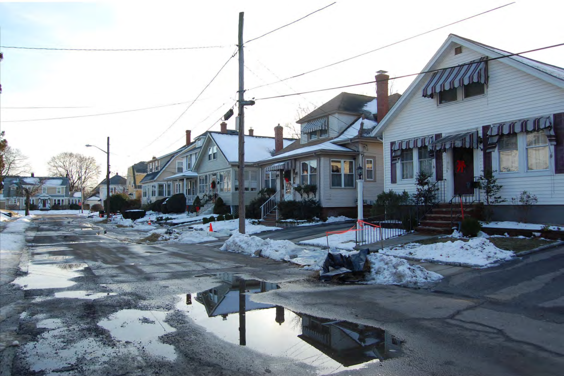
Edgewood Historic District - Anstis Greene Estate Plats Providence Co., RI Photo 9 of 13