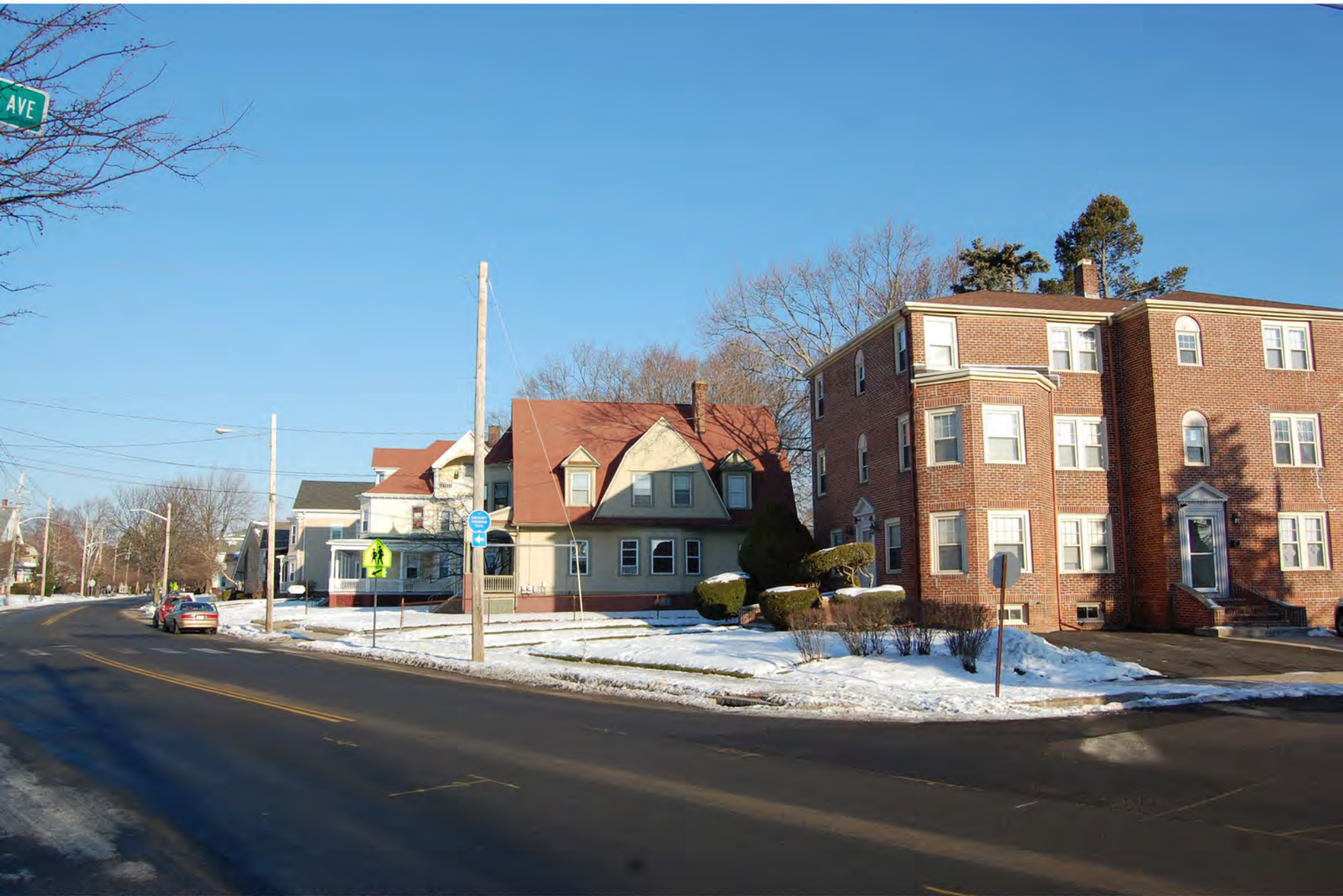
Edgewood Historic District - Anstis Greene Estate Plats Providence Co., RI Photo 3 of 13