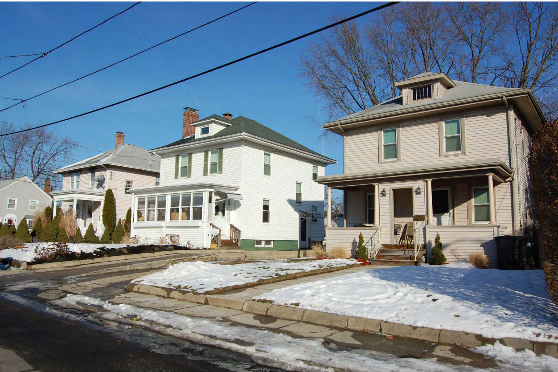
Edgewood Historic District - Anstis Greene Estate Plats Providence Co., RI Photo 13 of 13