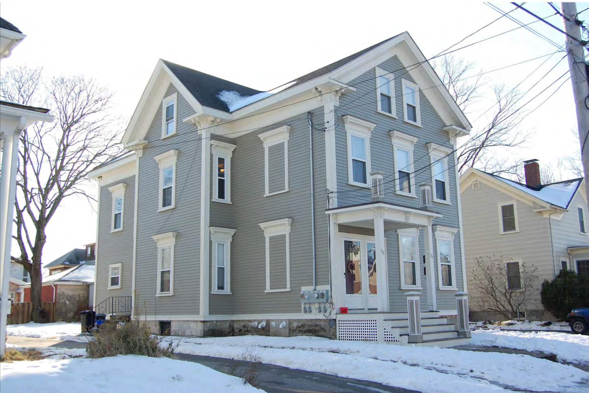
Edgewood Historic District - Anstis Greene Estate Plats Providence Co., RI Photo 8 of 13