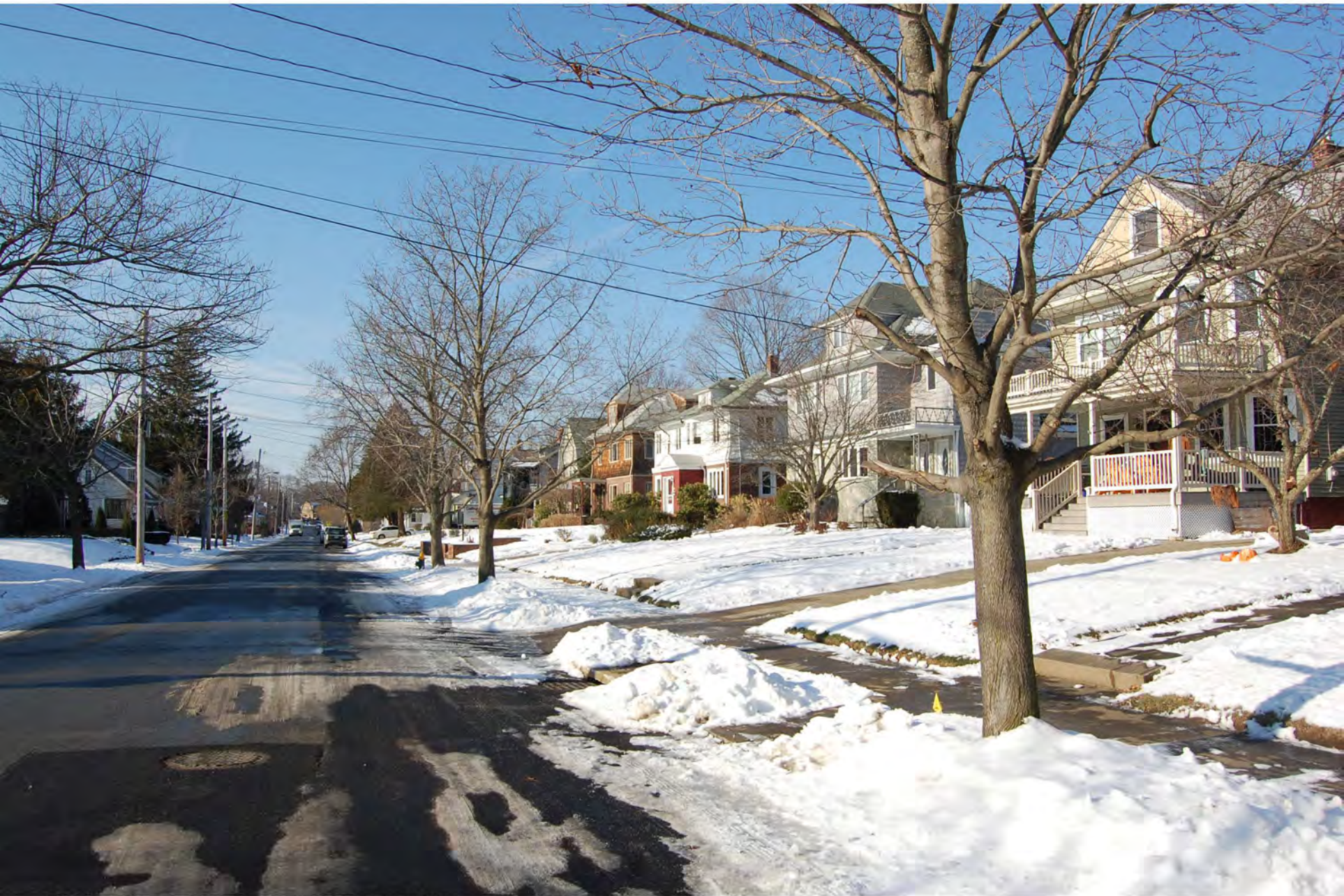
Edgewood Historic District - Anstis Greene Estate Plats Providence Co., RI Photo 2 of 13