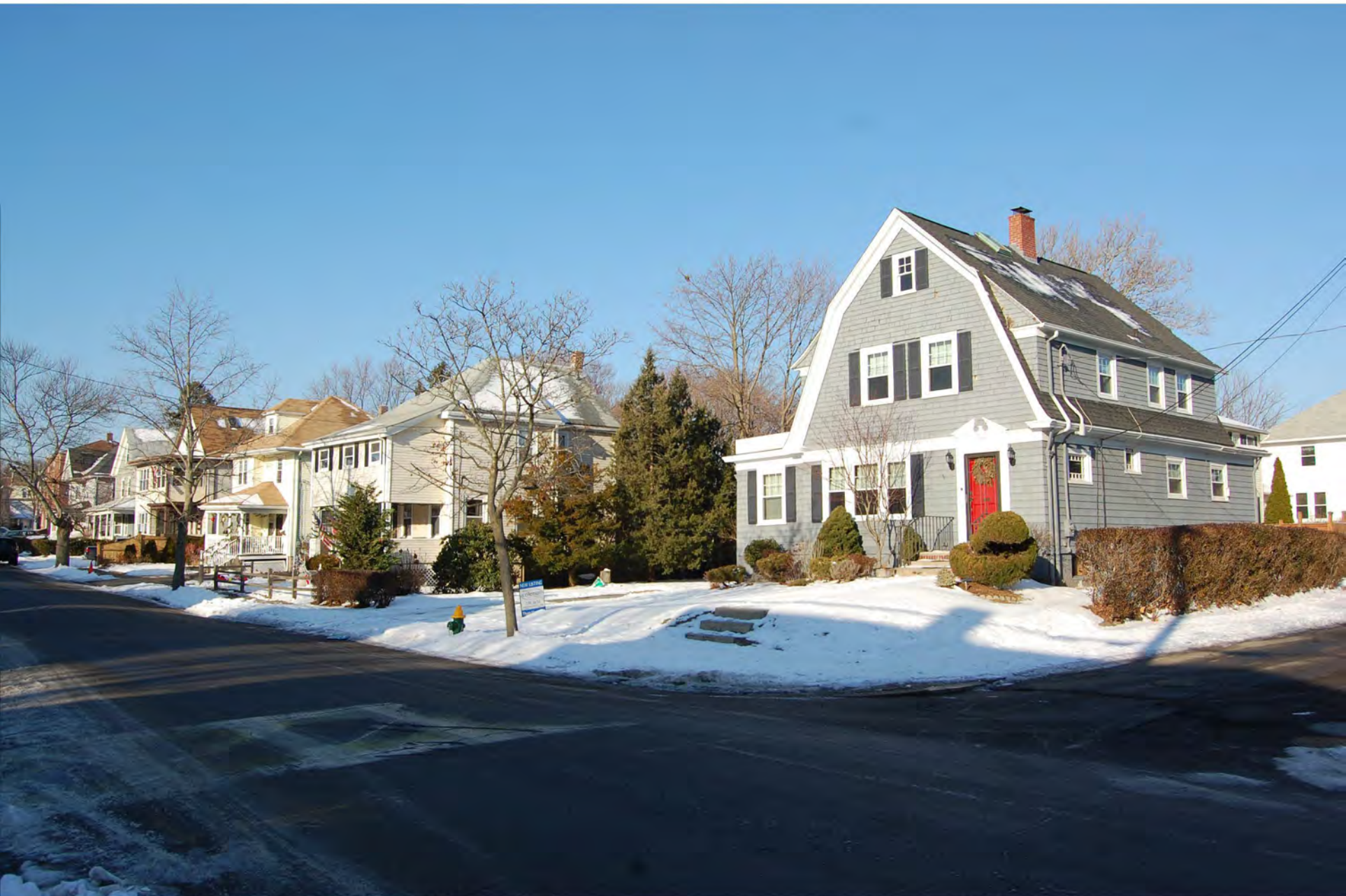
Edgewood Historic District - Anstis Greene Estate Plats Providence Co., RI Photo 11 of 13