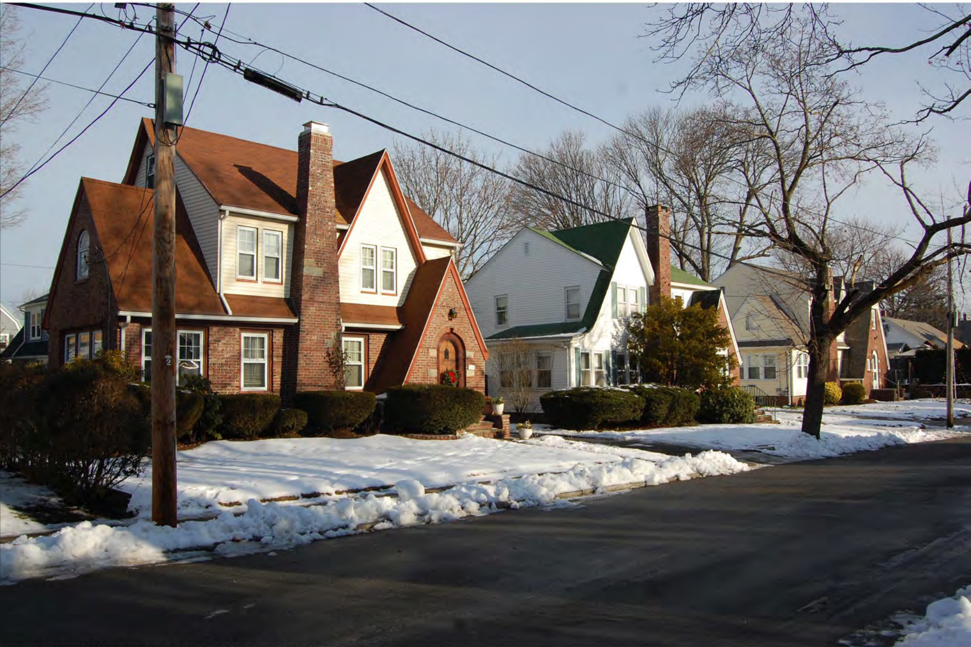
Edgewood Historic District - Anstis Greene Estate Plats Providence Co., RI Photo 10 of 13