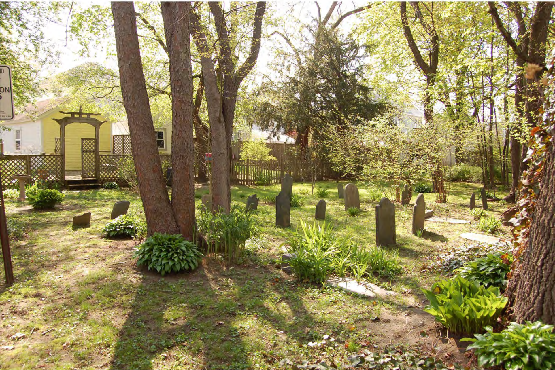
Edgewood Historic District - Anstis Greene Estate Plats Providence Co., RI Photo 5 of 13