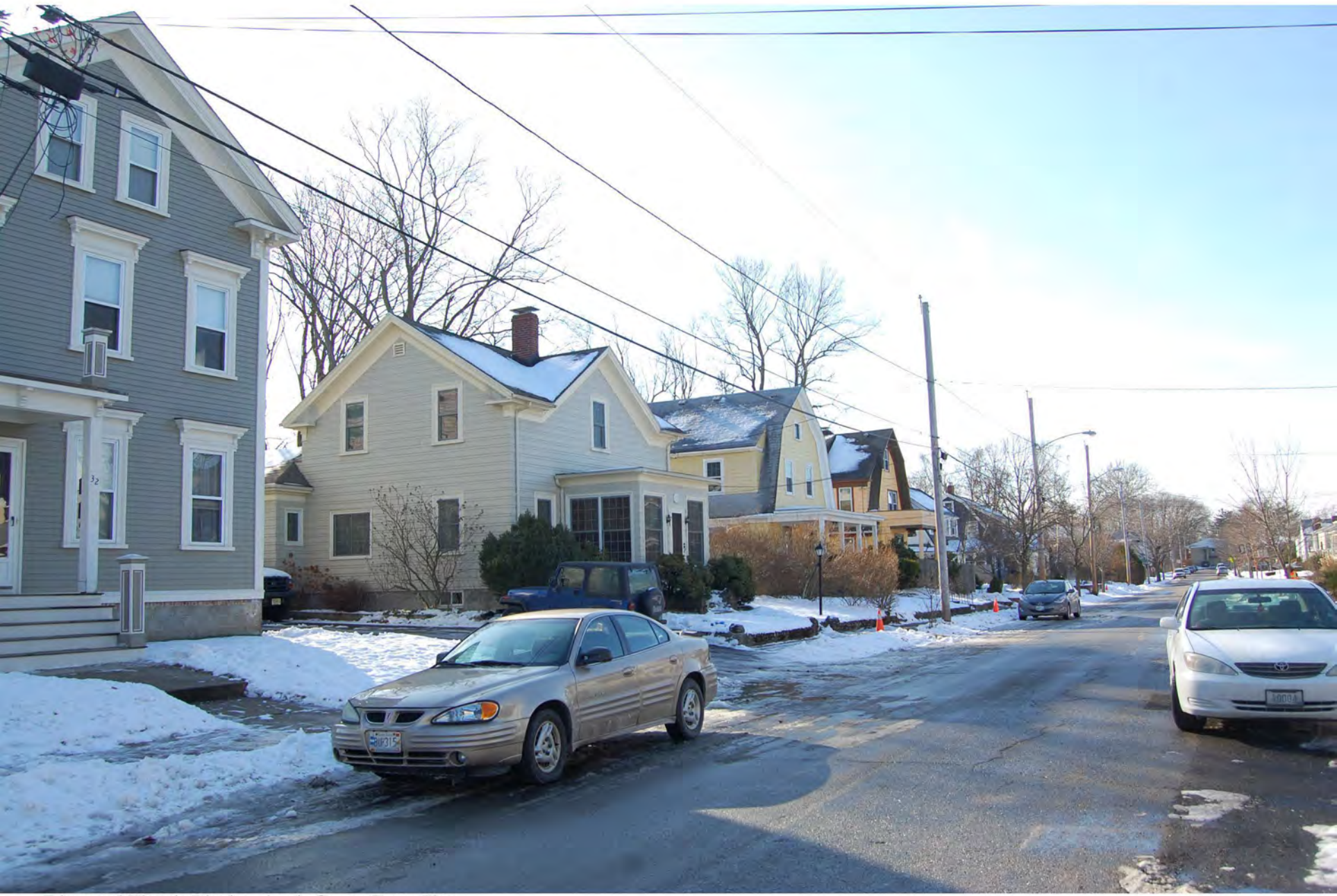
Edgewood Historic District - Anstis Greene Estate Plats Providence Co., RI Photo 12 of 13