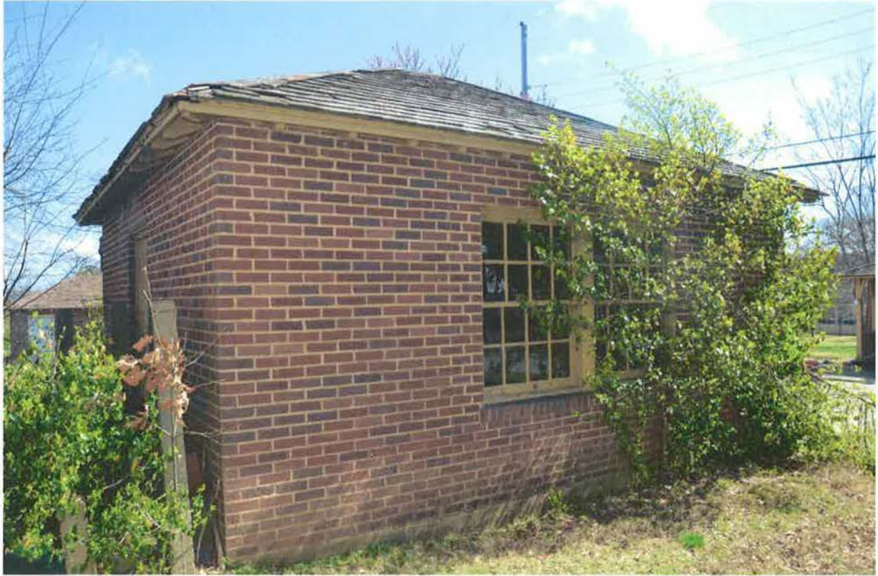
Figure 2: Garage of the V. C. Kays House, looking southeast, 2012.

Craighead County, Arkansas County and State