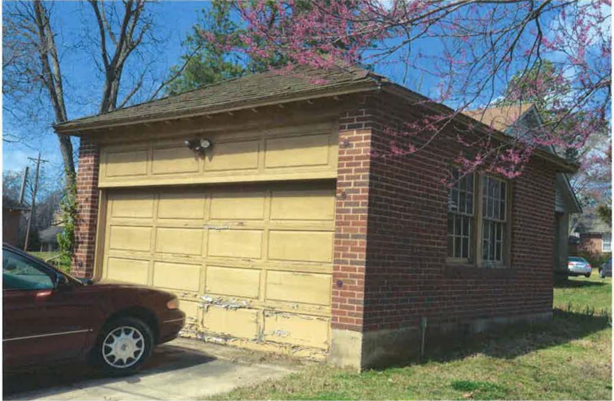
Figure 1: Garage of the V. C. Kays House, looking northwest, 2012.

Craighead County, Arkansas County and State