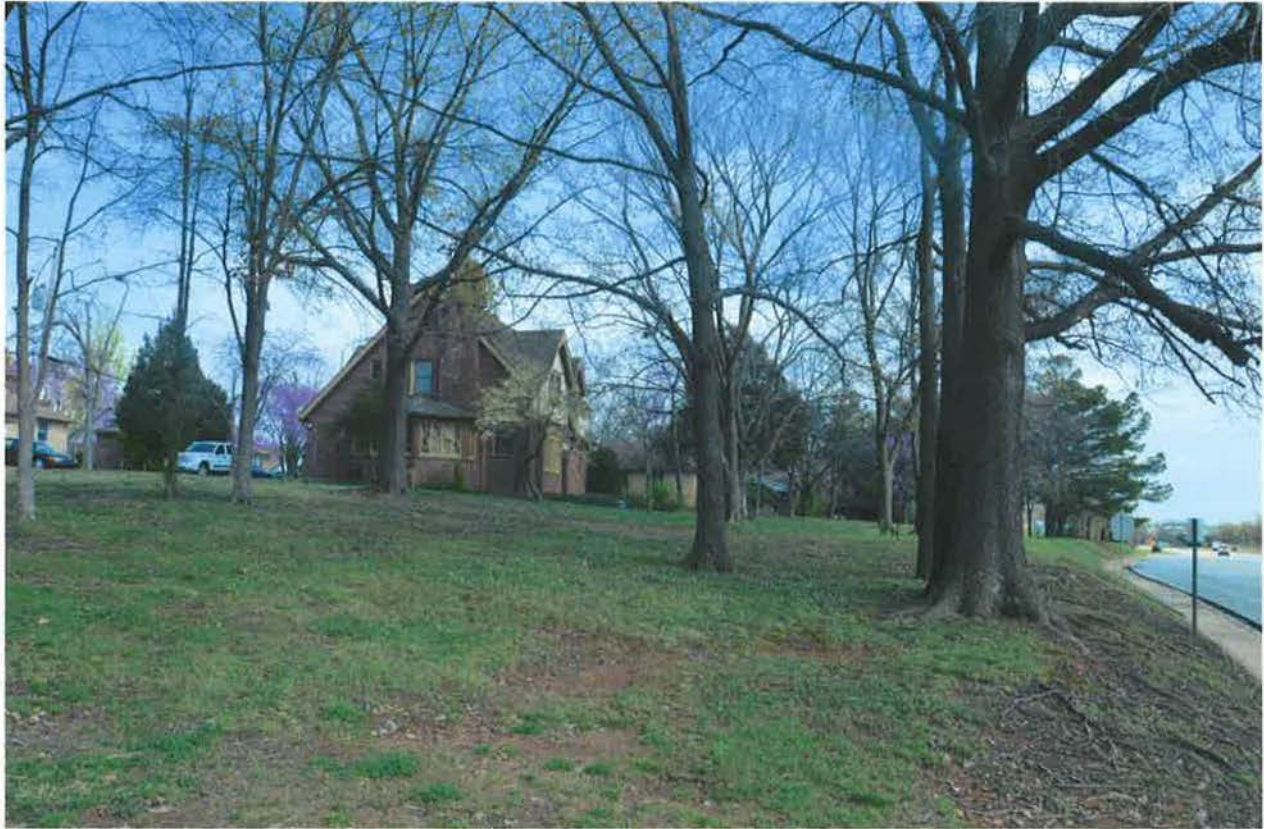
Figure 3: View of the V. C. Kays House and its surroundings, looking east, 2012.

Craighead County, Arkansas County and State