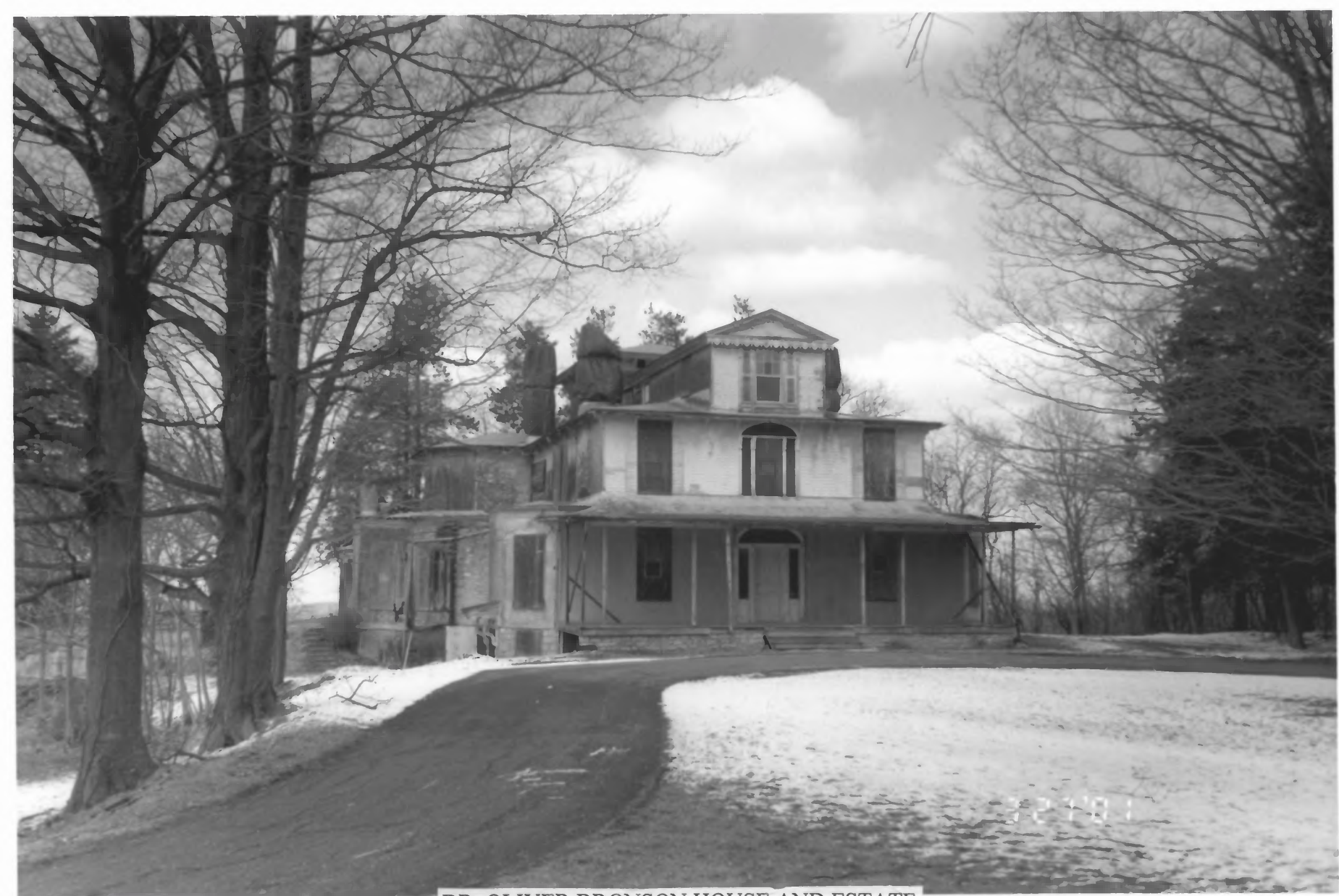
DR. OLIVER BRONSON HOUSE AND ESTATE Hudson, New York East and south elevations