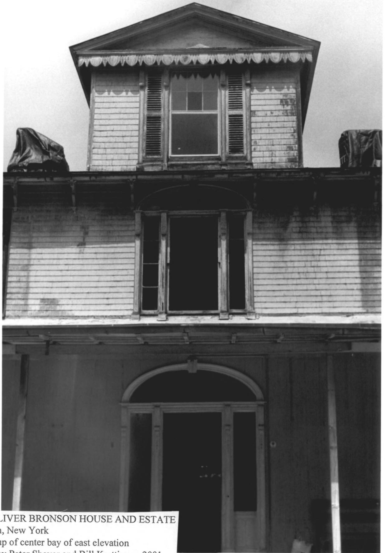
DR. OLIVER BRONSON HOUSE AND ESTATE Hudson, New York Close-up of center bay of east elevation