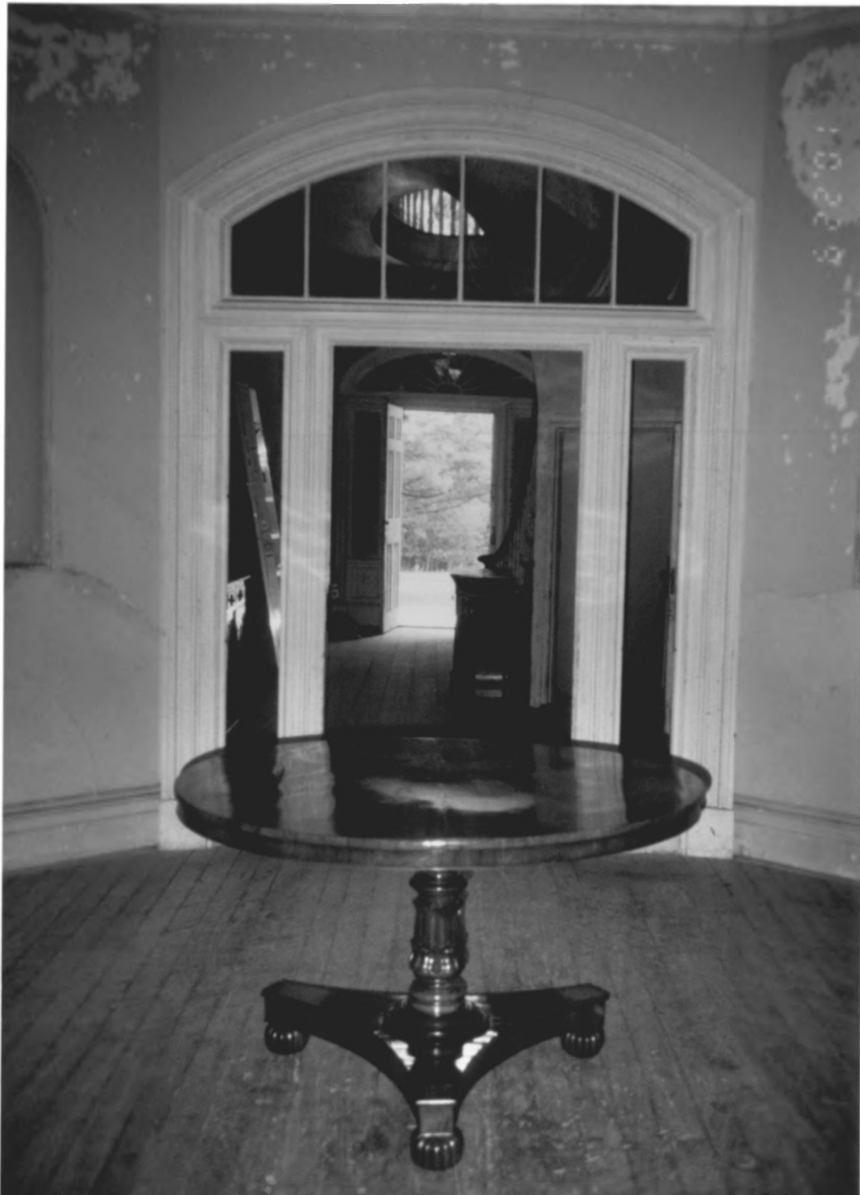
DR. OLIVER BRONSON HOUSE AND ESTATE Hudson, New York View from octagonal hall, first-story, toward east stair hall and vestibule