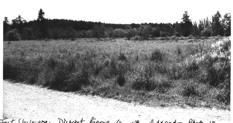
Fort Sterlacoon Disprict, Pierres Con with Addendum Photo 10