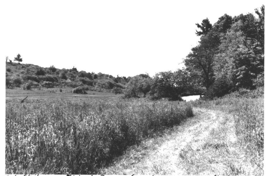
Fort Steilacoom District, Pierce Co, with Addendon Photo # 5