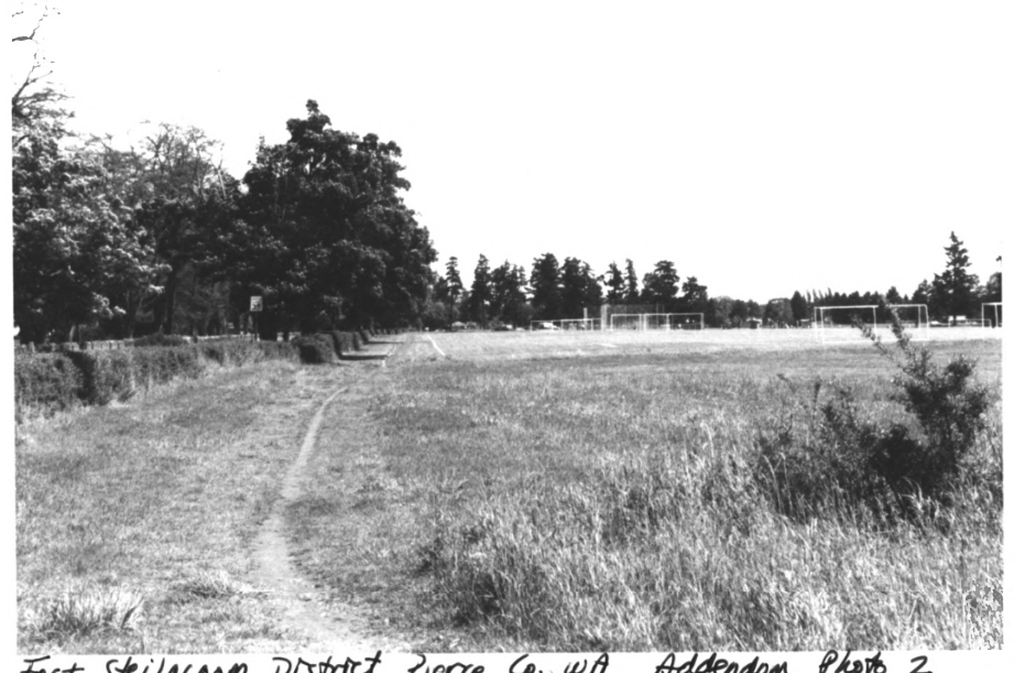
Fort Stellacoom District, Pierce Co., WA Adderdom Photo 2