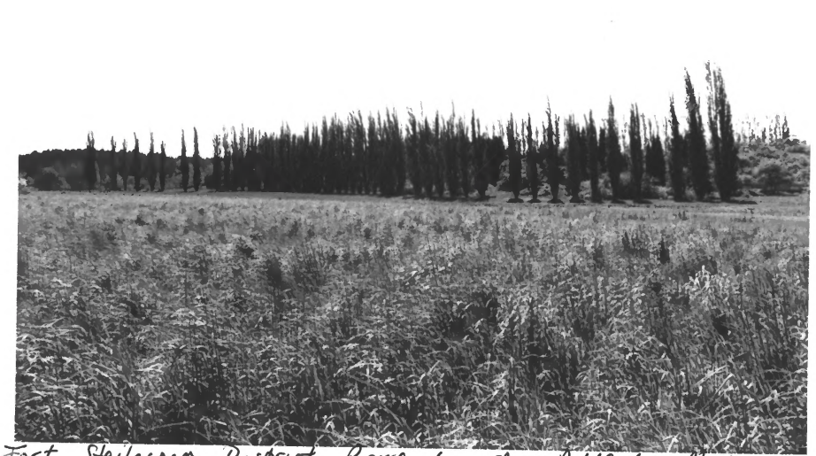
Fort Stellacoom District, Pierce Co., wit Addendum Photo 7