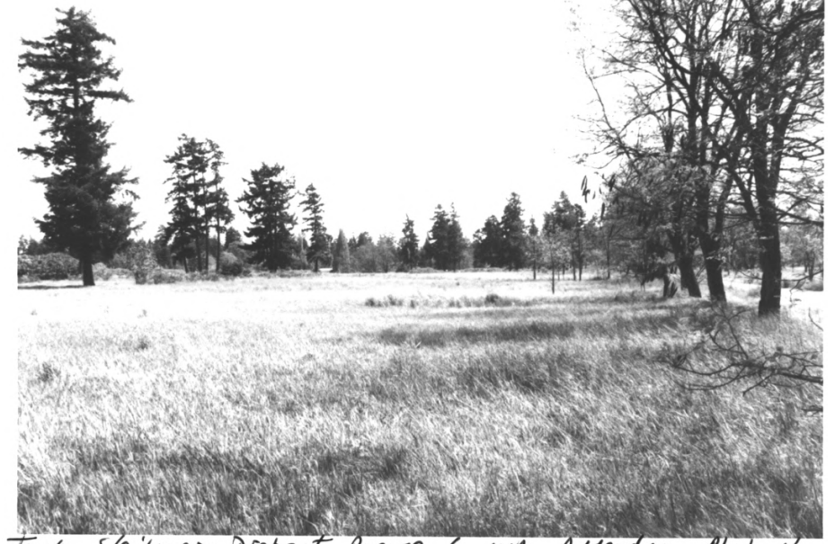
Fort Steilacoom Prostrict, Pierce Co, WA Addendum Photo 16