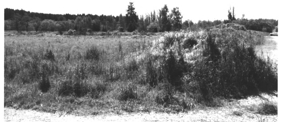
Fort Steilacoom District, Pierce Co., WA Addending Photo 9