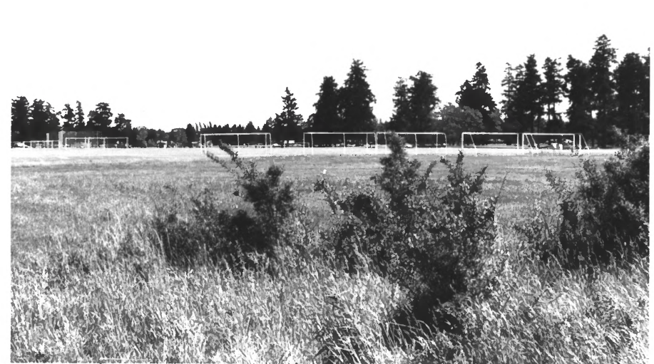
Fort Steilacoom District, Pierce Co., WA Addendum Photo 3