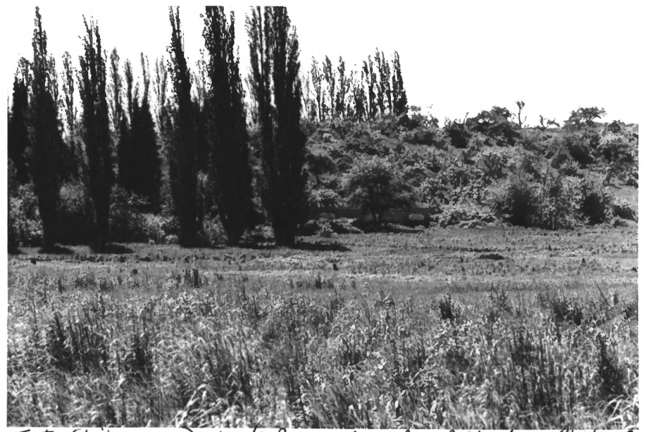
Fort Stelaeson Distret, Pierce Co., wit Addendum Photo 8