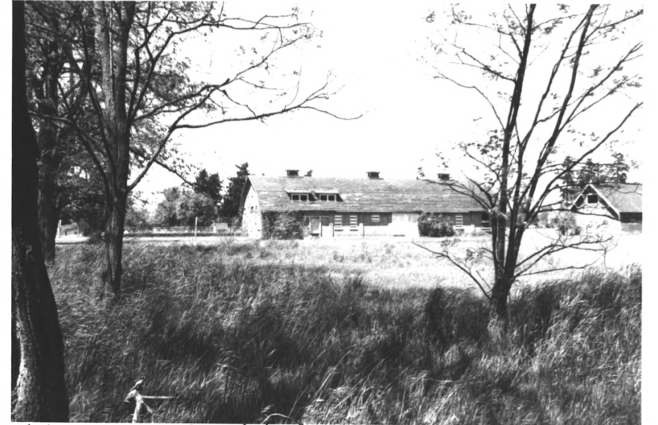
Fort Stellacoom District, Pierce Co, wa Photo 12 Addardon