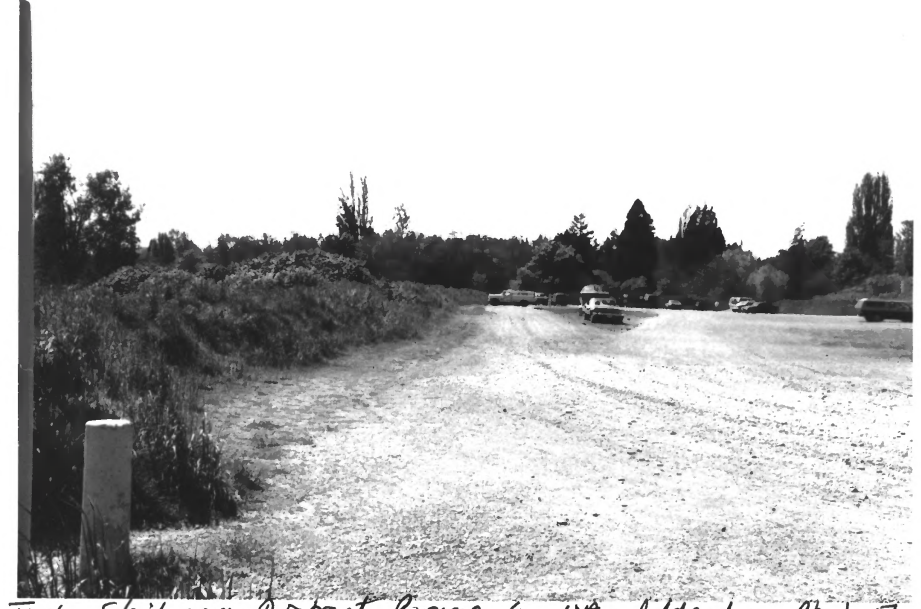
ort Steila com Protrict, Pierce a, WA Addendum Photo 17